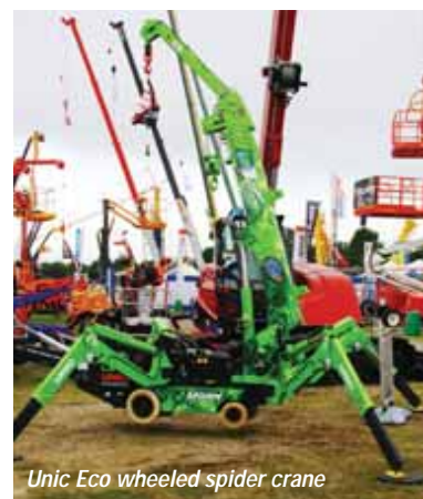
Unic Eco wheeled spider crane