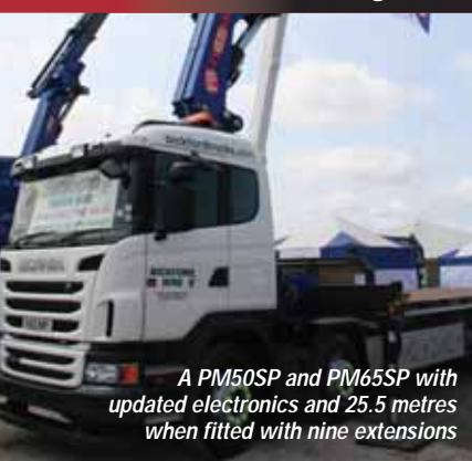
A PM50SP and PM65SP with updated electronics and 25.5 metres when fitted with nine extensions