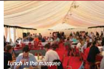
Lunch in the marquee