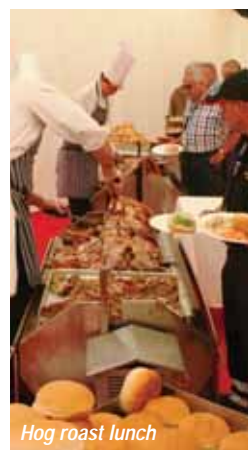
Hog roast lunch