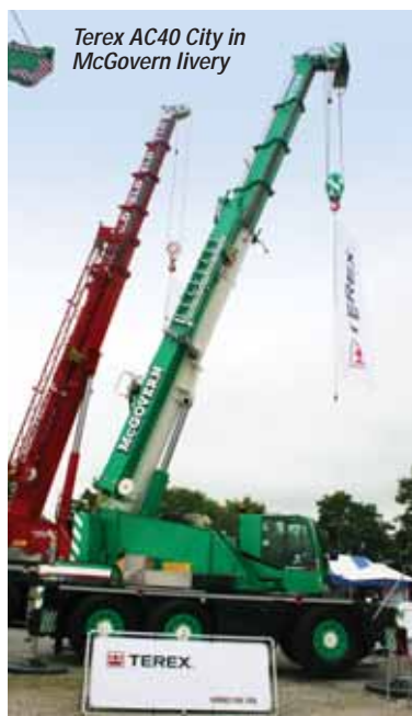
Terex AC40 City in McGovern livery