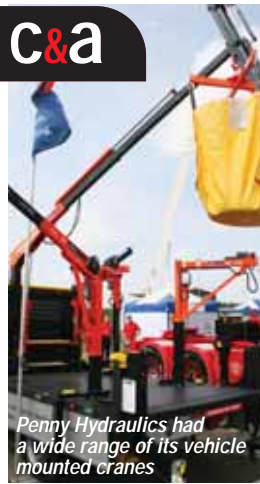
Penny Hydraulics had a wide range of its vehicle mounted cranes