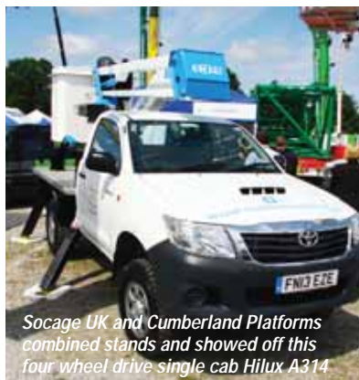
Socage UK and Cumberland Platforms combined stands and showed off this four wheel drive single cab Hilux A314