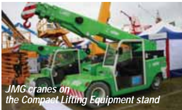
JMG cranes on the Compact Lifting Equipment stand