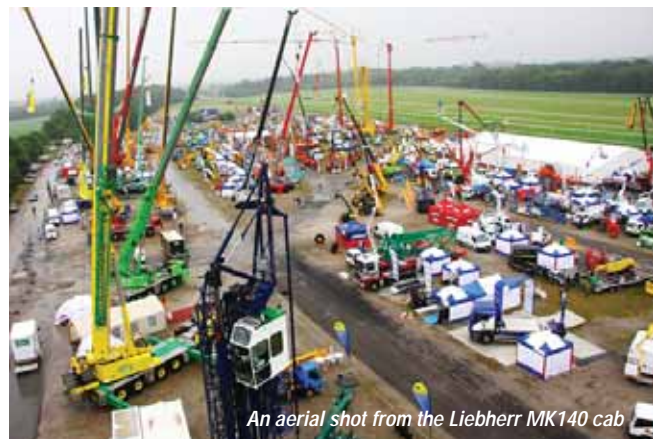
An aerial shot from the Liebherr MK140 cab