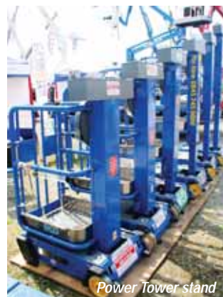
Power Tower stand