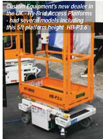
Custom Equipment's new dealer in the UK - Hy-Brid Access Platforms - had several models including this 5ft platform height HB-P3.6