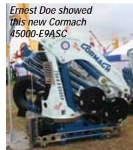
Ernest Doe showed this new Cormach 45000-E9ASC