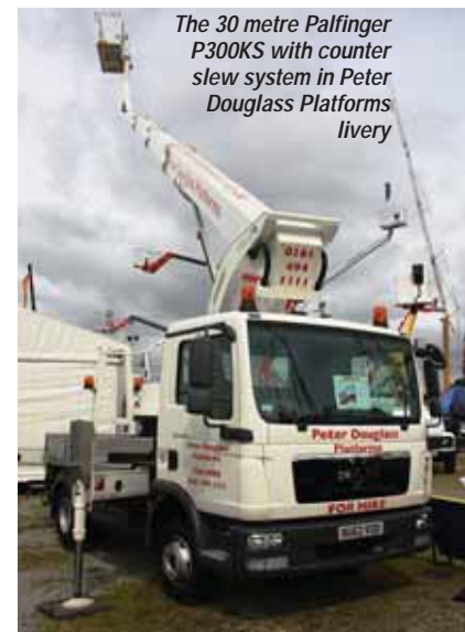
The 30 metre Palfinger P300KS with counter slew system in Peter Douglas Platforms livery