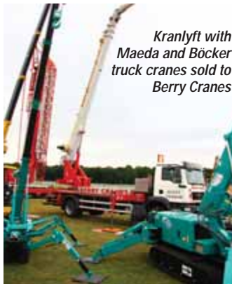
Kranlyft with Maeda and Böcker truck cranes sold to Berry Cranes

Pick&carry cranes were also well represented with the dealers for Italian companies Valla, Ormig, Galizia and JMG all showing product. Paus (GGR) and Böcker represented the aluminium trailer and truck mounted cranes with Böcker UK distributor Kranlyft finalising the sale of a truck mounted crane at the show.