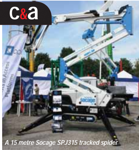
A 15 metre Socage SPJ315 tracked spider