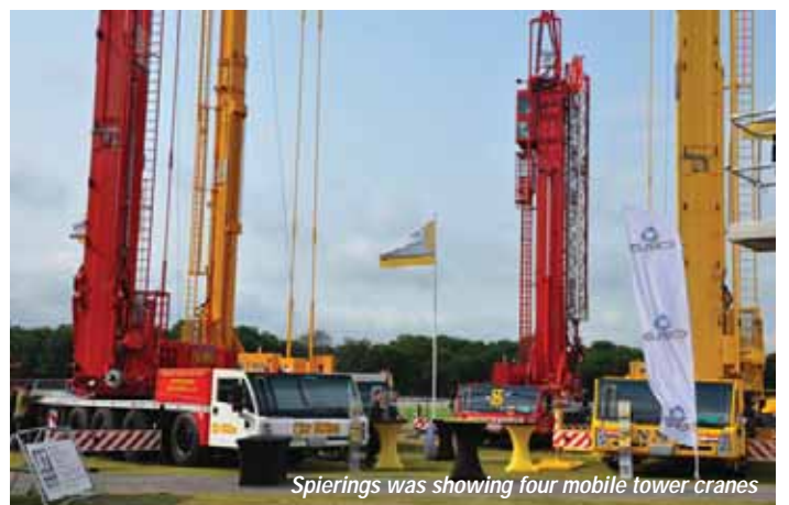
Spierings was showing four mobile tower cranes