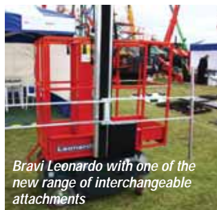
Bravi Leonardo with one of the new range of interchangeable attachments