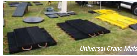
Universal Crane Mats