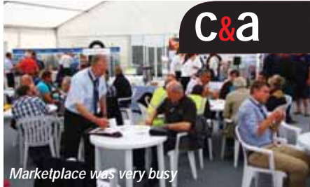
Marketplace was very busy