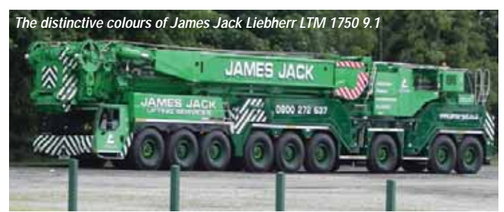
The distinctive colours of James Jack Liebherr LTM 1750 9.1