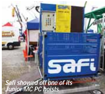
Safi showed off one of its Junior MC PC hoists