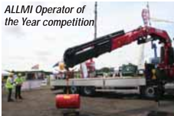
ALLMI Operator of the Year competition