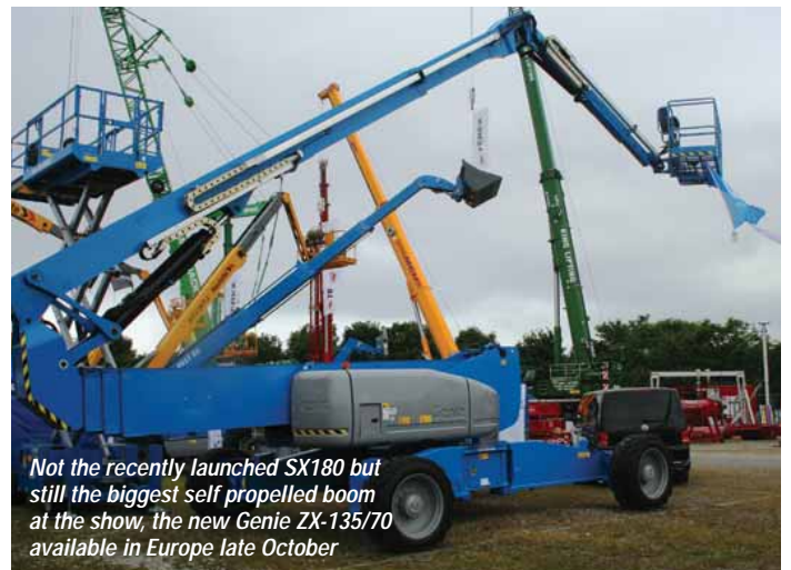
Not the recently launched SX180 but still the biggest self propelled boom at the show, the new Genie ZX-135/70 available in Europe late October