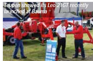
Teupen showed its Leo 21GT recently launched at Bauma