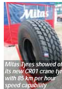
Mitas Tyres showed off its new CR01 crane tyre with 85 km per hour speed capability