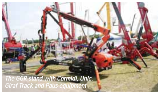
The GGR stand with Cormidi, Unic, Giraf Track and Paus equipment