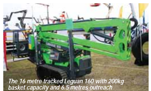
The 16 metre tracked Leguan 160 with 200kg basket capacity and 6.5 metres outreach