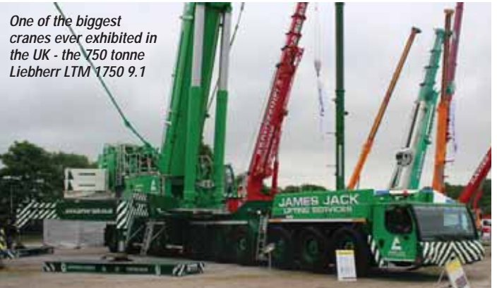
One of the biggest cranes ever exhibited in the UK - the 750 tonne Liebherr LTM 1750 9.1

This year's Vertikal Days was the biggest yet in terms of exhibitor and visitor numbers. The sun shone on the first day and with many exhibits new to the UK, visitor numbers reached record levels. There were many comments about how busy the show appeared and this was reinforced by preliminary figures indicating more than 1,800 unique visitors - up about eight percent on last year's levels. If the second day returns are added in the numbers are well over 2,100.