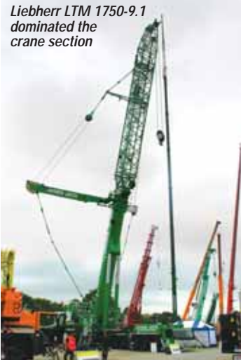
Liebherr LTM 1750-9.1 dominated the crane section