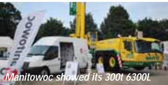
Manitowoc showed its 300t 6300L