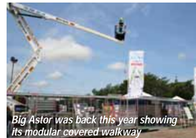
Big Astor was back this year showing its modular covered walkway