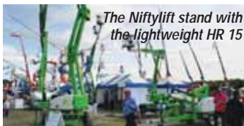
The Niftylift stand with the lightweight HR 15