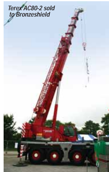
Terex AC80-2 sold to Bronzeshield