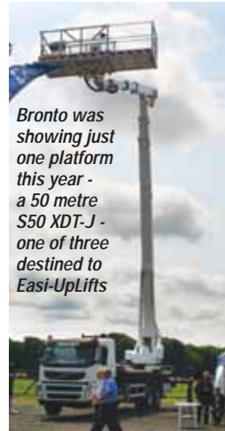
Bronto was showing just one platform this year - a 50 metre S50 XDT-J - one of three destined to East-UpLifts