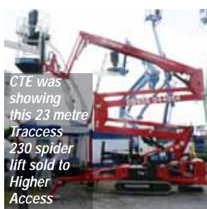
CTE was showing this 23 metre Tracess 230 spider lift sold to Higher Access