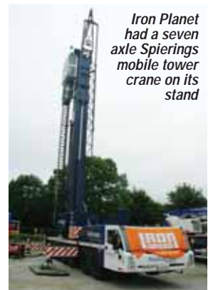
Iron Planet had a seven axle Spierings mobile tower crane on its stand