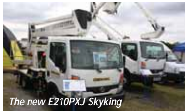
The new E210PXJ Skyking