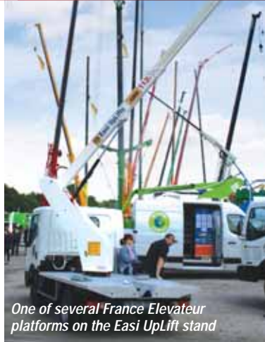
One of several France Elevateur platforms on the Easi UpLift stand