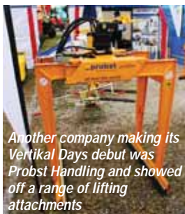
Another company making its Vertikal Days debut was Probst Handling and showed off a range of lifting attachments