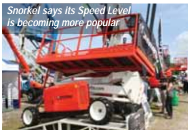
Snorkel says its Speed Level is becoming more popular