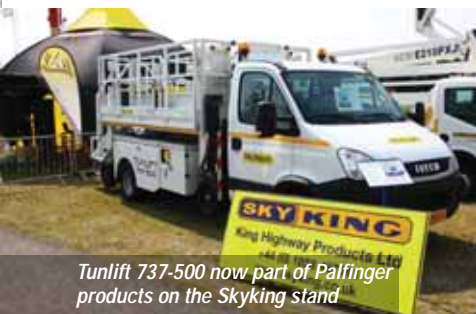
Tunlift 737-500 now part of Palfinger products on the Skyking stand