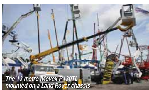
The 13 metre Movex P130TL mounted on a Land Rover chassis