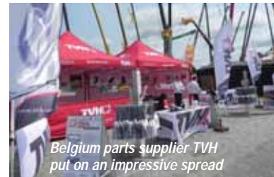
Belgium parts supplier TVH put on an impressive spread