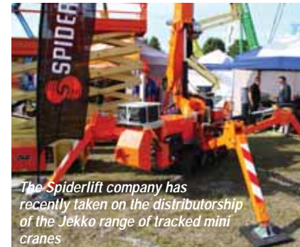
The Spiderlift company has recently taken on the distributorship of the Jekko range of tracked mini cranes