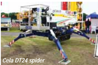
Cela DT24 spider