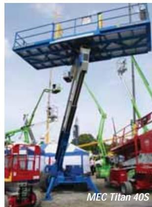
MEC Titan 40S