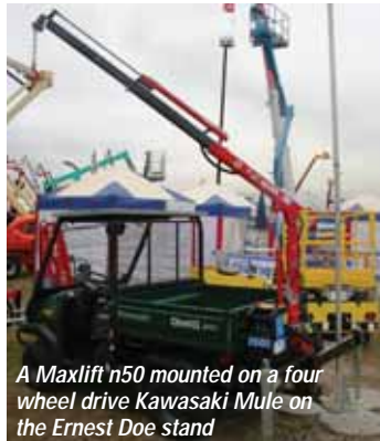
A Maxlift n50 mounted on a four wheel drive Kawasaki Mule on the Ernest Doe stand