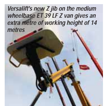
Versalift's new Z jib on the medium wheelbase ET 39 LF Z van gives an extra metre of working height of 14 metres