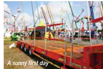
A sunny first day