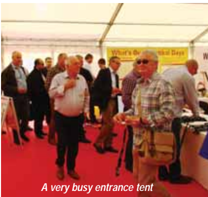
A very busy entrance tent

For the vast majority of visitors - those not making it to Bauma - this year's Vertikal Days was full of new products. With more exhibitors, seminars and an expanded Marketplace - which included the PASMA theatre - there was plenty to see and do.