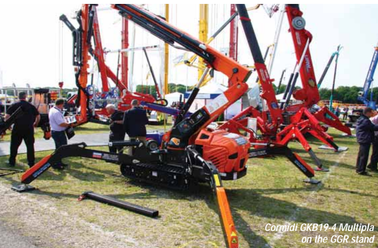
Cormidi GKB19-4 Multipla on the GGR stand

Rounding off the equipment highlights, JCB was back again, this time with the largest fixed frame telehandler produced in Europe - the 20 metre 540-200, joining a good range of telehandlers from JLG, Genie and Manitou.