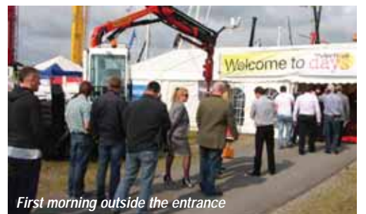
First morning outside the entrance