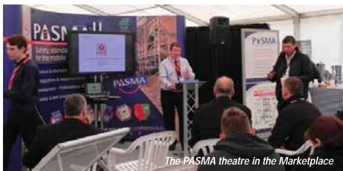
The PASMA theatre in the Marketplace

alongside a 40 tonne AC40 City for McGovern, a 60 tonne Challenger 3180 and an AC140 in King Lifting colours. Crowland Cranes had the latest version of the Zoomlion ZTC350 truck crane mounted on a Mercedes Actros chassis, alongside a refurbished Tadano TS75 remounted on a new DAF LF45 chassis. Crowland is able to refurbish similar cranes on an exchange basis for about £40-45,000 - a very good deal considering the rental rates these smaller cranes command.