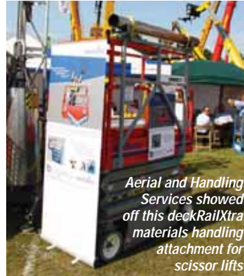
Aerial and Handling Services showed off this deckRailXtra materials handling attachment for scissor lifts