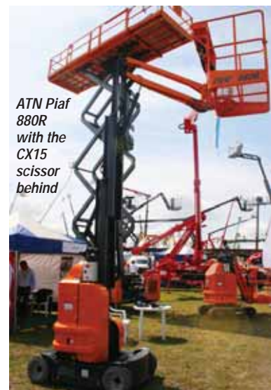
ATN Pfaf 880R with the CX15 scissor behind