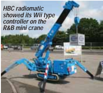
HBC radiomatic showed its Wii type controller on the R&B mini crane