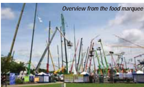
Overview from the food marquee