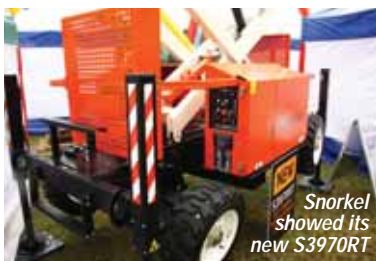
Snorkel showed its new S3970RT