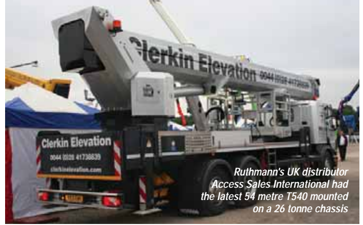
Ruthmann's UK distributor Access Sales International had the latest 54 metre T540 mounted on a 26 tonne chassis

Another slightly unusual machine on its stand was the multi-purpose pole erecting unit mounted on a