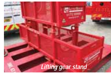
Lifting gear stand