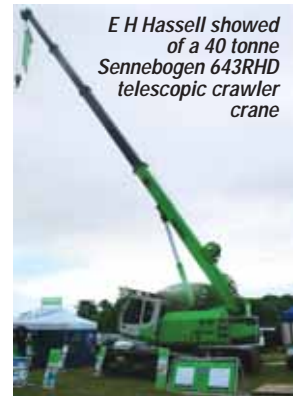
E H Hassell showed of a 40 tonne Sennebogen 643RHD telescopic crawler crane