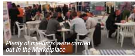
Plenty of meetings were carried out in the Marketplace