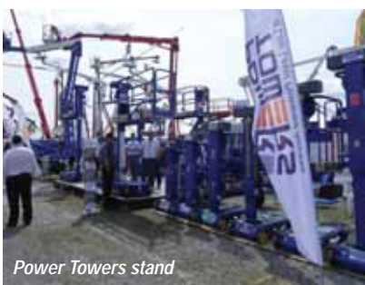
Power Towers stand