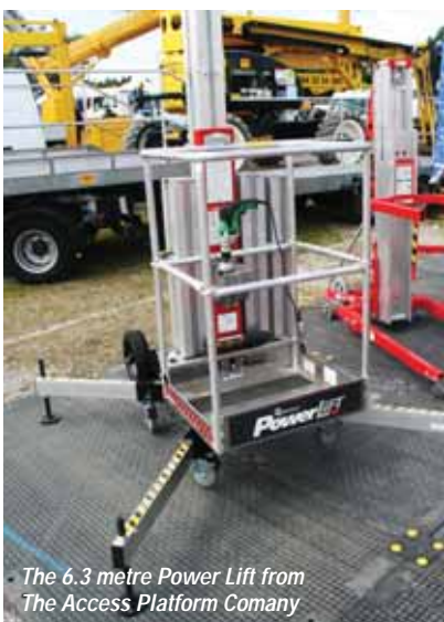
The 6.3 metre Power Lift from The Access Platform Comany