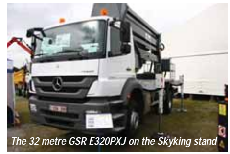
The 32 metre GSR E320PXJ on the Skyking stand