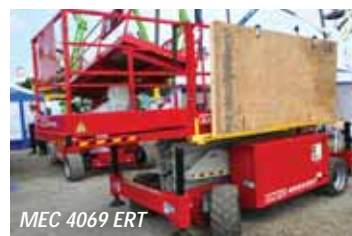
MEC 4069 ERT