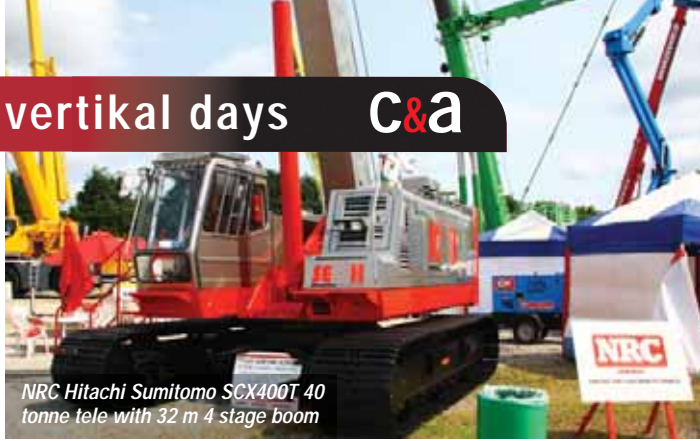
NRC Hitachi Sumitomo SCX400T 40 tonne tele with 32 m 4 stage boom

Perhaps it is a sign that crawler telescopic cranes are growing in popularity in that both NRC and E H Hassell both exhibited models. NRC showed - the 70 tonne Link Belt TCC-750 and the 40 tonne Hitachi Sumitomo SCX400T. Sennebogen dealer EH Hassell had the 40 tonne 643RHD - a four section 30 metre boom with 13 metre bi-fold swing away extension.