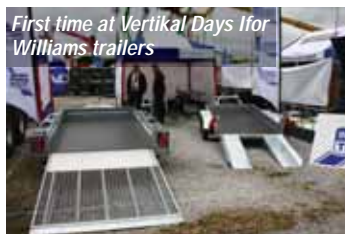
First time at Vertikal Days Ifor Williams trailers