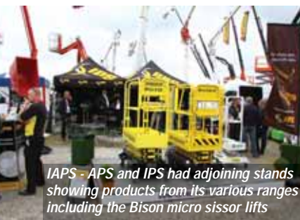
IAPS - APS and IPS had adjoining stands showing products from its various ranges including the Bison micro scissor lifts