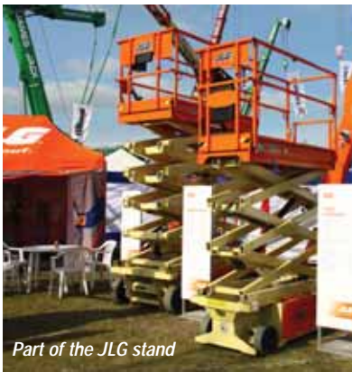
Part of the JLG stand