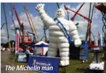
The Michelin man