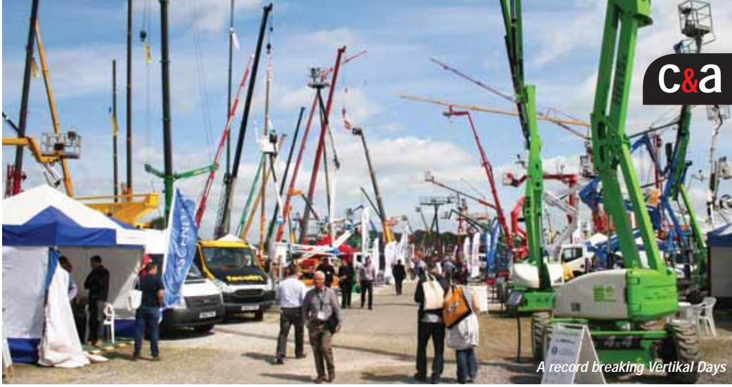
A record breaking Vertikal Days