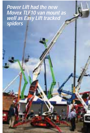
Power Lift had the new Movex TLF10 van mount as well as Easy Lift tracked spiders