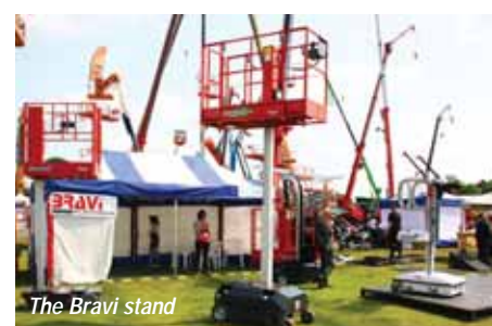
The Bravi stand