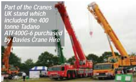
Part of the Cranes UK stand which included the 400 tonne Tadano ATF400G-6 purchased by Davies Crane Hire