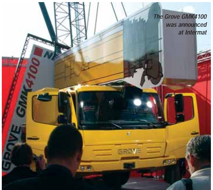
The Grove GMK4100 was announced at Intermat

it will be called, uses the same 10 to 17 metre swingaway as the standard crane, offering an 83 metre tip height when the five metre insert is added. 12 tonne axle loadings will be achievable with 6.3 tonnes of counterweight, 16.00 tyres and a 20 tonne hook block.