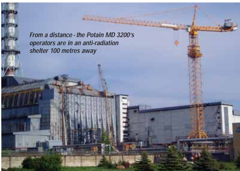
From a distance - the Potain MD 3200's operators are in an anti-radiation shelter 100 metres away

The crane's operators are located 100 metres from the reactor and operate the unit by remote control from an anti-radiation shelter. Cameras attached to the crane allow the operators to monitor lifting operations, while feedback screens show the precise position of the load. The MD 3200 travels to and from the power plant wall on a 15 metre wide, 100 metre long track. The MD 3200 has a hook height of 72 metres and can handle up to 80 tonnes on six falls of cable, with a capacity of 39 tonnes at the tip of its 70 metre jib.