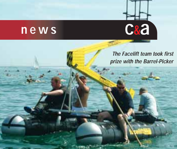
The Facelift team took first prize with the Barrel-Picker