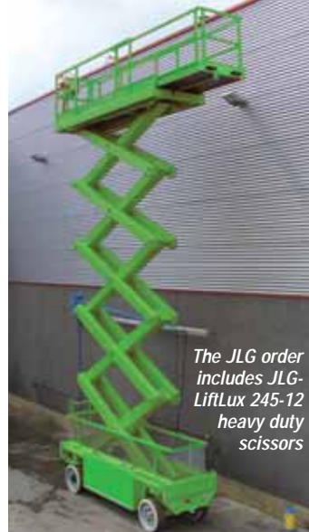
The JLG order includes JLG-LiftLux 245-12 heavy duty scissors

The first of the new models is the XTJ48 which features a platform height of over 46 metres with 14.5m maximum outreach. The telescopic jib offers up to 4.5 metres of horizontal