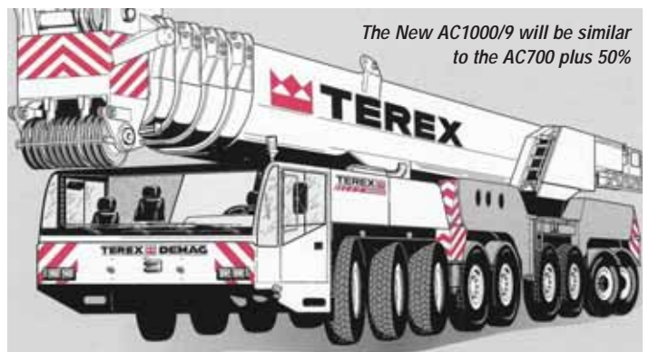
The New AC1000/9 will be similar to the AC700 plus 50%

in situ, something the company currently claims for the AC700. The main boom length will be 50 metres, with a 100 metre boom option for buyers interested in a 'boom off' version, where the boom is removed for transport. The maximum luffing fly jib will be 126 metres. The nine axle unit will offer 12 tonne axle loads with 16.00 x R25 tyres, the 50 metre main boom and front outriggers installed. The outrigger base will range from 10.0 x 10.0 metres up to 13.5 x 13.5 metres.