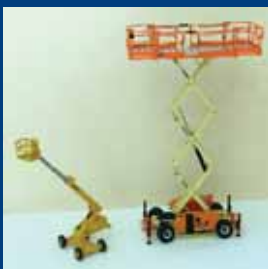
The first JLG scale model - a 60F - is dwarfed by the latest 1:32 scale JLG3394RT scissor lift.