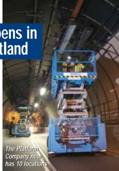
The Platform Company now has 10 locations

The company has also ventured north of the Border for the first time, opening its 10th location in Wishaw, south Glasgow. Slightly larger than the branch in Cosby, it will be the home to more than 200 machines over the next four months. Both depots will also be IPAF approved training centres.