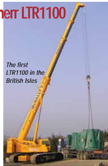
The first LTR1100 in the British Isles