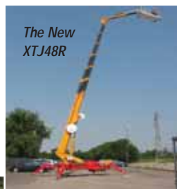
The New XTJ48R

The powered access division is spending a total of £8 million of that and has £1.5 million with Nifty Lift to renew and update its trailer lift fleet and £5.5 million with JLG for booms and scissors. The company says that this year's orders are only the first phase of a three year, £32 million investment to expand and update its powered access rental fleet.