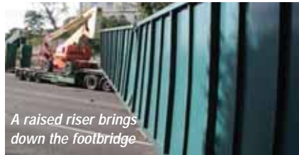
A raised riser brings down the footbridge

in the incident. Plymouth City Council has said the remains of the bridge will be pulled down.