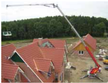
The Paus Skyworker trailer crane will be sold in the UK by GGR-Unic

Paus, the German based crane and access manufacturer has appointed GGR Glass-Unic as the UK distributor for its Skyworker, self erecting aluminium trailer cranes. GGR launched the Paus line at a series of open days celebrating its 10th birthday on September 14th and 15th. The 1.2 tonne capacity Paus Skyworker has been developed for lifting applications in areas where space or load bearing capacity is severely limited. Its 2.1 metre wide chassis has drive assist for easy manoeuvrability and has a fully equipped GVW of under 3,500 kgs.