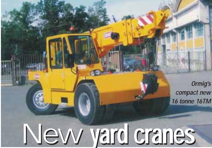
Ormig's compact new 16 tonne 16TM