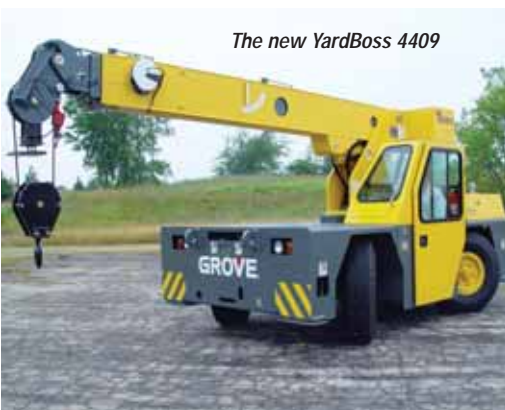
The new YardBoss 4409

Grove has updated and expanded its line of YardBoss industrial cranes. The 20 tonne capacity YB7722 and YB7722XL 'beefed-up' versions of the 18.1 tonne 7720/7720XL models with the same 13.1 metre, three-section and 20.4 metre, five-section booms, plus optional 5.2 metre offsettable jib. The eight tonne YB4409-2 is a new addition to the product line, created by taking the chassis of the 7.7 tonne YB4409 and matching it to the superstructure from the 9.5 tonne YB4411. The three-section 9.5 metre