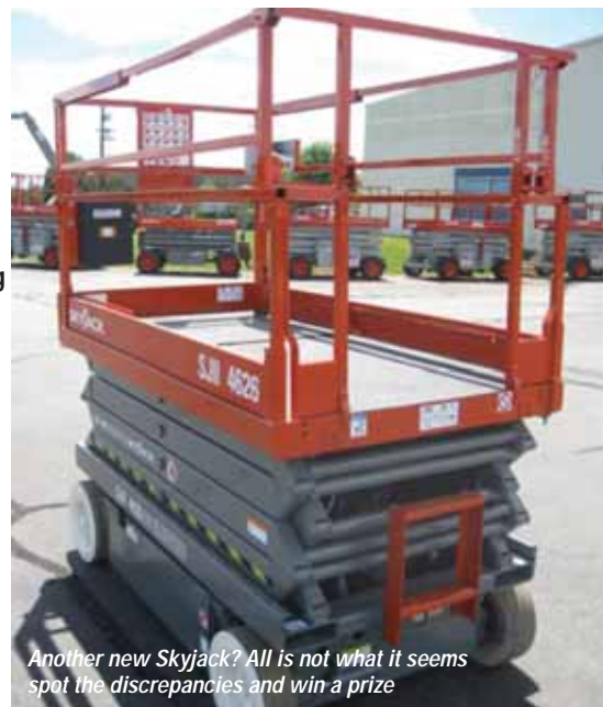
Another new Skyjack? All is not what it seems spot the discrepancies and win a prize

and list any points you think are not quite right and the year of manufacture. The first 100 correct answers will receive a Skyjack cap, while those with the most complete answers will win a more significant prize. If you have an older Skyjack scissor lift you can also join the quest to find the oldest working model and win a new scissor lift by logging on to www.skyjackquest2013.com