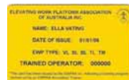
The current EWPA Yellow Card.