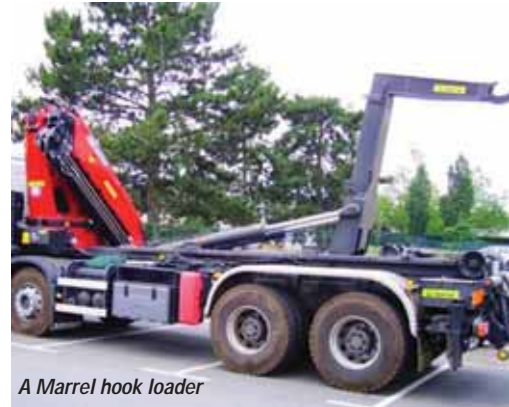
A Marrel hook loader

Marrel - based in Andrézieux-Bouthéon, near Lyon - was founded in 1919 and builds hook lifts, skip loaders and hydraulic cylinders. It exports 55 percent of its production and has revenues of €32 million and 120 employees. Fassi says that it intends to offer Marrel products alongside its articulated cranes.