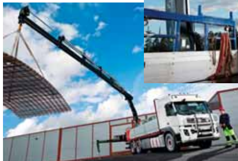
The new Hiab X-CLX 178 loader crane.

The new range replaces the existing XS166 which is widely used by builders' merchants and for other general purpose delivery type duties. The machines have load moments of up to 18.5 tonne/metres and can handle over 4.8 tonnes at a height of 19.5 metres and a radius of six metres.