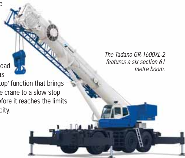
The Tadano GR-1600XL-2 features a six section 61 metre boom.

Tadano's asymmetrical, multi-position outrigger setup, with automatic monitoring and load chart selection as well as a 'soft stop' function that brings the motion of the crane to a slow stop automatically before it reaches the limits of allowed capacity.