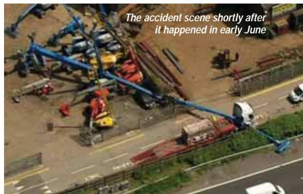
The accident scene shortly after it happened in early June

The statement said that the company is continuing to investigate the circumstances surrounding the accident and is assisting the Health & Safety Executive with its on-going investigation. It also expressed concern over the Genie statement regarding machine calibration. Kimberly said it wished to make it clear that at no time had it ever attempted to calibrate the secondary boom angle range on the 135/70 involved in the accident and Kimberly's service records show that this procedure was only ever carried out by Genie personnel."