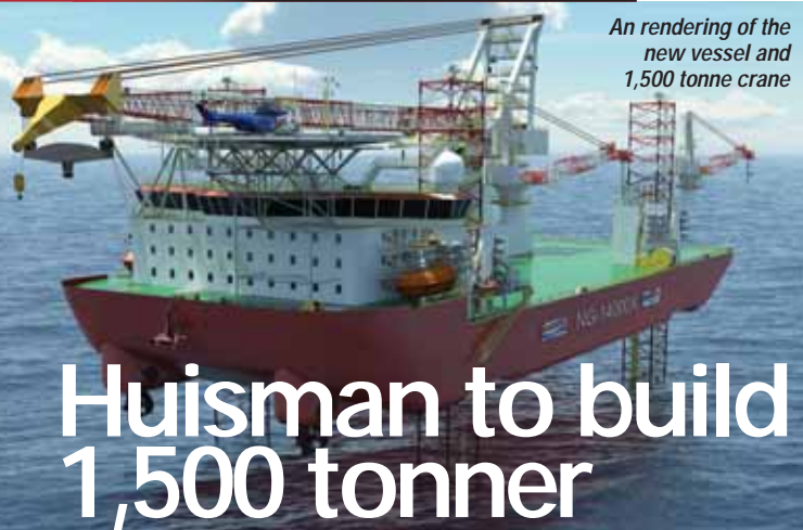
An rendering of the new vessel and 1,500 tonne crane