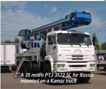
A 35 metre PTJ 3522 SL for Russia mounted on a Kamaz truck

Italian truck mounted lift manufacturer Isoli has sold 20 units of its 20 metre PNT 205 platforms to a contractor working for Algeria's state power company.