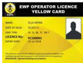
The new card.

The EWPA said that it has been aware for some time some that industry sectors such as mining and resources had not recognised its Yellow Card, as the training programme behind it could not be linked to nationally recognised training. It therefore developed the new training programme and is initiating a retraining programme to bring all former Yellow Card trainers up to date with the new UoC.