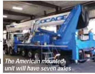
The American mounted unit will have seven axles

Socage's American distributor, Truck Utilities will show a North American version of its 68.5 metre JJ70/JJ230 Forste truck mounted lift at the ICUEE show in Louisville, Kentucky, next month.