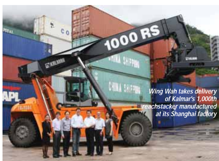
Wing Wah takes delivery of Kalmar's 1,000th reachstacker manufactured at its Shanghai factory

"The board is pleased to report that sufficient progress has been made on the structure and broad terms of an acceptable proposal for the sale of its powered access division, to grant the preferred potential purchaser a short period of exclusivity in which to complete its due diligence with a view to mutually forming a contract that will be executable subject only to shareholder approval."