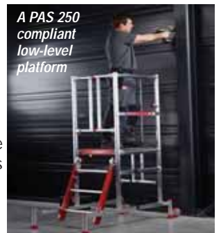
A PAS 250 compliant low-level platform

The standard introduces a specific requirement for stability and resistance to overturning as well as specifications for materials, the design of the guardrails and access and the ability to fit toe-boards.