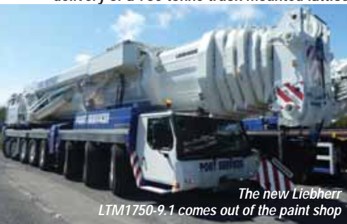
The new Liebherr LTM1750-9.1 comes out of the paint shop

Scottish heavy lift and offshore specialist Port Services is to take delivery of a 750 tonne truck mounted lattice boom Liebherr LG1750 and a 750 tonne LTM1750-9.1 All Terrain. The company says that the new LG1750 is intended to complement its existing Terex TC2800 lattice crane in order to help cope with a number of new contracts it has won in the oil and gas and wind energy sectors.