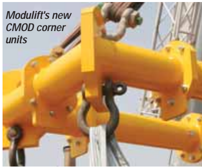
Modulift's new CMOD corner units

Modular spreader beam manufacturer Modulift has developed its first modular CMOD spreader frame with lifting capacities from six to 70 tonnes.