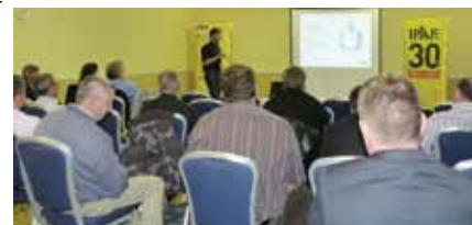
At the West London regional meeting: good topics that were well-presented.

The next regional meeting will be held on 28th November in Bristol. Register in advance at www.ipaf.org/events