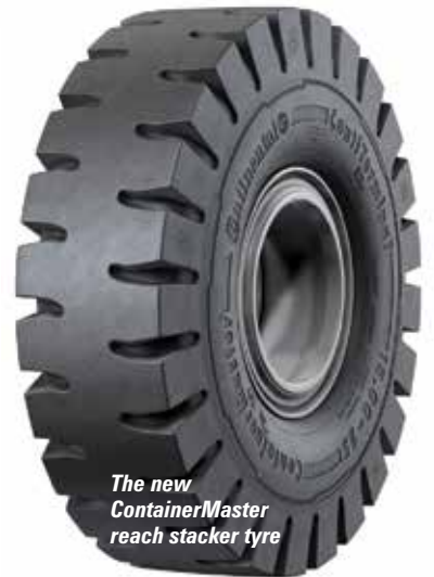
The new ContainerMaster reach stacker tyre

The new tyres include Continental's V-ply technology