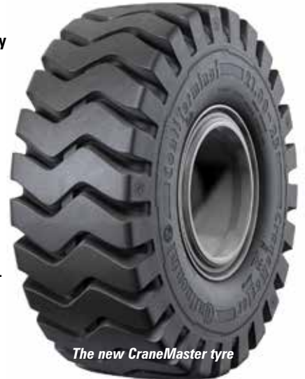
The new CraneMaster tyre