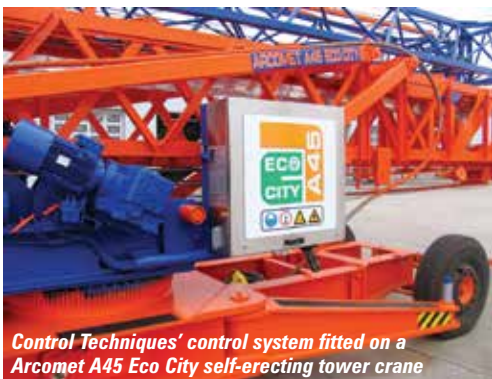
Control Techniques' control system fitted on a Arcomet A45 Eco City self-erecting tower crane

Arcomet said it is looking to develop the drive system by reducing the crane's operational voltage from 400V to 230V and is also looking into the possibility of transferring the system for use on its range of tower cranes.