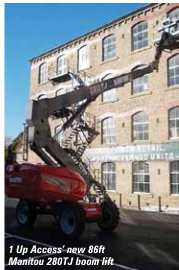
1 Up Access' new 86ft Manitou 280TJ boom lift

The 280TJ's single stage riser, three section telescopic boom and two section telescopic articulated jib offers a working height of 28 metres and 21 metres outreach, combined with a maximum platform capacity of 350kg. Powered by a Kubota engine, the unit includes four wheel drive, four wheel steer and weighs 16.5 tonnes. 1 Up managing director, Ben James, said: "We have recently purchased five booms from Manitou and have been extremely impressed with the product quality. We are in discussions with Manitou to add further booms to the fleet for 2014."