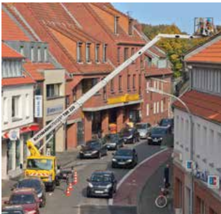
Ruthmann's new 22 metre TBR220

The new 22 metre TBR220 is available on a range of 3.5 tonne chassis. It is equipped with a four section main boom and 2.2 metre articulated jib offering an outreach of up to 16.4 metres. With a platform capacity of 230kg, its interchangeable basket system allows operators to switch between an aluminium or double-insulated 1000 volt synthetic cage.