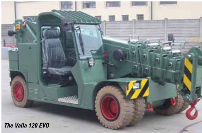
The Valla 120 EVO

Boom truck, crane and port handling group Manitex has agreed the acquisition of Italian industrial pick&carry crane manufacturer Valla.