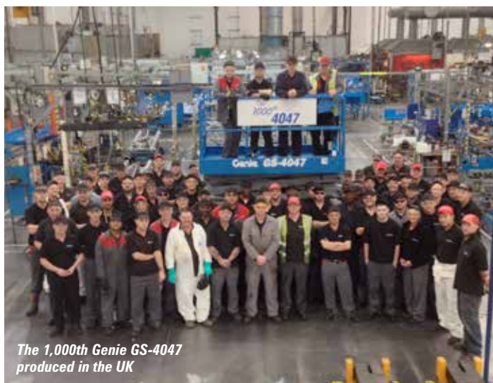
The 1,000th Genie GS-4047 produced in the UK

The crane, first seen at Bauma China in late 2012, spent the summer undergoing heavy-load operating testing on the nine plus three axle chassis at Zoomlion's facility in Quantang. This followed a two month road and type test at the China National Construction Machinery Quality Supervision testing centre in Xibozi, Beijing. The crane then completed a 6,000 tonne/metre overload test on October 24th, before successfully carrying out the 750 tonne load at 10 metres radius overload lift.