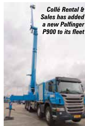
Collé Rental & Sales has added a new Palfinger P900 to its fleet

The P900 has an outreach of 32.3 metres and platform capacity of 530kg (with the option of up to 700 kg). The jib articulates up to a 180 degrees and the platform rotation is a full 180 degrees. The P900 can also reach eight meters below ground level. The platform is mounted on a five axle Scania chassis with a total weight of less than 48 tonnes - outrigger spread is 7.26 x 7.2 metres.