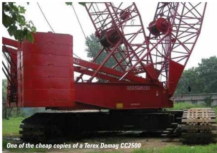
One of the cheap copies of a Terex Demag CC2500