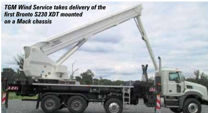
TGM Wind Service takes delivery of the first Bronto S230 XDT mounted on a Mack chassis