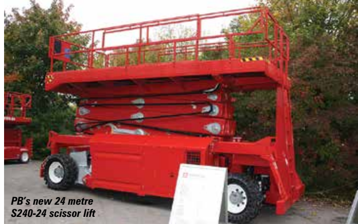
PB's new 24 metre S240-24 scissor lift

Terex stressed the importance of inspecting any used crane before purchasing, including checking serial numbers.