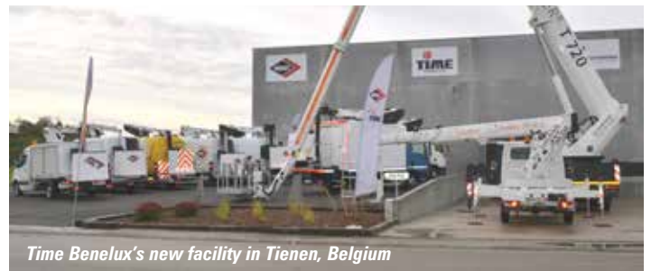
Time Benelux's new facility in Tienen, Belgium