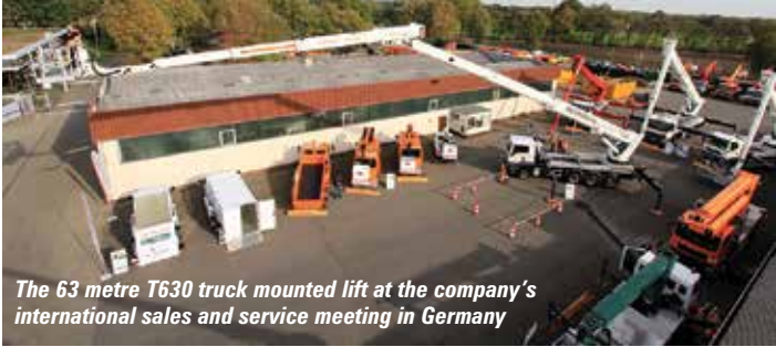
The 63 metre T630 truck mounted lift at the company's international sales and service meeting in Germany