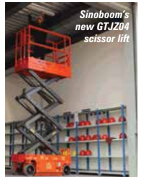
Sinoboom's new GTJZ04 scissor lift

Chinese equipment manufacturer Sinoboom has launched a new 15ft platform height GTJZ04 compact electric slab scissor lift. The new elevator-type model is 760mm wide and 1.77 metres long, has a working height of 6.6 metres and weighs 1,210kg. The platform includes a 900mm roll-out deck extension taking the extended platform length to 2.54 metres, capacity is 280kg.