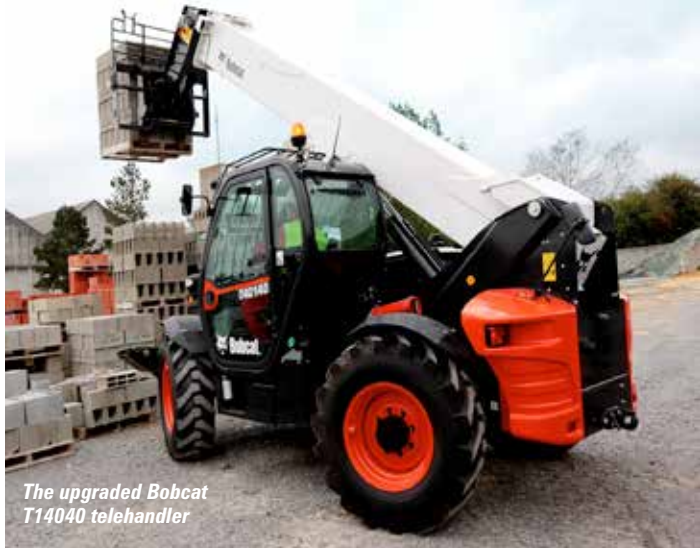
The upgraded Bobcat T14040 telehandler