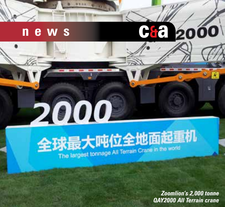
Zoomlion's 2,000 tonne QAY2000 All Terrain crane