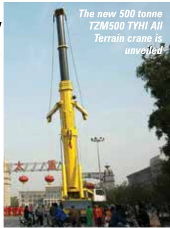
The new 500 tonne TZM500 TYHI All Terrain crane is unveiled

The company - part of the TZ group - is better known for its heavy industrial overhead cranes, although it has a 660 tonne crawler crane on test. It recently built a 6,400 tonne four tower gantry crane for lifting reactor vessels and claims to have begun manufacturing a 1,200 tonne telescopic crawler crane - the TZT1200 - with a wheeled version, the TXM1200 on the way.