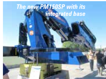
The new PM150SP with its integrated base

The 30.5SP has a load moment of 25 tonne/metres, a maximum hook height of 30.3 metres and an outreach of 26.8 metres. The 34.4 tonne/metre 40.5SP offers a 26 metre tip height and maximum radius of 22.2 metres.