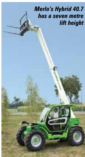
Merlo's Hybrid 40.7 has a seven metre lift height

The machine uses a 76hp diesel combined with a 50kw electric motor in place of the usual 120hp diesel. The unit will work for up to four hours in Eco mode in which a lithium ion battery pack and the electric motor power the drive function, while the diesel engine powers the boom functions and accessories. The battery pack lasts two hours when used as an all-electric machine. Merlo claims that the system can reduce diesel consumption by as much as 30 percent as well as cut noise levels, benefiting both bystanders and the operator. It can also be used as an all diesel machine.