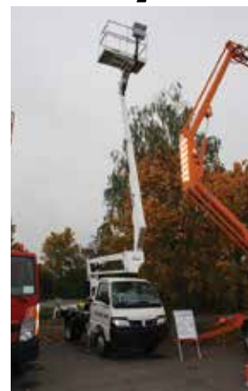
The GSR E140P mounted on a Piaggio compact chassis

A number of new aerial lifts were unveiled at the fourth annual BühnenWies'n access event in Oberbechingen, Bavaria, Germany. PB added to its ECO series range with the introduction of a 24 metre S240-24 scissor lift, while GSR unveiled the 13.6 metre E140P mounted on a Piaggio compact chassis. Offering a 6.1 metre outreach, it features variable outriggers, an optional insulated basket and a gross vehicle weight of 2,200kg. Also on show was Cramer's Niftylift HR28 - the first unit to be delivered.