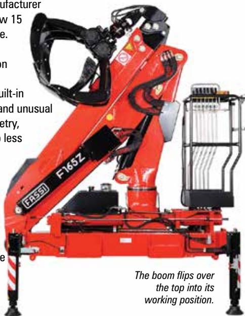
The boom flips over the top into its working position.

Italian loader crane manufacturer Fassi has launched a new 15 tonne/metre loader crane. The F165AZ has been developed with an eye on the French public works market and features a built-in foldable control station and unusual over-centre boom geometry, both intended to take up less space and free up the truck bed from obstructions, especially handy when used for loading/unloading loose material with a clamshell grab. The three section boom has two telescopic sections which use a single cylinder and extension chain, saving space which allows all hoses to be routed internally. Maximum reach is eight metres.