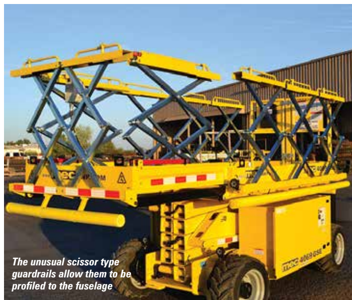
The unusual scissor type guardrails allow them to be profiled to the fuselage