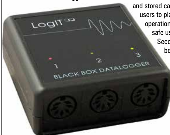
MOM is considering making data loggers mandatory

Secondly, they allow for better monitoring of the performance of the crane operators."