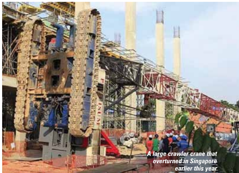
A large crawler crane that overturned in Singapore earlier this year

Spotted in Sharjah, United Arab Emirates, a man pressure washing a façade attempted to gain an extra two metres by climbing onto the guardrails of the boom lift he was using. As a 'safety measure' his work mate held his ankles, and the whole thing was watched by the site manager!