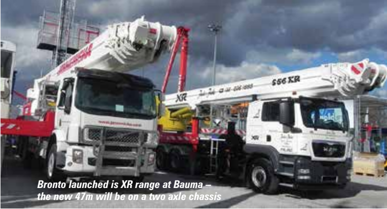
Bronto launched its XR range at Bauma – the new 47m will be on a two axle chassis