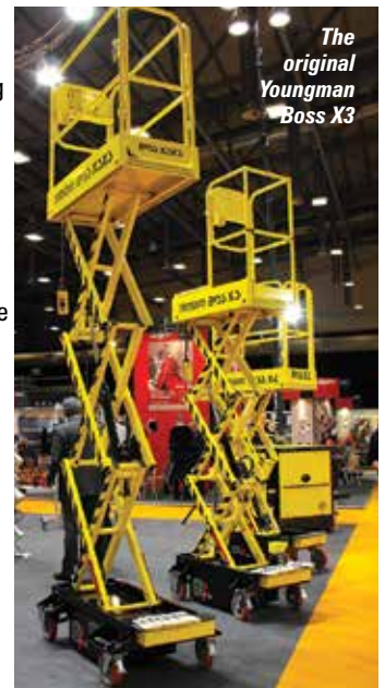
The original Youngman Boss X3

Although Youngman failed to replicate the incident, it has issued a retrofit upgrade kits to all owners of older Boss X series machines, adding the later machine's two way valve. In the meantime it recommends users maintain the batteries in a decent state of charge as a precaution to avoid spikes in the current to the solenoid.