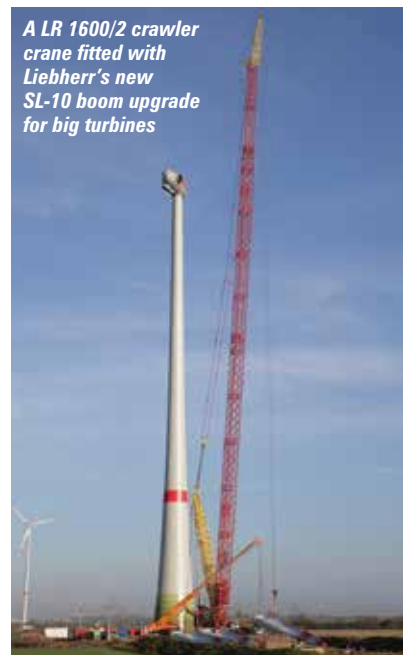
A LR 1600/2 crawler crane fitted with Liebherr's new SL-10 boom upgrade for big turbines

A more direct comparison with the standard boom shows an increase in capacity from 77 to 92 tonnes at a hook height of 147 metres. The boom kit allows the crane to erect the latest generation of wind turbines with tower heights of up to 150 metres. The derrick system has also been improved to allow the longer main boom and jib combinations to be erected.