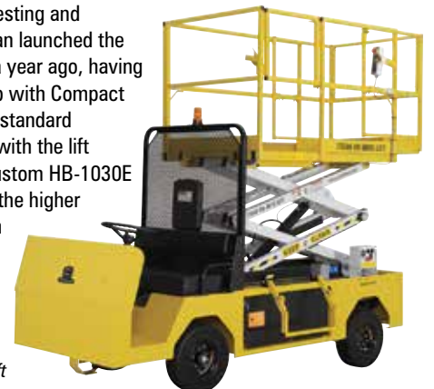
The Cushman Titan scissor lift

Cushman has completed CE approval and certification for its Titan buggy mounted scissor lift which is now available for sale in Europe. The unit was shown at last year's Vertikal Days to gauge market interest before the company started the CE testing and approval process. Cushman launched the unit in the USA just over a year ago, having developed it in partnership with Compact Equipment. It combines a standard Cushman industrial truck with the lift stack and platform of a Custom HB-1030E scissor lift, and thanks to the higher chassis, boasts a platform height of just over 11ft, for a working height of almost 5.5 metres.