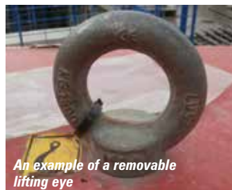
An example of a removable lifting eye

A key element of the note states: "If the lifting eyes are able to be removed from the load, for example by unscrewing, they are classed as lifting accessories and must be thoroughly examined at intervals not exceeding the six months required by Regulation 9(3)(i) of the Lifting Operations and Lifting Equipment Regulations 1998 (LOLER). If the lifting eyes are