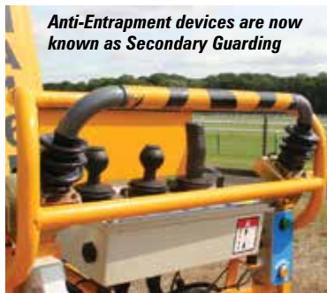
Anti-Entrapment devices are now known as Secondary Guarding

Wraith added: "The term anti-entrapment implies that the use of these devices will prevent entrapment, even though there is no single solution to prevent overhead crushing incidents from occurring. A reduction in serious incidents will only come about by the combined efforts of operators, site management, hire companies and manufacturers and this renaming is a step in this direction."