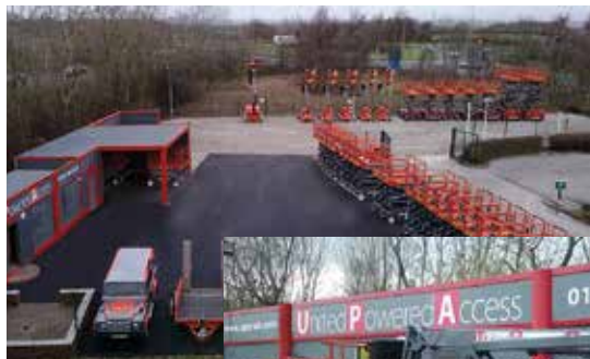
United Powered Access' new premises in Lymm.

Miller settled on two major suppliers to begin with, Skyjack for scissor lifts, especially the company's SJ9250 and 8841 big deck models, and Niftylift for booms - particularly its Hybrid 4x4 units although it has taken a range of machines including the HR12 Bi-Energy, HR12 4x4, HR17 and HR21. The Skyjack models include 6826s and SJ vertical mast models. With more units on order the fleet should exceed 200 units by mid-year.