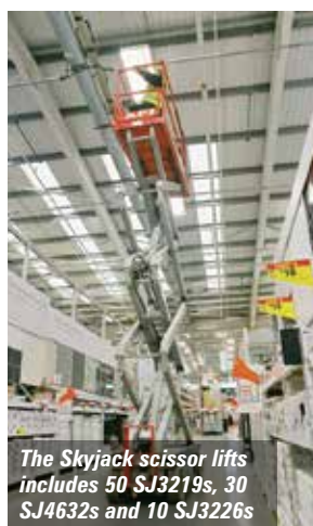
The Skyjack scissor lifts includes 50 SJ3219s, 30 SJ4632s and 10 SJ3226s