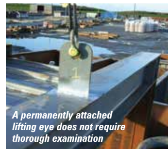
A permanently attached lifting eye does not require thorough examination

The UK's Construction Plant-hire Association (CPA) has issued a draft Technical Information Note on the thorough examination of lifting eyes, which includes whether or not lifting eyes are classed as lifting accessories subject to a thorough investigation. The association is seeking feedback and comment before publishing.