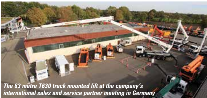
The 63 metre T630 truck mounted lift at the company's international sales and service partner meeting in Germany

At the same time Turkish crane and access company Coskun Vinc has taken delivery of Ruthmann's first 'height performance' truck mounted lift in Turkey - a 54 metre T540. Mounted on a three-axle 26 tonne chassis, it features a four section main boom, 16 metre top boom and maximum outreach of 40 metres. The platform has a 600kg capacity and can be extended to 3.82 metres which, the company claims, is currently the largest work platform on a regular truck mounted lift.