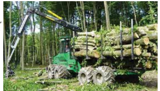
A Cranab forestry loader crane

At the same time Cranab has acquired Bracke Forest AB, a manufacturer of forestry attachments including scarifiers, planting machines, biomass heads, felling heads and equipment for mechanised seeding.