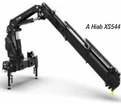
A Hiab XS544

Five medium-capacity XS models will be delivered during 2014 and early 2015, all fitted with the HiPro operating system and Combdrive remote control. Chausson Matériaux currently operates a fleet of 400 Hiab cranes, which will increase to 550 with this order.