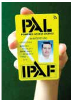
The new IPAF Smart PAL Card which has a wireless icon and a microchip embedded within

Using a Smart PAL Card along with a reader device can be used by site managers to ensure that only correctly trained operators can operate equipment and track who has used which machine for how long to prevent fraudulent use. Standard PAL Cards will continue to be issued and accepted on site.