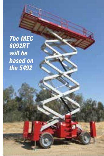
The MEC 6092RT will be based on the 5492

It joins the company's '92' range of 2.34 metre wide scissor lifts and will feature the 7.5 metre Ultra-Deck dual platform extension with platform capacity likely to be between 580 and 600kg for CE models. Total weight is about 9,200kg.