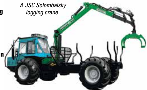
A JSC Solombalsky logging crane