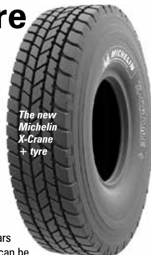
The new Michelin X-Crane + tyre

Michelin claims that the new tyre is safer thanks to an increased surface contact area, a new rubber compound in the tread, which reduces heat build-up in the shoulders and higher resistance steel re-enforcing wires. The company also says that the more rigid tread compound wears more evenly and generates fewer vibrations, and can be re-grooved further extending the tyre's life.