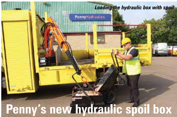
Loading the hydraulic box with spoil