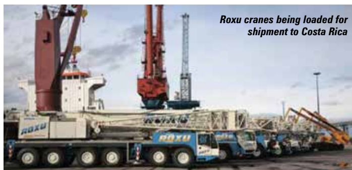
Roxu cranes being loaded for shipment to Costa Rica

Spanish crane rental company Grúas Roxu has opened a new South American subsidiary in Costa Rica and shipped 10 cranes and 10 aerial work platforms from Spain to start the new venture.