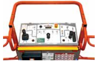
The Skyjack SG-E secondary guarding system

Skyjack has announced two secondary guarding options for its range of boom lifts - the mechanical SG-M structure which features a lightweight protective steel structure that physically protects the operator from being pressed against the controls and the SG-E electronic system which features a sensor bar that, when pushed, instantly stops all machine functions and initiates a siren and high intensity flashing beacon.