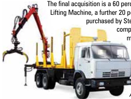
A Velmash loader crane

The final acquisition is a 60 percent stake in PMGroup Lifting Machine, a further 20 percent of the equity will be purchased by Steindl Forsttechnik. The group comprises two Russian crane manufacturers Velmash and Solombalsky Engineering Works, which produce and distribute a broad range of timber and recycling cranes and attachments.