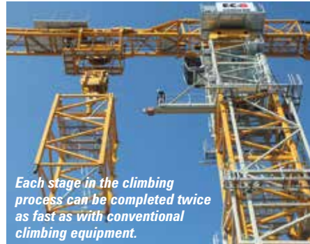
Each stage in the climbing process can be completed twice as fast as with conventional climbing equipment.

As well as the dynamic and static overload tests, which included a 158 tonne lift to test the crane's 125 tonne maximum capacity, Liebherr is testing a new climbing system which at around 45 minutes for each climbing stage takes half the time of conventional climbing equipment. The crane is aimed at wind turbine erection and power station and plant construction.