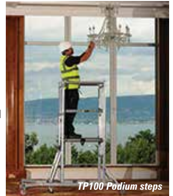
TP100 Podium steps

Aimed initially at general tradesmen, small contractors and DIY enthusiasts in the UK and Ireland, the company will sell standard TT250 towers up to 9.1 metres, TP100 and 150 podium steps and folding low-level work platforms, including T200 Towermatic low level platforms. Most of the products on offer are built at the company's new plant in China and prices are said to be highly competitive. As well as offering free same-day delivery, customers will receive a short training video of each product highlighting key features and set up techniques.