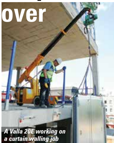
A Valla 20E working on a curtain walling job