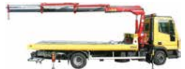
An Isoli tilt back truck bed teamed up with a loader crane

TH White's loader crane division has workshops in Devizes, Wiltshire and Bradford, Yorkshire. The Isoli recovery products will be mounted and installed under licence at the company's Bradford workshops. Isoli truck mounted aerial lifts will continue to be sold and serviced in the UK by APS.