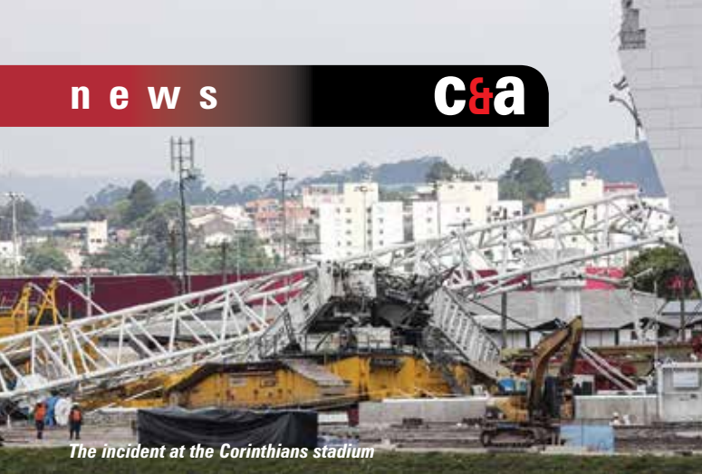
The incident at the Corinthians stadium