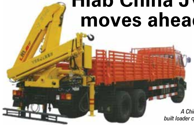
A Chinese built loader crane

Regulatory approvals for Sinotruk (Shandong) Hiab Equipment Company are all cleared and Hiab owner Cargotec is making a €10 million equity investment in the joint venture during year one. CNHTC's dealers and service stations throughout China will be used for the distribution, sales and service of Hiab's cranes and hooklifts. The joint venture will also develop CNHTC's existing loader cranes and production base for the Chinese market.