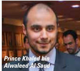
Prince Khaled bin Alwaleed Al Saud

Prince Khaled bin Alwaleed Al Saud, owner of Saudi Arabian investment company KBW Holding, has purchased Italian tower crane manufacturer Raimondi for an undisclosed sum. The company plans to spend around $100 million expanding its Italian production and building new facilities in Brazil, Saudi Arabia and India.