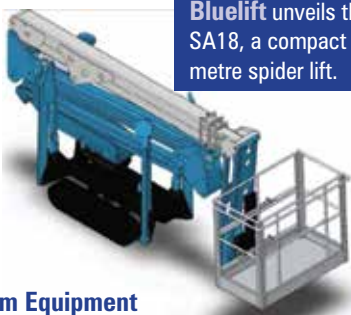
Bluelift unveils the SA18, a compact 18 metre spider lift.

IPAF issues its first full year accident report with 31 fatalities.