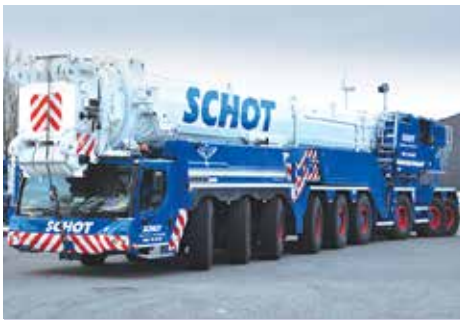
Dutch heavy lifting company Schot takes the first Liebherr LTM 1750-9.1 All Terrain crane.

IPAF issues its first full year accident report with 31 fatalities.