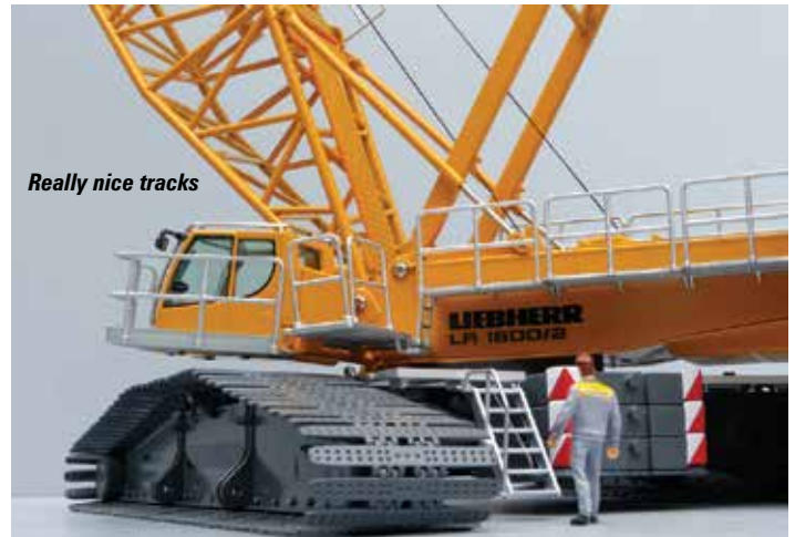
Really nice tracks