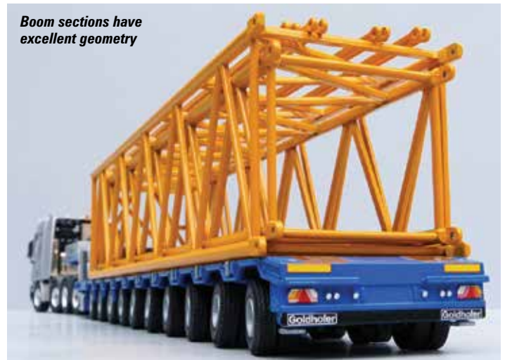
Boom sections have excellent geometry