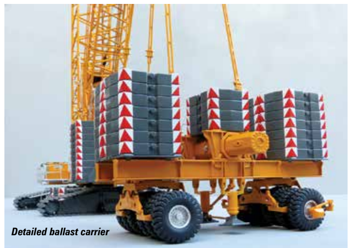
Detailed ballast carrier