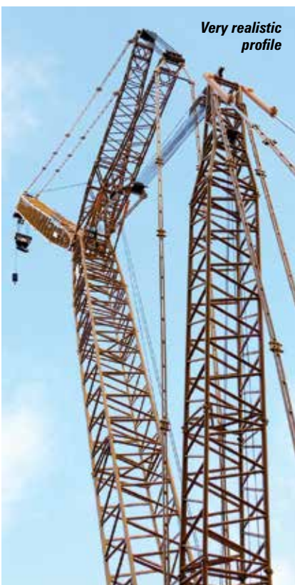
Very realistic profile