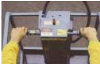
The TL11 was also unusual in that it had a seat...and a mechanical steering system

Demand in the early 90's was so strong that a number of rental companies, including Tokyo Rentals, approached UpRight to design such a lift using the same technology as it used in its small scissor lifts. UpRight had tested this market some years before with a product it called the T11, which offered a 3.3 metre platform height. The TL11 was a flop, most likely due to being too far ahead of its time and too expensive.