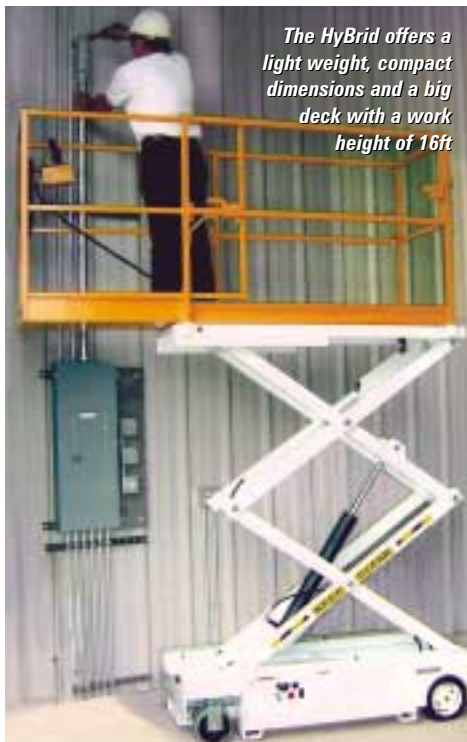
The Hybrid offers a light weight, compact dimensions and a big deck with a work height of 16ft

Slightly higher than the Pop Up, at 10ft/3 metres platform height is the American made Hybrid from Custom lift. The company is looking to launch it on the European market later this year, it uses a standard scissor type structure, and is self propelled. With a gross weight of under 550kgs and a good sized deck with roll out extension is it attractive. However with an overall length of over 1.6 metres it is a little long for some applications.