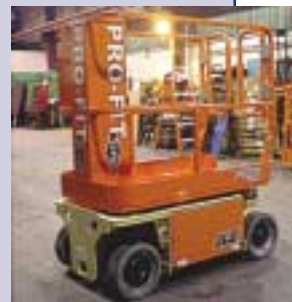
Unofficial pictures of the pre production JLG 1230ES

The lift is at a prototype stage of course and so may well change prior to launch, probably at the ARA in February.