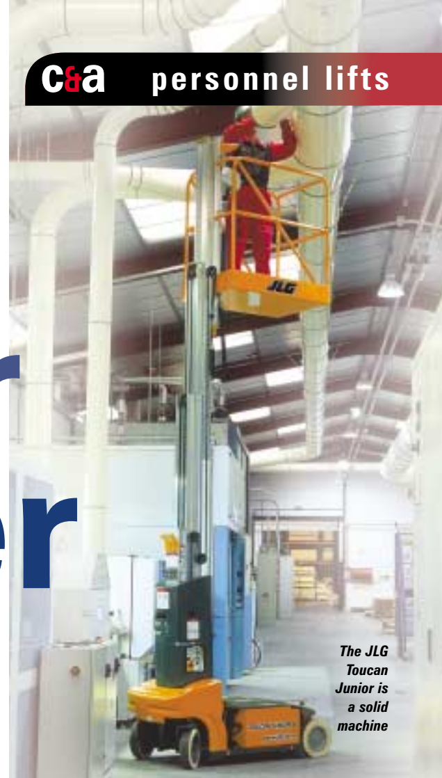
The JLG Toucan Junior is a solid machine

The new Work at Height Rules have encouraged, or in some cases, forced, many ladder and staging users to reconsider the equipment they use to carry out routine work at height. This in turn is spurring on the development and use of a wide range of access equipment with lower heights, lighter weights, simpler construction and lower cost.