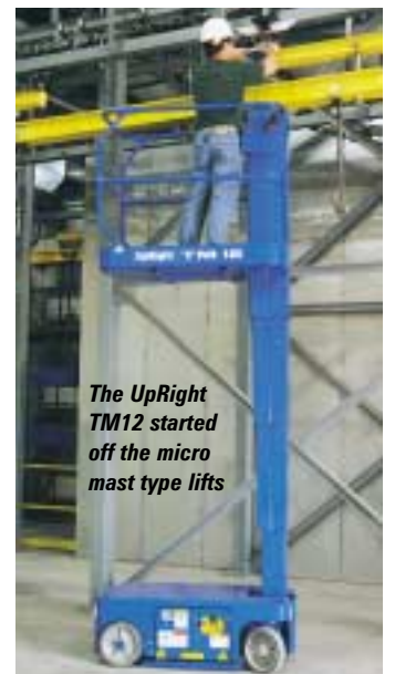
The UpRight TM12 started off the micro mast type lifts

The concept took off in a major way and today Sweden has the greatest penetration of this type of lift anywhere. The concept has spread but it is only recently that such platforms have started to gain a toe hold in the UK and Ireland.