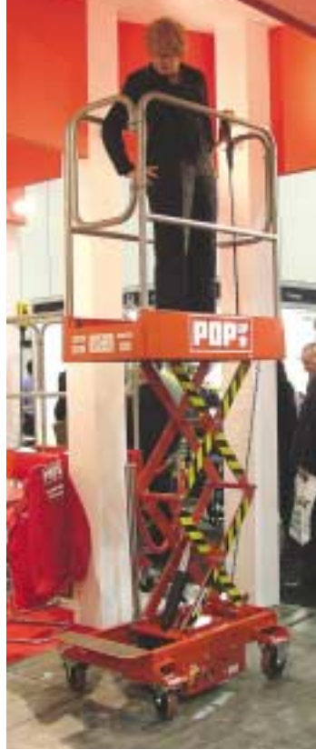
The Pop Up takes powered access into new areas.

The Pop Up is essentially a small ultra compact, two man battery powered push around scissor lift with a platform height of just over 5ft/1.63metres, 1.1 metres length, 700mm width and best of all only weighs 270kgs. With a price for volume buyers as low as £3,500 it offers a real powered alternative to podium steps or staging.