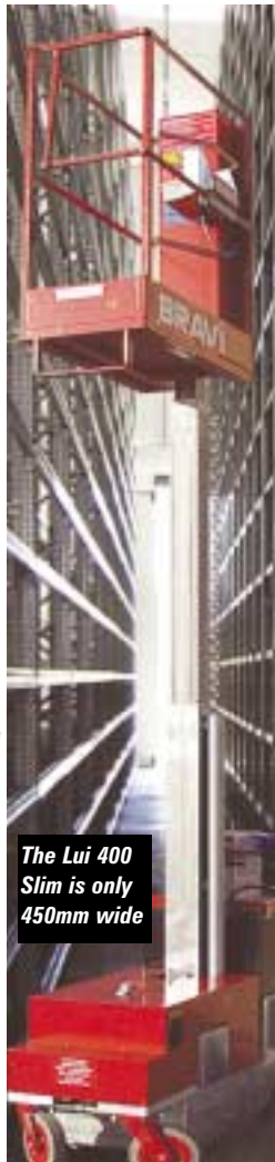
The Lui 400 Slim is only 450mm wide

Another innovative Italian company in this area is Faraone, it builds a 13ft/4 metre platform height machine, the PKS 600, which weighs 643kgs and is 1.47 metres long, more than acceptable for larger elevators although a tad longer than ideal.