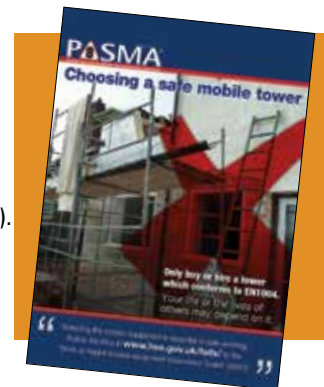
PASMA's leaflet stressing the importance of EN1004 mobile access towers

The principal message of the campaign is that the correct selection of a tower is essential to safe working and that a user's life or the lives of others may depend on it. The campaign is supported by the Hire Association Europe (HAE) and the Royal Society for Prevention of Accidents (RoSPA). Posters and leaflets will also be available promoting the critical safety features of EN1004 towers.