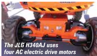
The JLG H340AJ uses four AC electric drive motors

The boom uses four brushless AC electric drive wheel motors, powered by eight, six volt maintenance-free batteries alongside an 8.9hp Kubota Z482 engine - compared to the 24.8hp Kubota on the diesel boom. The engine drives a generator which can power the machine directly and/or be used to re-charge the batteries or the two power sources can combine for maximum power boost. The boom can be used as a pure electric machine for internal use or outside locations where low noise levels are required. It can also be set in hybrid mode for the engine to cut in automatically when battery charge falls below a pre-set level.