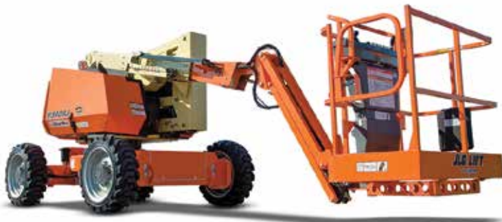
The new JLG H340AJ Hybrid boom lift.

The Hybrid is also available as a two-wheel drive unit and all other specifications are the same as the diesel powered unit, including its 12.3 metre working height, 6.1 metres outreach, overall dimensions, work speeds and steel covers.