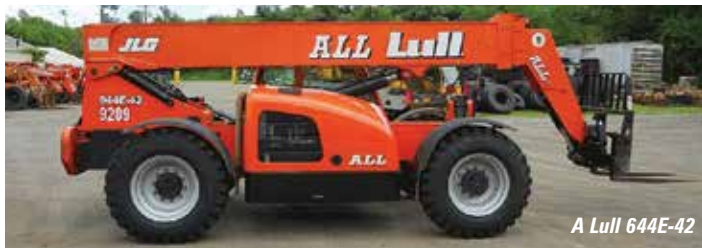
A Lull 644E-42