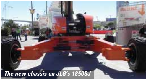
The new chassis on JLG's 1850SJ

Genie unveiled the X-type chassis at the Rental Show in 2005, and updated it last year, switching from the original cast legs/arms to fabricated ones for the SX-180 and ZX135/70.