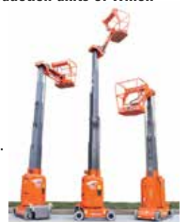
The first production units of Dingli's 11.2 metre mast boom have started to ship

Dingli expects to ship a further 35 AMWP11.5-8100s over the next 30 days to customers in Australia, Finland, France the UK, Netherlands, Russia and New Zealand.