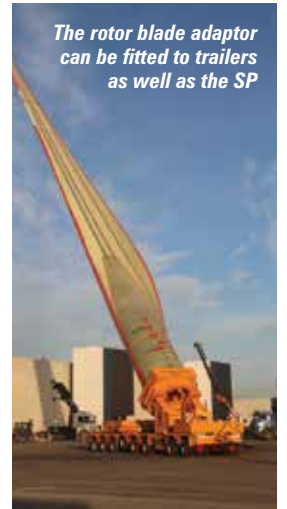
The rotor blade adaptor can be fitted to trailers as well as the SP

The transporter can raise the blade to an angle of up to 70 degrees to negotiate tight bends in wooded areas and rotate it to the position with the least wind resistance. The blade is bolted to a quick release plate that can be used on regular trailers as well as the 126SP, allowing a normal truck and trailer to move the blade over greater distances, while making it easy to shift over to the Inter Combi SP for challenging bends, usually limited to the last few miles of the journey