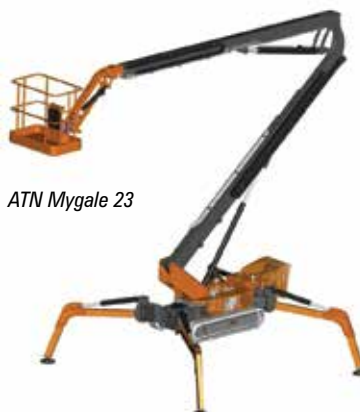
ATN Mygale 23

The second new product the PVR79 Compact Pif uses the same forklift style vertical mast as its mast booms, but with a fixed platform. Although dimensionally similar to 12ft mast models, such as Snorkel's TM12, JLG's 1232ES and Skyjack SJ12/16 it has a 19ft platform height for 7.9 metre working height compared to 6.8 metres on Skyjack's SJ16 and 5.6 metres on the 12ft units.