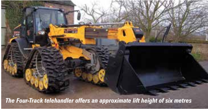
The Four-Track telehandler offers an approximate lift height of six metres

UK specialist tracked vehicle supplier Moorend has developed a 3.2 tonne tracked telehandler. The new Four-Track has a lift height of around six metres and features an articulated, pivot-steer system.