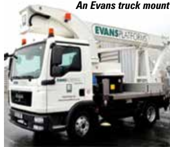
An Evans truck mount

Evans also owns Evans Training and Evans Access Platforms, which has changed its name to 3443 Platforms. Evans Platforms rents out truck mounted lifts and was incorporated in March 2012, with the Training company established in May 2013.