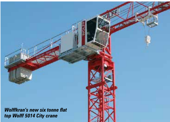
Wolffkran's new six tonne flat top Wolff 5014 City crane