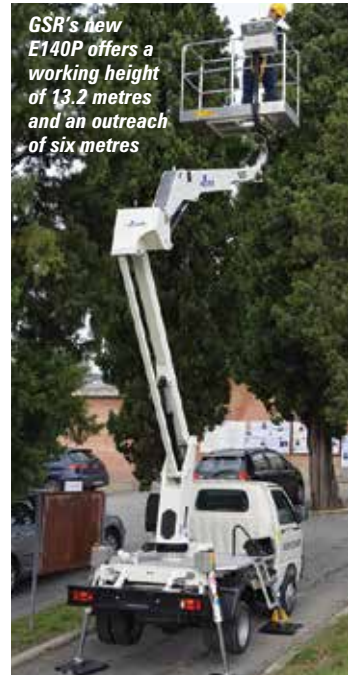
GSR's new E140P offers a working height of 13.2 metres and an outreach of six metres

Features include variable position outriggers, up to six metres of outreach and an unrestricted 250kg platform capacity. It is also available on pick-up chassis from manufacturers such as Land Rover, Toyota, Ford and Isuzu. The company said: "Following months of hard work, research, design and testing the new E140P is now ready. This new model is marked by its simplicity, ease of use and extreme compactness which is ideal for working in confined spaces, particularly in congested urban areas."