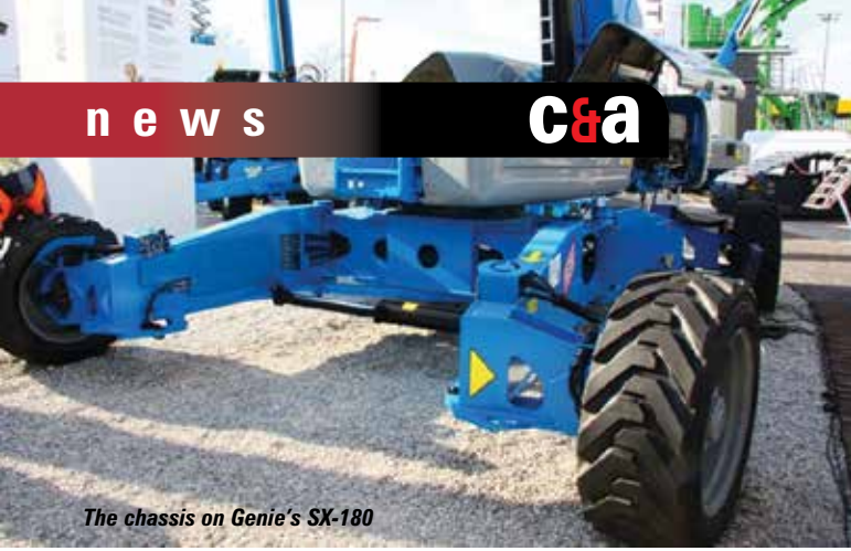
The chassis on Genie's SX-180