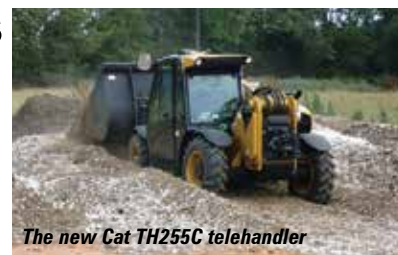
The new Cat TH255C telehandler

metres. The new model is available as a Tier 4-Final/EU Stage IIIB or Tier 3/EU Stage IIIA version for less regulated regions. Overall width is 1.8 metres with an overall height of 1.9 metres. It weighs just under five tonnes.