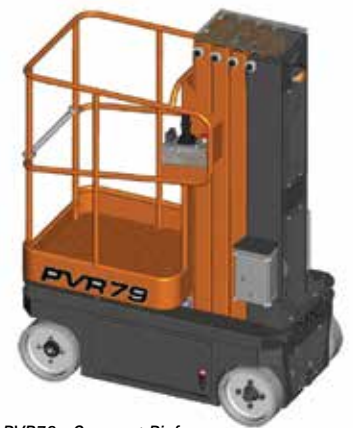
PVR79 - Compact Pif