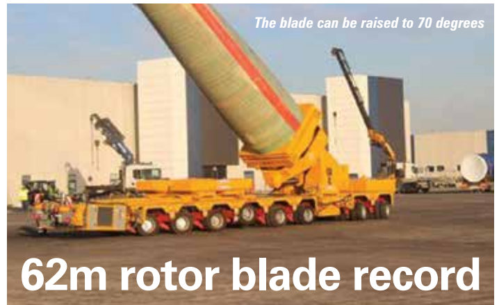
The blade can be raised to 70 degrees