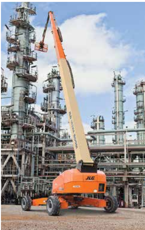
The 185ft JLG 1850SJ Ultra Boom

several surprise launches including two Manitowoc crawler cranes with Variable Position Counterweights (VPC), a 185ft boom lift from JLG, two 160 tonne single engine All Terrains from Terex and Liebherr, a new luffing jib tower crane from Potain, two new telescopic crawler cranes - the 100 tonne Sany and 50 tonne Link-Belt - and Tadano's largest RT crane to date the new 145 tonne three axle GR 1600XL-2 RT. All these and more are covered in our extensive Conexpo review starting on page 35.