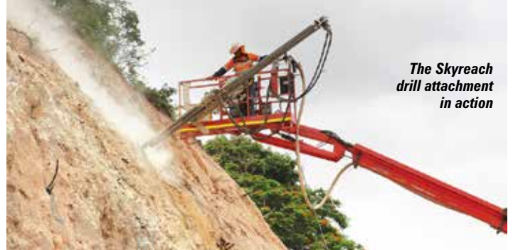
The Skyreach drill attachment in action