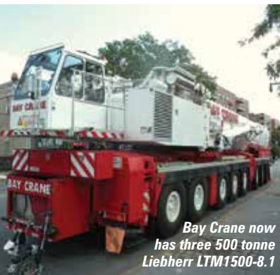
Bay Crane now has three 500 tonne Liebherr LTM1500-8.1