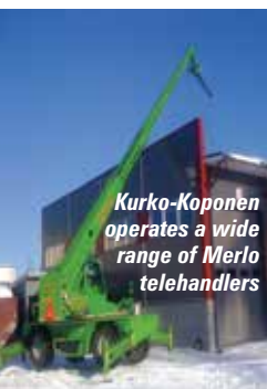
Kurko-Koponen operates a wide range of Merlo telehandlers

cranes have already been delivered with the rest expected to be by the end of the second quarter. The transport fleet has been increased with eight new Kenworth heavy duty tractors and 32 Goldhofer SPMT axle lines.