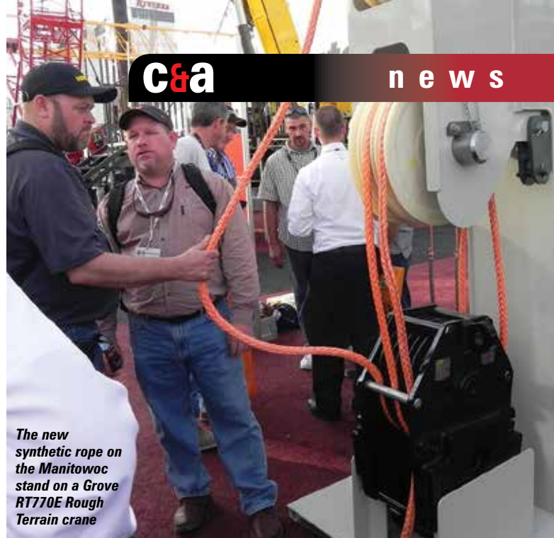
The new synthetic rope on the Manitowoc stand on a Grove RT770E Rough Terrain crane