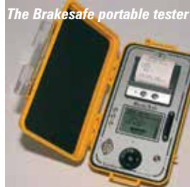
The Brakesafe portable tester

The tester simply drives the vehicle at a constant speed and then applies the brakes in an emergency stop procedure. The device senses then indicates a pass/fail as well as storing the data