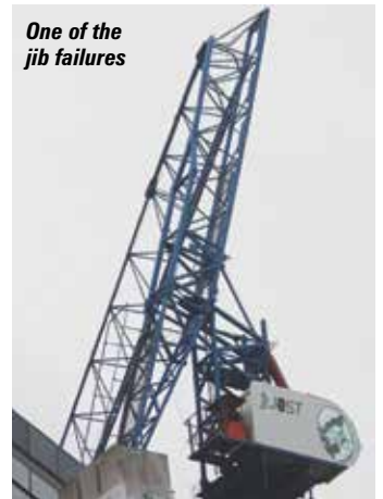
One of the jib failures

We also understand that Jost is now looking into structural modifications and may recommend the use of a sail device to help its cranes weathervane when the jib is left in its fully elevated out of service position.