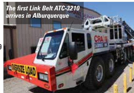
The first Link Belt ATC-3210 arrives in Albuquerque

Albuquerque, New Mexico-based Crane Service has taken delivery of one of Link-Belt's new ATC-3210 185 tonne All Terrain cranes as well as adding its fifth 249 tonne Link Belt ATC-3275 to its fleet. The official hand over occurred on the manufacturer's Conexpo stand.