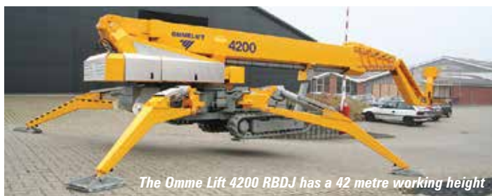
The Omme Lift 4200 RBDJ has a 42 metre working height

Total weight is 6,800kg and the two speed tracked undercarriage can set up on inclines of up to 27 percent. Carsten Poulsen, area sales manager for Omme Lift, said: "This is a lightweight 42 metre boom, with a true battery-diesel hybrid drive train. The battery power provides self-drive and fast lift operation without the inconvenience of connecting to the mains. Moreover, power cuts or local voltage fluctuations do not have an influence on a battery lift performance." First shipments are expected in late summer.