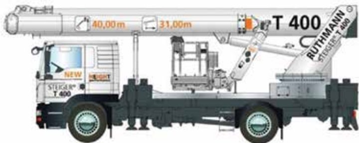
Ruthmann's 40 metre T400 truck mounted lift

German truck mounted lift manufacturer Ruthmann has announced plans for a 40 metre truck mounted lift, the T400. The new unit will be unveiled this summer and fits between the company's 38 metre T380 and 46 metre T460. The lift will be mounted on a two axle chassis and offer an outreach of up to 31 metres. It will also include the same technical features as the other models in Ruthmann's height performance range.