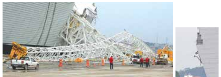
An overview of the scene shortly after the incident occurred.

In conclusion it says it is continuing to do everything in its power to help bring the accident investigation to a speedy and logical conclusion and will continue to cooperate closely with the Brazilian authorities.