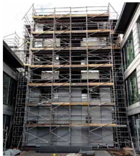
An advanced facade tower structure erected in Aberdeen

Aimed at advanced users of mobile access towers, the course is currently available to all PASMA hire and assembly members. Delegates are shown how to assemble, use and dismantle complex towers in a variety of different configurations. The course reflects the growing use of mobile access towers in a wide range of different, and often demanding, applications.