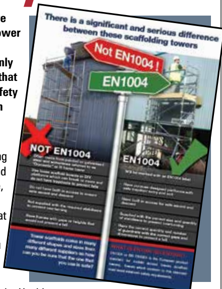
Part of the EN1004 leaflet emphasising the differences between non-compliant and EN1004 compliant towers