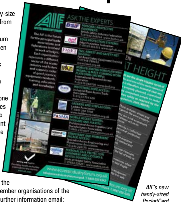
AIF's new handy-sized PocketCard

A new handy-size PocketCard from the Access Industry Forum (AIF) has been designed to inform users 'What to watch when working at height'. On one side it advises users how to avoid, prevent and minimise the risk of a fall, and on the other it provides contact details of all the specialist member organisations of the Forum. For further information email: info@accessindustryforum.org.uk