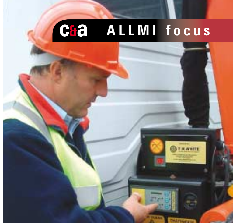
Even trained operators should receive familiarisation training on hand over.

The object of the following guidance is to clarify the obligations and duties of both parties in a hire/lease contract. This guidance deals with the loader crane only and further information should be sought for the vehicle. Before entering into any hire agreement, it is important to read and fully understand the contract details.