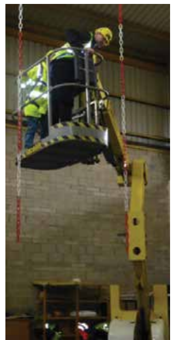
IPAF staff complete the PAL+ course at Facelift's facility in Liverpool

PAL+ is an optional, additional one day category-specific course aimed at operators working in higher risk or challenging environments. More details at: www.ipaf.org/palplus