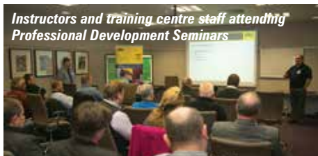
Instructors and training centre staff attending Professional Development Seminars

More than 640 IPAF instructors and training centre staff attended Professional Development Seminars (PDS) across 17 countries in eight languages over the past few months. The annual PDS event ensures that IPAF certified instructors remain up-to-date with legislation and training.