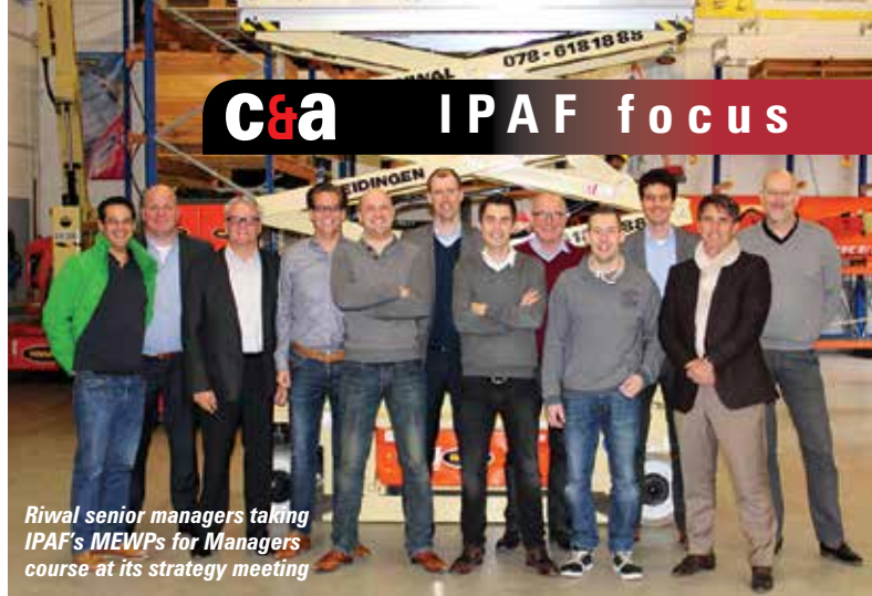
Riwal senior managers taking IPAF's MEWPs for Managers course at its strategy meeting