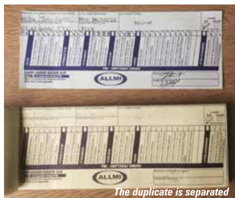
The duplicate is separated