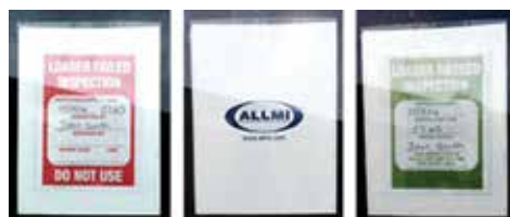
The completed check sheet is slipped into a windscreen mounted display holder