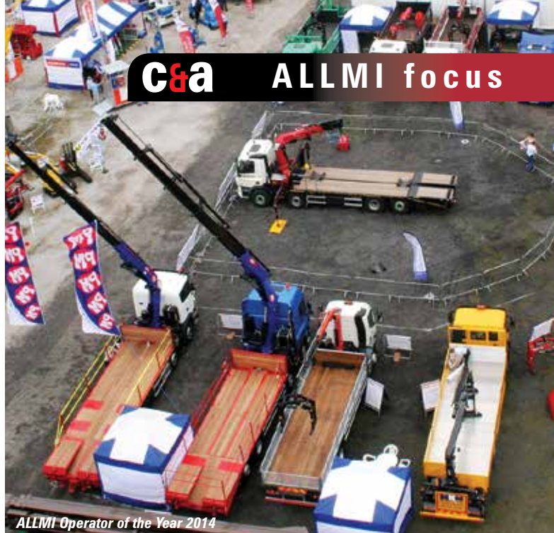
ALLMI Operator of the Year 2014

Pre-registered non-members are welcome to attend. For further information contact ALLMI.