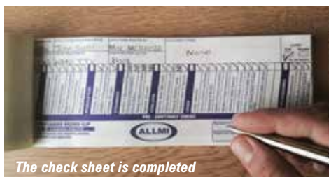
The check sheet is completed