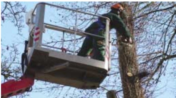
Teupen's rotating platform provides handy outreach when taking a tree down piece by piece.

and implement EU directive 2001/45/EC concerning minimum safety and health requirements for the use of equipment for work at height (the Temporary Work at Height Directive).