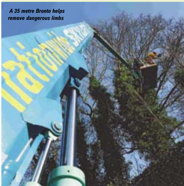
A 35 metre Bronto helps remove dangerous limbs

Nationwide was called in to recommend a suitable lift. It provided a 35 metre Bronto Skylift truck mounted telescopic platform due to its 23.8 metres outreach as much as its height. Its compact dimensions also helped. Tree surgeon Jonathan Strange said: "One very heavy branch had come completely adrift and was stuck in the fork of an adjoining tree. The whole thing was very unstable. Using this machine was the only way we could reach out over the roof of the building and dismantle the trees safely. The Bronto that Skylift provided proved to be the perfect choice."