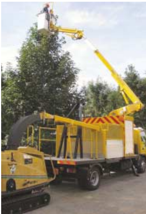
The new Tree platform from Versalift.

inspector of health and safety with the HSE, said: "The unknown quantity for a tree climber is the strength of the branch. Nottinghamshire County Council's solution removes the risks associated with this unknown variable. Other features like the chainsaw bar and chippings box add value to the unit. We haven't seen anything else like it yet for the industry."