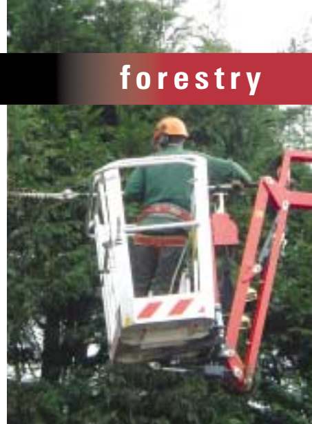
A pole mounted trimmer used to tackle Leylandii at Stratford Hospital.

Suggestions have already been made to manufacturers to design 'tree friendly' machines. This might include features such as a smaller round basket allowing easier movement in the crown of the tree.