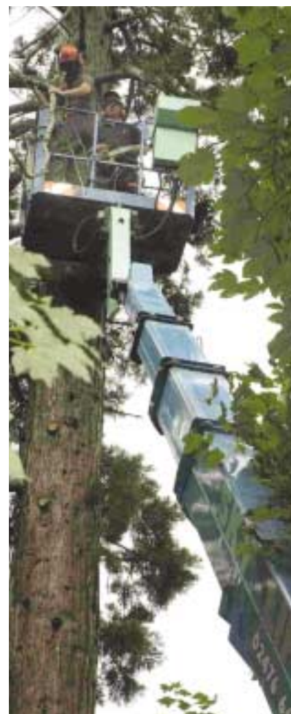
SRF used a 22m truck mount to 'dismantle' the 320 year old tree.

"If the tree's sound we don't need an access platform", says managing director of SRF Sean Ritchie. "But when a tree is rotten like this one, you cannot climb it or put any weight on it" The removal of the tree took less than a day.