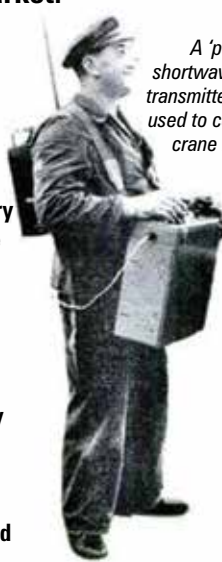
A 'portable' shortwave radio transmitter being used to control a crane in 1959

Remote control manufacturers are able to tailor controls to suit specific applications, ranging from hand-held single function controllers suitable for overhead gantry cranes to large multi-functional controllers which can feature in-built live video