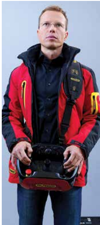
Shoulder straps with large areas of padding ensure operator comfort.

Aimed at the European market its new PALcom P7 range of loader crane controllers has been initially developed for its SH-series of loader cranes, ranging from its PK42002 to its PL200002L. Available with either a small or large control box, with up to nine linear levers and three joysticks the company claims that it is the first controller in the crane sector to feature a 4.1 inch TFT colour display. Information displayed includes the crane's working envelope, outrigger spread, boom height and outreach, working capacity and an icon which shows which, if any, attachments are in use. Other features include its PALdrive menu button for display navigation, easy customisation and a roll-over and acceleration sensor which prevents unintentional