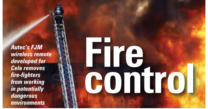
Autec's FJM wireless remote developed for Cela removes fire-fighters from working in potentially dangerous environments