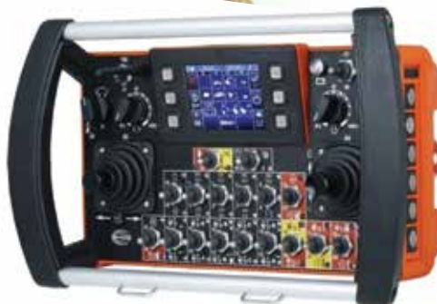
From single to multi-functional remotes and everything in between.