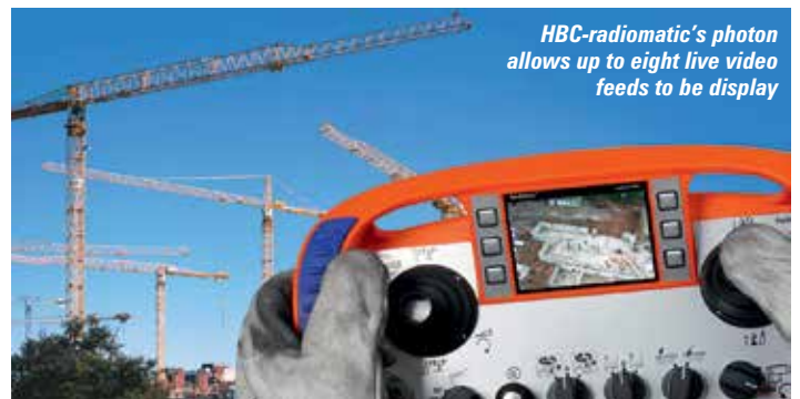
HBC-radiomatic's photon allows up to eight live video feeds to be display

Available in analogue (5.8GHz) and digital (2.4GHz) the company said that the analogue cameras are best suited when controlling machinery while the digital cameras are best