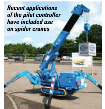
Recent applications of the pilot controller have included use on spider cranes

pre-determined speed limits, user identification and a safety release function whereby if the release button is not pressed no control commands can be activated by the inclination function.