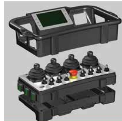
The controller's upper, lower and middle sections are individually selected to cater for all modular demands

Its range of controllers comes with two 7.2V rechargeable battery packs which can individually be removed and charged without disrupting the workflow of the machine. Each battery runs for 30 hours (depending on the configuration) and is available with self-cleaning contacts. The company claims it can be recharged in an hour and that its temperature sensing provides