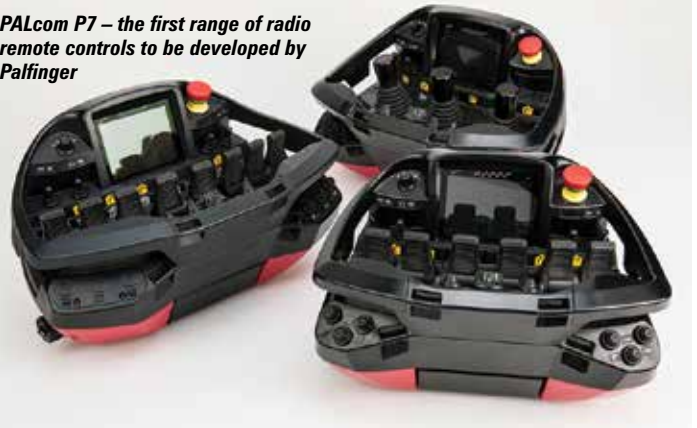
PALcom P7 – the first range of radio remote controls to be developed by Palfinger

movements. In its reduced power consumption mode the company claims the remotes have a battery life of up to 12 hours continuous use. Its charging station detects the battery's condition and temperature before delivering a measured charge.