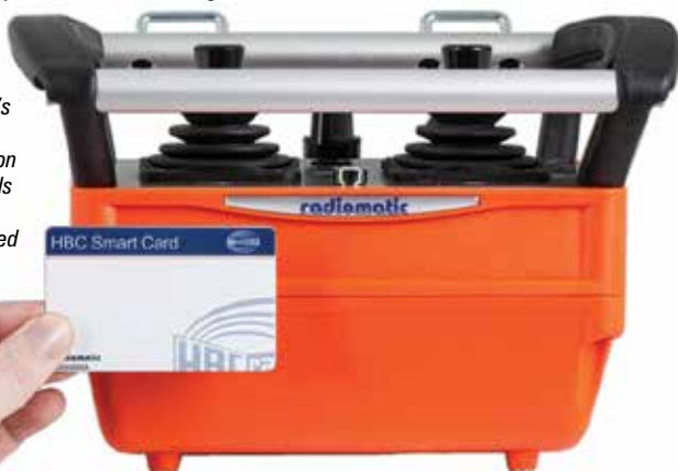
HBC-radiomatic's user identification Smart Cards prevent unauthorised use

For those machines with outriggers the use of a controller can make a more complex set up or cribbing a breeze. There is also a growing trend for the main control panel to also operate as a remote, with the controller attaching/detaching into a bracket within the platform, allowing for the best of both worlds. The use of remote controllers on telehandlers is still quite rare, although there is a growing use for them when used in conjunction with various attachments.