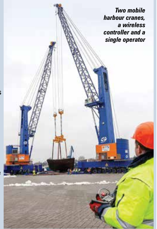
Two mobile harbour cranes, a wireless controller and a single operator

Last year Rendsburg Port Authority successfully completed a tandem lift in German using two Gottwald mobile harbour cranes, a wireless remote controller and a single operator. Using a 100 tonne Model 3 G HMK3405 and a 150 tonne Model 8 G HMK 8610 harbour crane, both installed with Terex's Tandem Lift Assistant software, the operator was able to wirelessly lift a lock gate weighing 236 tonnes. The control was specifically configured to operate both cranes simultaneously, with data being exchanged between the cranes via a secure wireless LAN. Particular consideration was needed to eliminate unequal loadings, lateral pull, overturning and fluctuating speeds.