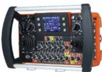
HBC-radiomatic's new high performance Spectrum E

Features include a rechargeable lithium-ion battery - which the company claims offers up to 18 hours continuous use - a redesigned compact housing unit weighing just 3.5kg and a 3.5 inch TFT display