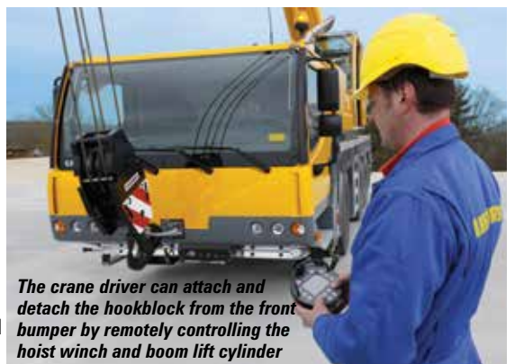
The crane driver can attach and detach the hookblock from the front bumper by remotely controlling the hoist winch and boom lift cylinder

control with electronic inclination display and automatic outrigger levelling. Additional features include a readout of outrigger ground pressures, the ability to mount extensions or counterweights and the display of mileage and working hours when plugged into the carrier cab during road travel.