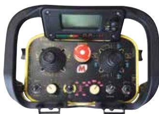
'Magni' placed over 'RTH'; caption: Magni's colour coded controller

The blue section operates the telehandler's transmission and