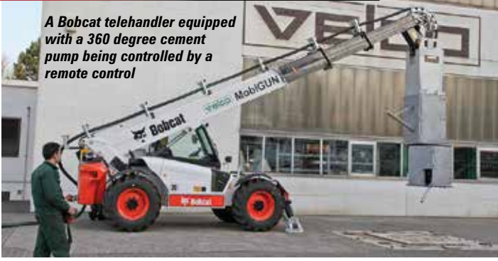
A Bobcat telehandler equipped with a 360 degree cement pump being controlled by a remote control

vibration alarms, all play a part in keeping the operator fully informed and in control. The display screens provide an array of feedback and system information, ranging from simple status and error messages to full graphical displays of lift capacity, boom height and outreach as well as safe working envelopes and other information. Remotes can also be configured to start and stop vehicles, change engine rpm, operate outriggers, control the vehicle's lighting and identify and configure attachments.