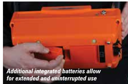
Additional integrated batteries allow for extended and uninterrupted use

Aside from cost, past issues with wireless remote controls have been battery life. However, new battery technology means that some of the more basic controllers can now offer up to 40 hours continuous use, while even the most demanding controllers - in terms of power usage - last between eight and 12 hours before they require charging - ie a full working day. In addition to the improved lithium-ion batteries, the use of more efficient charging docks and additional battery packs have generally overcome this issue. Most remotes on the market are able to monitor battery life and notify operators when a battery is low with the use of LED lights or vibration alarms.