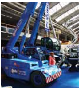
JMG pick&carry cranes on distributor Colle stand.