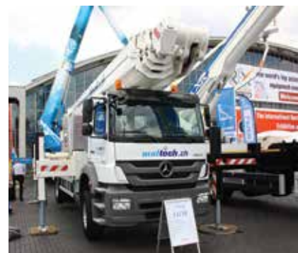
Bronto Skylift launched its 47 metre S 47 XR, the unit on the stand was sold to Swiss rental company Maltech, part of an order for four S 47 XRA's and one S 56 XR.