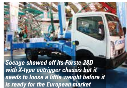
Socage showed off its Forste 28D with X-type outrigger chassis but it needs to lose a little weight before it is ready for the European market