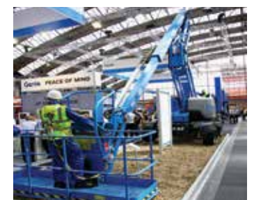
Second new articulated boom from Genie was the 60ft Z-62/40 with 12.42 metres of outreach.