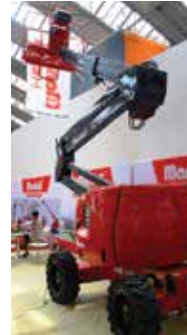
Mantall displayed this 46ft articulated boom - the HZ160RT.