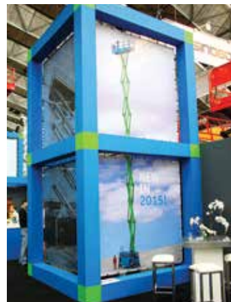
Holland Lift announced a new 34 metre narrow scissor lift to be launched next year and also that it is concentrating on scissors above 16 metres.

Manitou also showed its new Safe Man anti-entrapment system which will shortly be available for all models. Holland Lift unveiled its first true hybrid scissor lift and announced a new 34 metre ultra narrow model for next year.