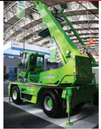
Merlo has plenty of news for ag users of its telehandlers but construction users must wait a bit longer for improvements to the cab and modularisation or major components such as boom, frame, cab and engine.