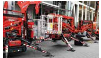
The Hinowa stand.