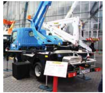
The Palfinger Smart range on a 3.5 tonne chassis now includes this 23.2 metre working height P240A, the P200A, P170T and the P140T.