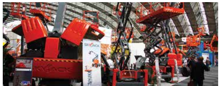
Skyjack's impressive stand included a new motor controller for its DC scissor platforms. Already featured on its vertical mast lifts it gives better control, longer, quieter operation and better efficiency.