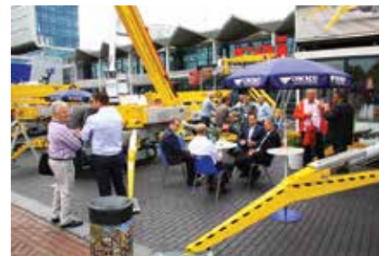
Visitors enjoying the sunshine on the Omme stand.