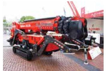
The 33 metre Platform Basket 33.10 shown as a prototype at Bauma last year.