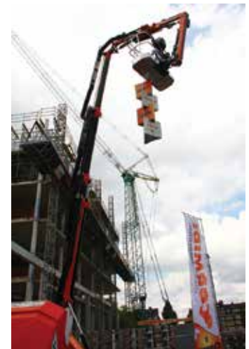
Cormidi KB23 showing off its access jib attachment. The crawler crane in the background was not part of the show and just happened to be working on an adjacent site.