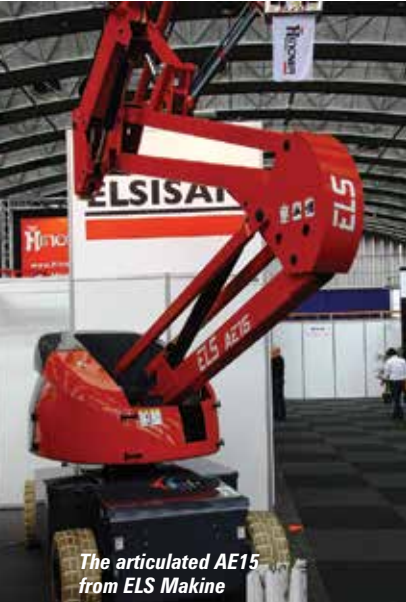
The articulated AE15 from ELS Makine