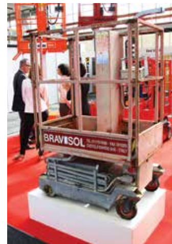
Bravi was keen to promote the longevity of its products - this is nearly 20 years old and still working.