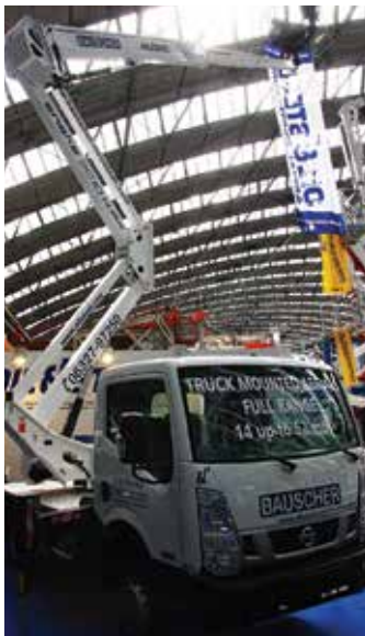
Oil&Steel launched the new 20 metre Snake 2010 H Plus which now has the option of vertical or A frame outriggers. Maximum basket capacity is 250kg and the first has been sold to German rental company Bauscher.