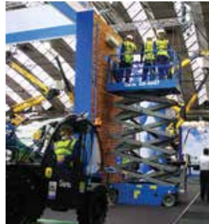
Part of the Genie stand with the GS 4047 scissor and compact telehandler.