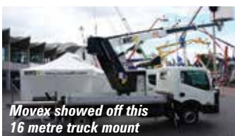
Movex showed off this 16 metre truck mount