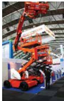
Sinoboom sold all the stand machines to Cimertex its dealer in Portugal.