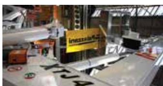
Palazzani XTJ43 replaces the 42 metre spider lift and features a new levelling system.