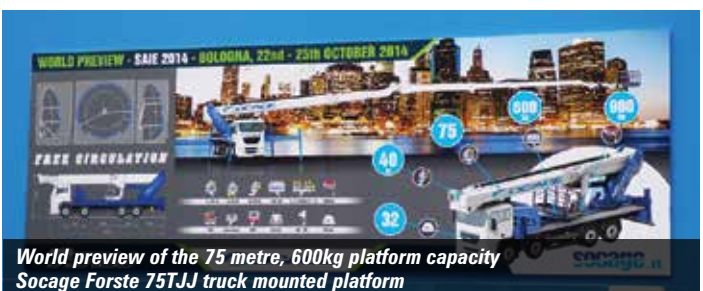
World preview of the 75 metre, 600kg platform capacity Socage Forste 75TJJ truck mounted platform