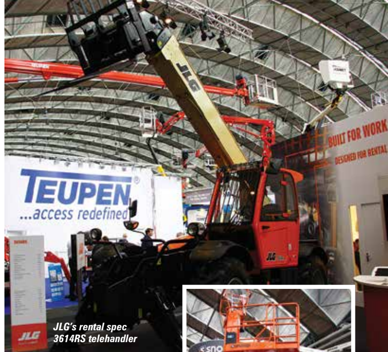
JLG's rental spec 3614RS telehandler

For many visitors it was also the first chance to see Skyjack's 32ft SJ 6832 RTE, the compact electric RT scissor launched at Conexpo, but it also announced that it is installing motor controllers in all its export - slab electric scissor lifts. Airo had a