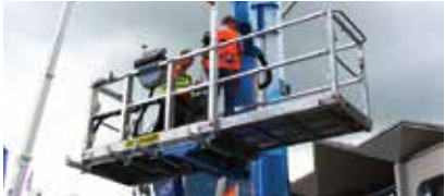
Palfinger launched the 48 metre, 31.5 metre outreach P480 on a two axle chassis, along with the 30 metre P300 and 23 metre P230.