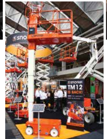
The TM12 name is back at Snorkel, along with a new deck extension.

bright stand with several interesting smaller scissor, mast boom and low level products. In fact the low level access sector was positively busy with Snorkel announcing the return of the TM12 name and launching the new S3010E. Faraone had a full range of push and self-propelled units including the Elevah 4.0 which weighs 75kg, while Chinese manufacturer Sivge displayed a twin mast boom platform and Dingli showed its new mast boom.