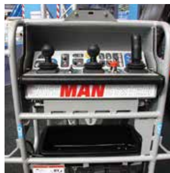
Manitou's new Safe Man secondary guarding system uses a pressure sensitive bar at the front of the control panel.

Coming on the tail of Conexpo and Vertikal Days, the number of world product launches were few and far between, but there were a few. Major highlights included Genie with two new articulating booms the Z-62/40 and the Z-33/18, while Manitou finally showed its 260TJ - announced at Apex three years ago - with its telescopic jibbed brother, the 280 TJ.