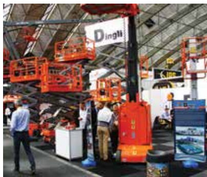
Dingli had a full stand including scissors, push around lifts and its new mast booms.