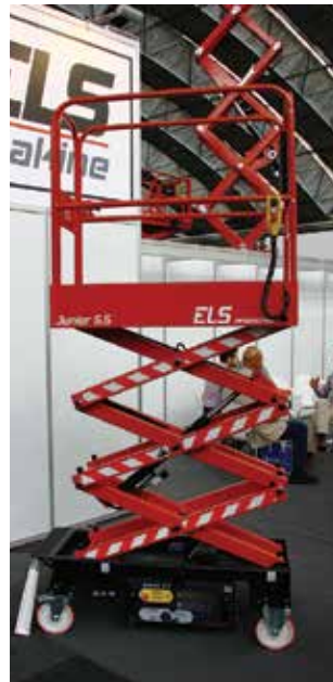
ELS Makine's smallest push around the Junior 5.5.