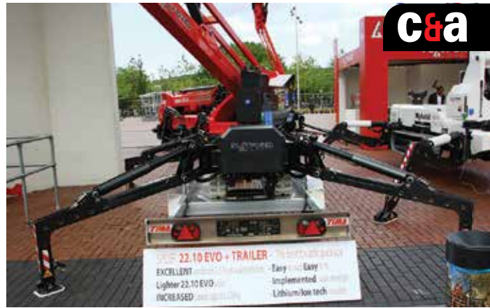
Platform Basket's 22.10 Evo and trailer for easy transportation.