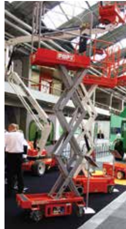
The Pop-Up Push 10 Pro and Snorkel 3010E.