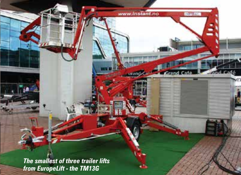
The smallest of three trailer lifts from EuropeLift - the TM13G

There was a lot of interest in spider lifts with new models from Palazzani with its new Ragno XTJ 43 (replacing the XTJ 42), Easy Lifts 36 metre lithium battery powered Easy 360 Hybrid and the 33 metre, 19 metre outreach Falcon FS330Z from TCA Lift. Ommé showed its new 42 metre 4200 RBDJ - its largest to date - while CMC was out in force with several spiders and news of a large sale of its new 15 metre machine to the UK's largest spider rental company Higher Access. Platform Basket had its new 33 metre platform shown as a prototype at the last Bauma and now with a hybrid power pack. Trailer lifts were well represented with three new models from EuropeLift and Dinolift's latest 180XT II. Denka's new owner Rothlehner displayed an 18 metre DL18 and there was an unusual articulated trailer lift from X Trux. Snorkel even sold its trailer