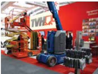
TVH is the world's leading replacement parts supplier.