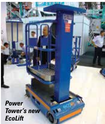
Power Tower's new EcoLift