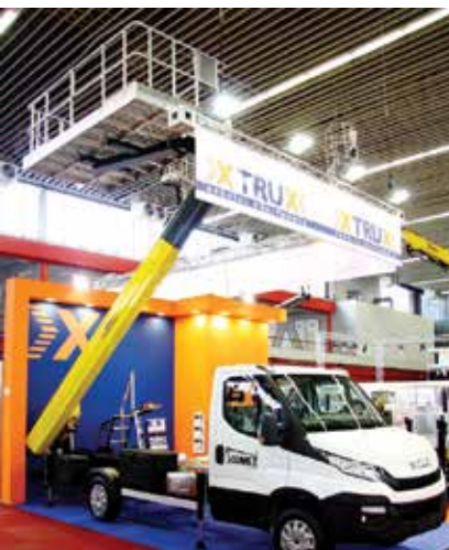
XTRUX also showed this unusual Solar 16 metre truck mount with 400kg capacity and 4.5 metre outreach.