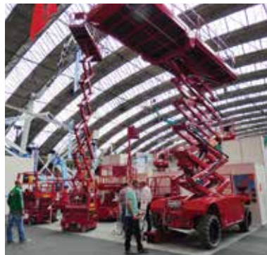
PB Liftechnik scissor lifts.