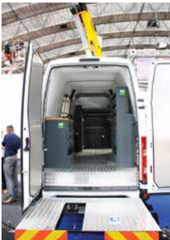
Co.me.t also showed the 14 metre with jib pillarless van mount.