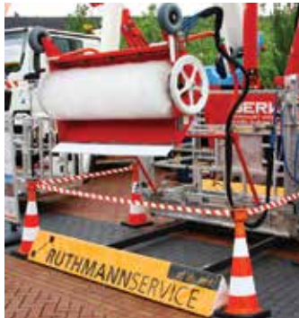
Hy-Lift showed this access platform cleaning attachment on the Ruthmann stand.