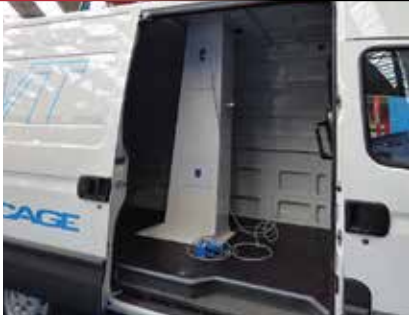
Sogace Forste 12VT van mount.