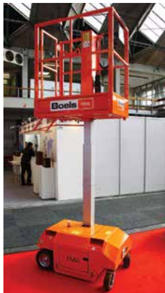
Dutch rental company Boels ordered 100 Bravi Leonardo HD self-propelled lifts.

Coming on the tail of Conexpo and Vertikal Days, the number of world product launches were few and far between, but there were a few. Major highlights included Genie with two new articulating booms the Z-62/40 and the Z-33/18, while Manitou finally showed its 260TJ - announced at Apex three years ago - with its telescopic jibbed brother, the 280 TJ.