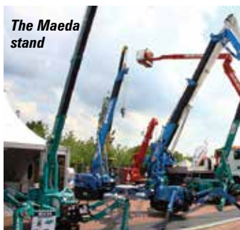
The Maeda stand