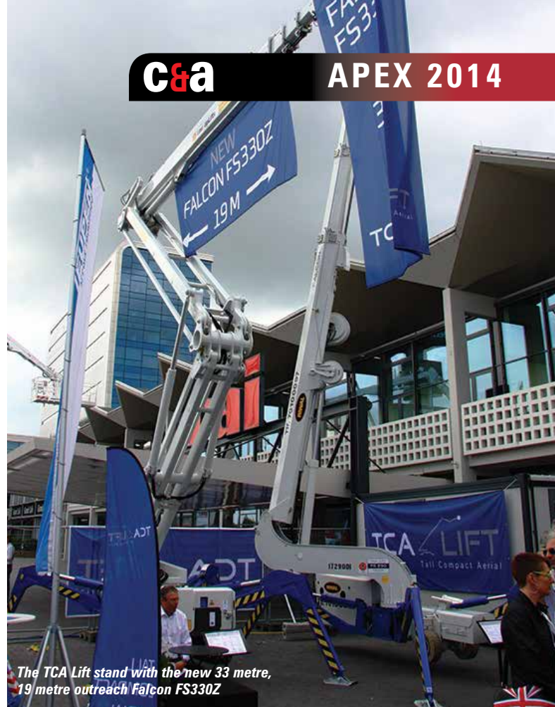
The TCA Lift stand with the new 33 metre, 19 metre outreach Falcon FS330Z

The following photos cover the major highlights as well as a wide range of other machines that were at the show.