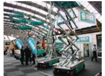
The Imer group stand included scissors, push around and spider lifts.