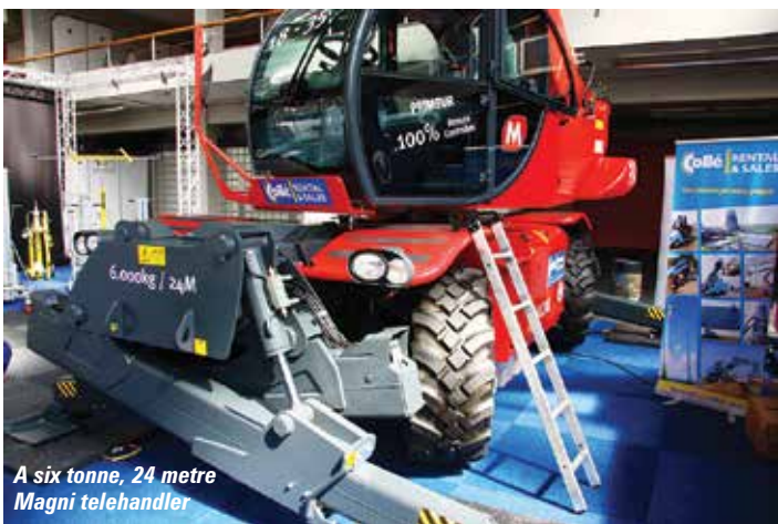
A six tonne, 24 metre Magni telehandler