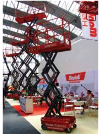
Mantall has several new scissors from seven metres to a 16 metre 1.2 metre wide unit. It is also working on a new range of much lighter straight booms up to 27 metres.