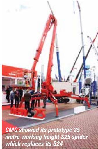
CMC showed its prototype 25 metre working height S25 spider which replaces its S24