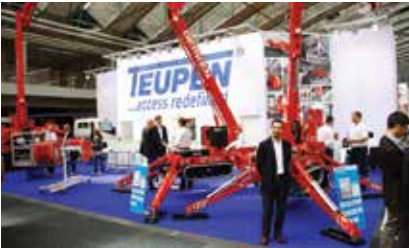
Teupen showed off its latest range of tracked spiders.