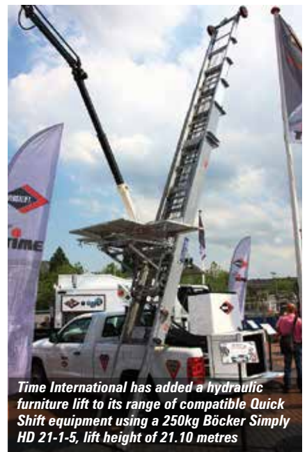
Time International has added a hydraulic furniture lift to its range of compatible Quick Shift equipment using a 250kg Böcker Simply HD 21-1-5, lift height of 21.10 metres