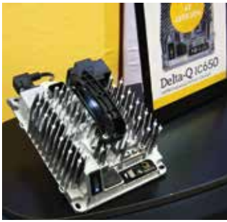
Delta-Q's new IC-650 battery charger.