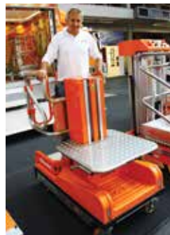
Piero Faraone showing off the Faraone Elevah 51 stock picker platform.