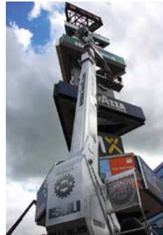
Isoli's range topping 36 metre PTJJ36 launched at Bauma last year.