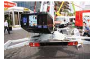
Dinolift had its updated version of its 180XT II with spider type outriggers for better levelling and outreach.