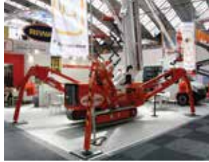
Easy Lift showed its new 36 metre R360 lithium hybrid tracked spider alongside a lighter weight EV150 van mount. Look out for a 41 metre spider at the end of the year.