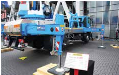
The new 48 metre, 31.5 metre outreach, two axle Palfinger P480.