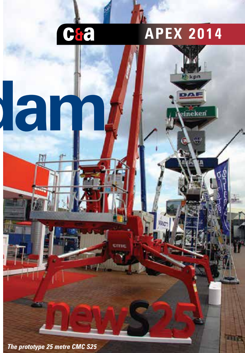
The prototype 25 metre CMC S25

Accurate visitor numbers are always difficult to obtain particularly just after the show but much was made of 'quality not quantity'. Certainly visitors were in a buoyant mood and a good many orders were placed, including 100 Bravi Leonardos by Boels and six JLG 1850SJ by Riwal, all adding to a good 'buzz' around the showground.