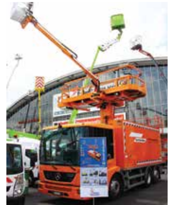
France Elevateur showed its 105 PTO-2 - one of seven sold to Kummler + Matter for working on the Swiss tram system. The unit has a five person capacity with two booms either side of the main platform.

INCLINOMETERS, CONTACTLESS ANGLE SENSORS, TILT SWITCHES, CABLE TRANSDUCERS AND CUSTOM SENSING DESIGNED SOLUTIONS