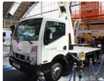
GSR was showing its latest truck mount - the 22.5 metre B230T on a Nissan Cabstar chassis.