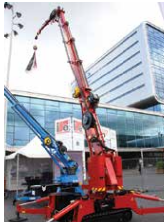
Several mini crane manufacturers were also at the show including Hoeflon.