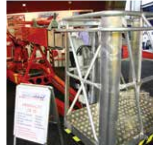
Denka Lift - now owned by Rothlehner - showed this 18 metre Denka DL18.