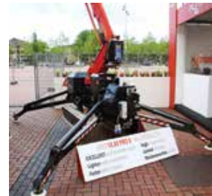
Platform Basket showed its lithium powered 18.90 PRO E spider.