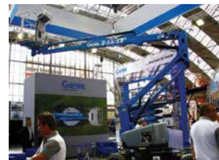
One of the stars of the show - Genie's new Z-33/18 articulated boom.

Manitou also showed its new Safe Man anti-entrapment system which will shortly be available for all models. Holland Lift unveiled its first true hybrid scissor lift and announced a new 34 metre ultra narrow model for next year.