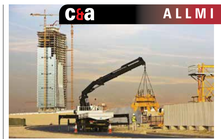
Over 60 percent of lorry loaders sold now include remote controls.

For information on membership, please contact ALLMI.