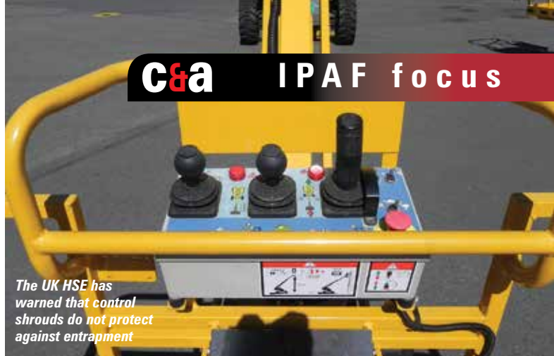
The UK HSE has warned that control shrouds do not protect against entrapment

More details on the venue and registration are at www.europlatform.info