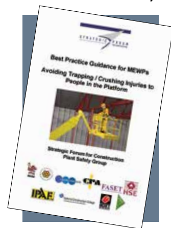
The Strategic Forum's Best Practice Guidance for MEWPs: Avoiding Trapping/ Crushing Injuries to People in the Platform.

accidents in aerial work platforms for the specific tasks they are to undertake (see reference 1 above).