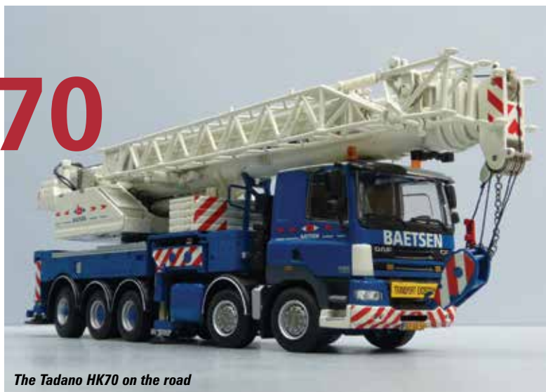
The Tadano HK70 on the road