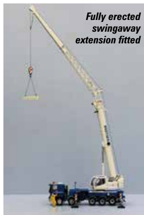
Fully erected swingaway extension fitted