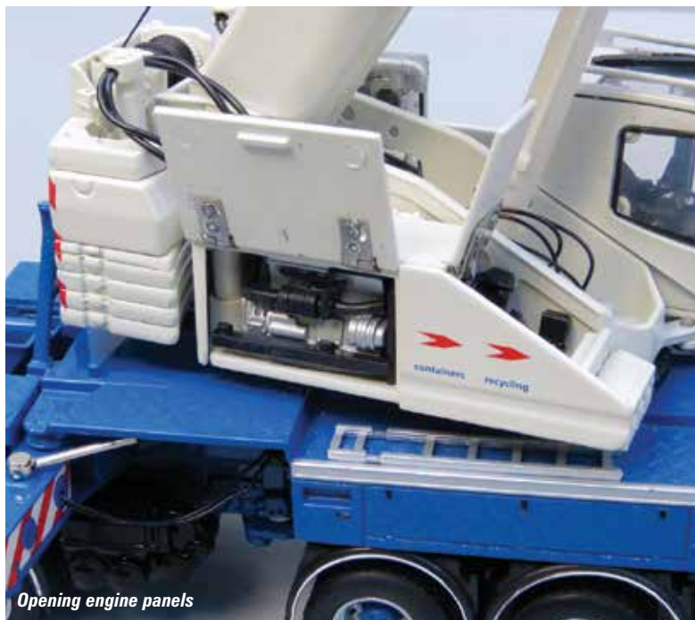
Opening engine panels