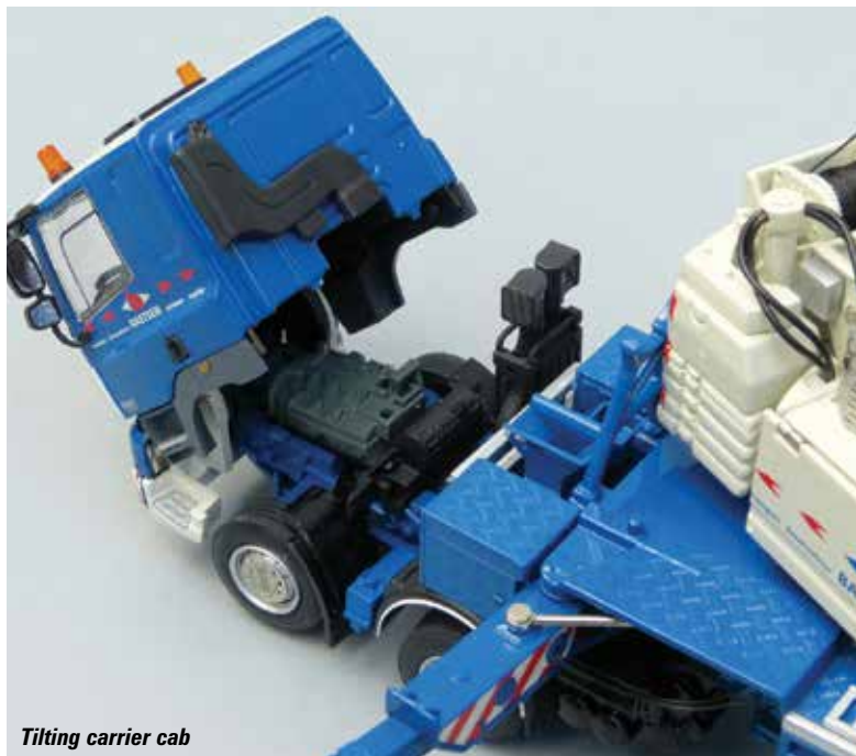
Tilting carrier cab