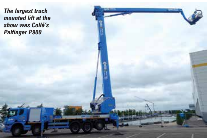
The largest truck mounted lift at the show was Collé's Palfinger P900