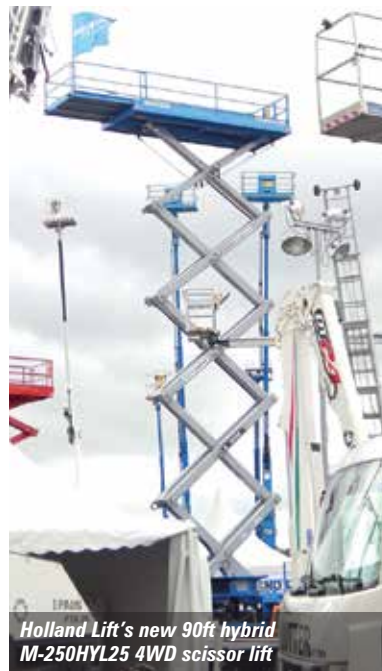
Holland Lift's new 90ft hybrid M-250HYL25 4WD scissor lift