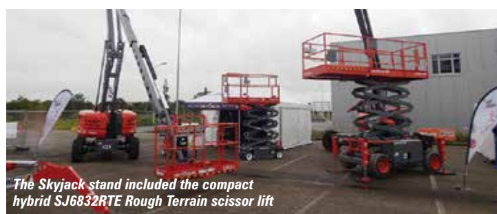
The Skyjack stand included the compact hybrid SJ6832RTE Rough Terrain scissor lift