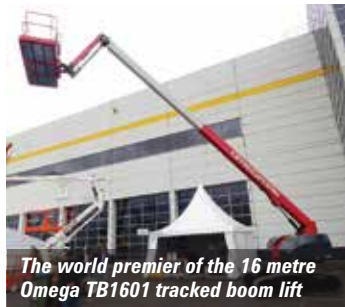
The world premier of the 16 metre Omega TB1601 tracked boom lift

There were plenty of big machines on display, including a 180ft Genie SX-180, a 90 metre Palfinger P900 truck mounted lift, a five tonne/35 metre Magni RTG5.35 telehandler and a 7.5 tonne Jekko SPX1275CDH tracked mini crane. There was also a good proportion of recently launched machines and the first public showing of Omega's tracked boom lift.