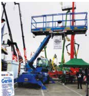
A Genie 360 degree telehandler with large integrated work platform.