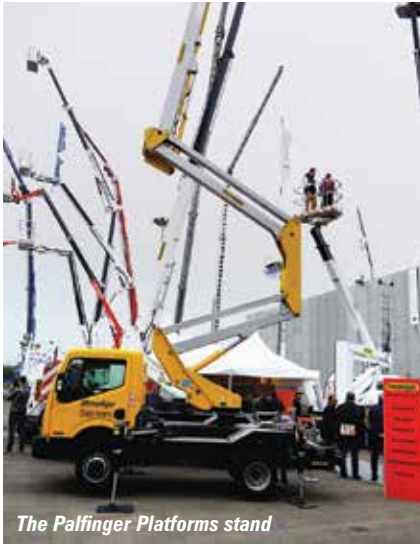
The Palfinger Platforms stand