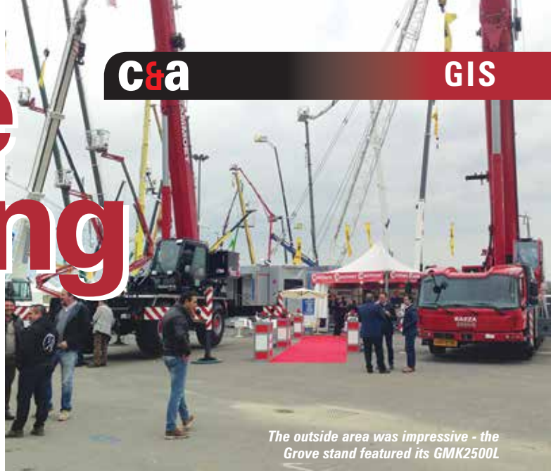
The outside area was impressive - the Grove stand featured its GMK2500L

The mood was relaxed and positive with some new products on display and orders placed for others in development. Talk of Bauma was also prominent, with manufacturers keeping new product details under wraps until next year but already excited about 2016.