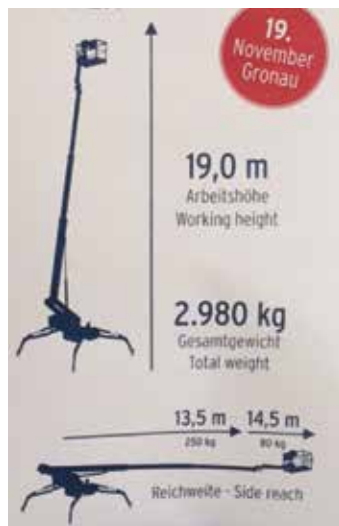
Teupen unveiled details of its new 19 metre Leo19T spider lift that weighs less than three tonnes, offers up to 14.5 metres outreach and up to 250kg platform capacity.