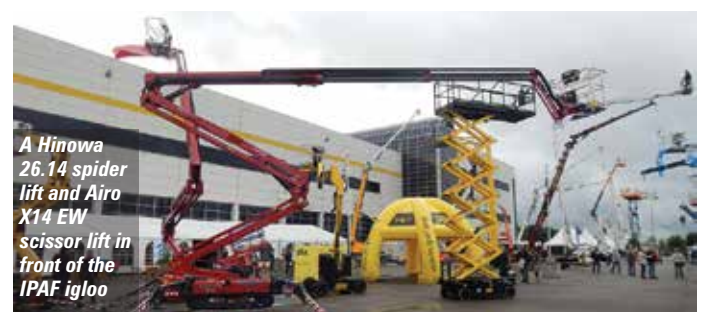
A Hinowa 26.14 spider lift and Airo X14 EW scissor lift in front of the IPAF igloo