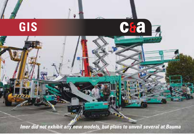
Imer did not exhibit any new models, but plans to unveil several at Bauma