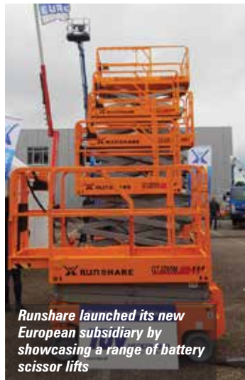
Runshare launched its new European subsidiary by showcasing a range of battery scissor lifts