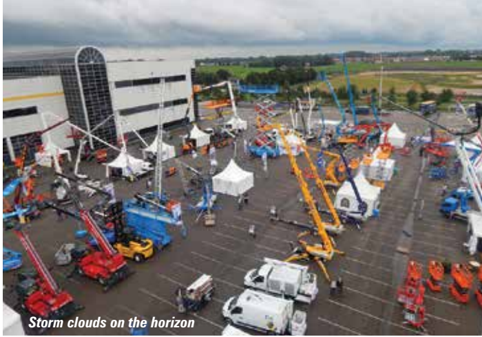
Storm clouds on the horizon