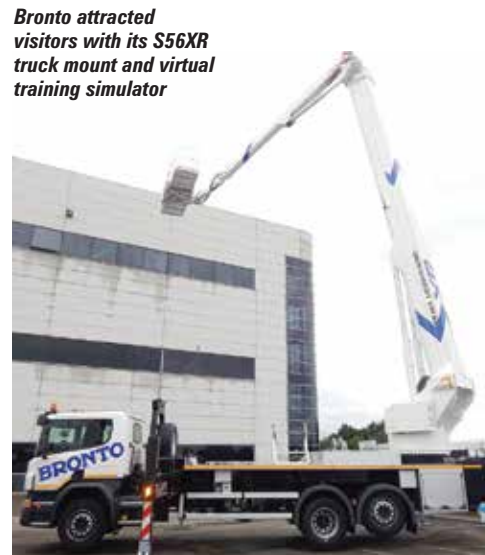
Bronto attracted visitors with its S56XR truck mount and virtual training simulator