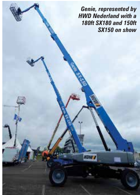
Genie, represented by HWD Nederland with a 180ft SX180 and 150ft SX150 on show