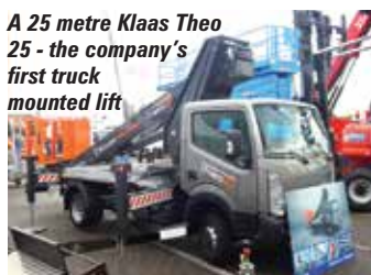
A 25 metre Klaas Theo 25 - the company's first truck mounted lift