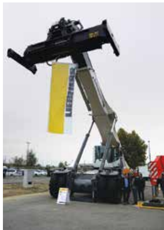
A Liebherr Reachstacker