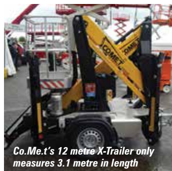
Co.Me.'s 12 metre X-Trailer only measures 3.1 metre in length