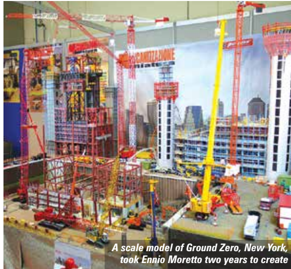
A scale model of Ground Zero, New York, took Ennio Moretto two years to create