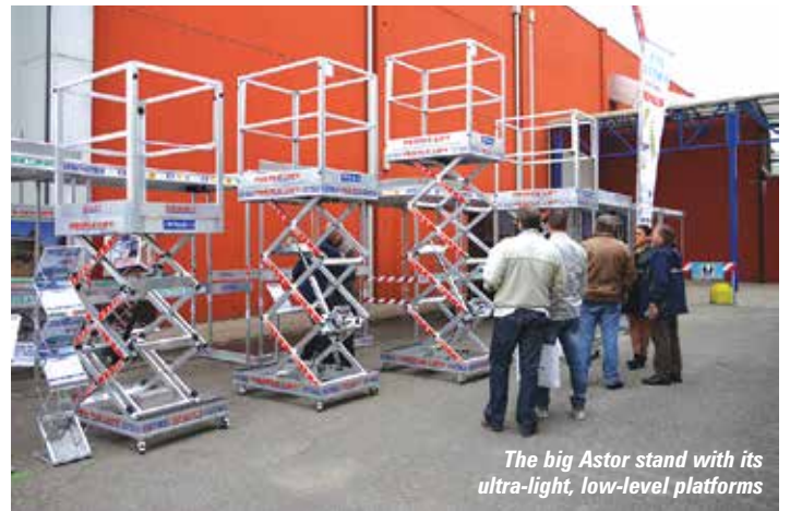
The big Astor stand with its ultra-light, low-level platforms