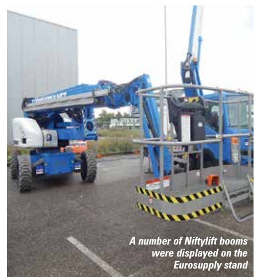
A number of Niftylift booms were displayed on the Eurosupply stand