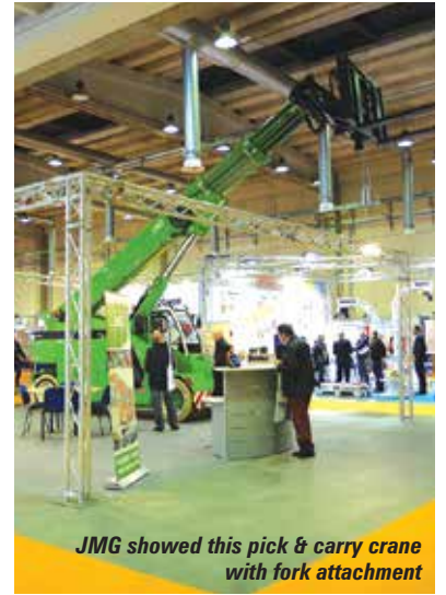
JMG showed this pick & carry crane with fork attachment

Flammable Gas and Vapour detection system, with automatic equipment shutdown, suitable for battery electric, diesel and LPG equipment deployed within areas NOT formally classified as potentially explosive.