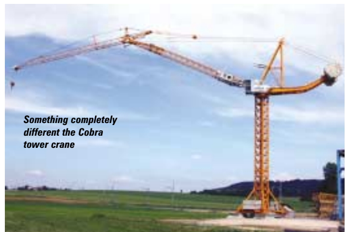
Something completely different the Cobra tower crane