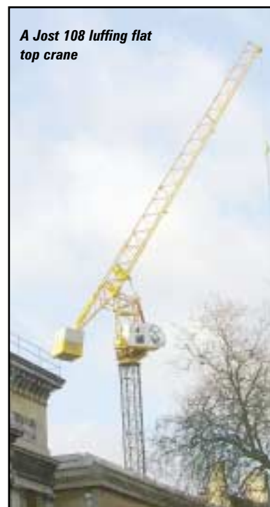
A Jost 108 luffing flat top crane

In November 2005 Jost cranes, the Munich based tower crane producer, introduced its JTL 108 and 158 topless luffing jib cranes. The company labels the new range as a third generation tower crane, offering the versatility of a luffing jib and a topless crane in a single unit.