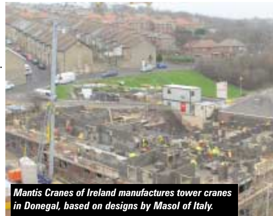
Mantis Cranes of Ireland manufactures tower cranes in Donegal, based on designs by Masol of Italy.

Baukham knows that to compete fully in the UK requires a fleet approximately 30 percent of which are luffers. Falcon has about 90 of them and Select has 80, but they are big units - up to 700tm - making it, according to Studd, "the biggest luffing fleet in the world". The problem for Arcomet is that Potain's luffers still have RCS winches - unbeatable in their day but now inverter drives are preferred. With the collapse of demand in Asia