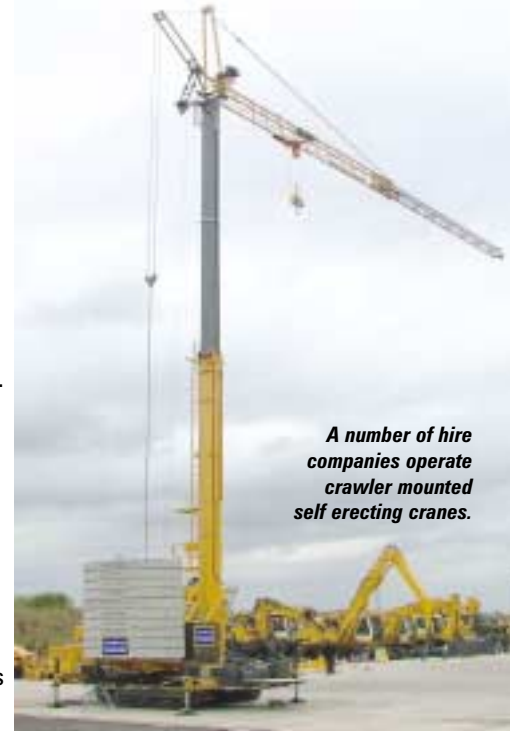
A number of hire companies operate crawler mounted self erecting cranes.

"I can't work out the tower crane market," says Trevor Jepson, "because I'm not a millionaire. It's a dangerous business, it's