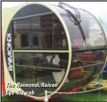
The Raimondi/Raivan Eye Vis cab

Vanson cranes has supplied three new Raivan MR108+3 flat top city tower cranes for use on the Victoria Square regeneration programme in Belfast. The cranes are being employed on the underground car park and area above.