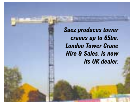
Saez produces tower cranes up to 65tm. London Tower Crane Hire & Sales, is now its UK dealer.