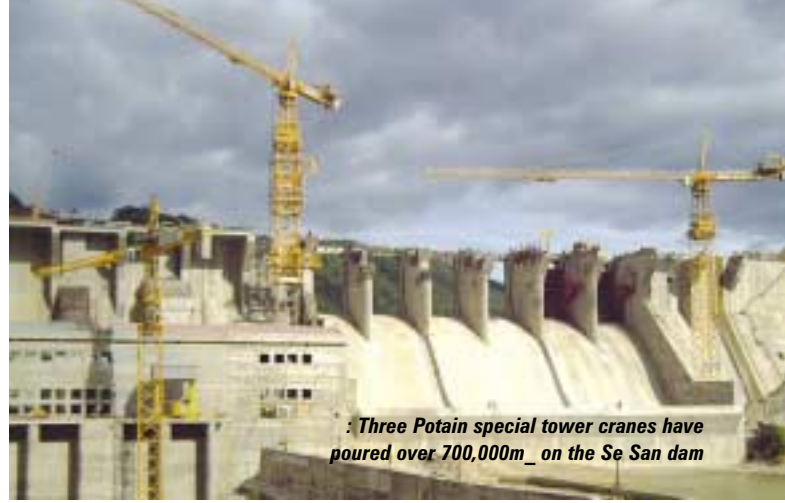
Three Potain special tower cranes have poured over 700,000m 3 on the Se San dam

Both MD 2200 cranes worked with maximum main jibs of 80 metres at a height under hook of 75.6 metres. One of the cranes also worked with a below-jib Nippon Topbelt concrete conveyor system, helping to pour some of the 700,000 cubic metres of concrete necessary for the build. The other MD 2200 crane used a seven metre bucket to pour concrete, while the 373 kW (500 hp) winch enabled it to carry out a variety of other lifting duties, including handling formwork.