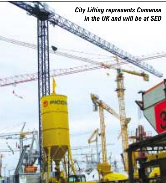
City Lifting represents Comansa in the UK and will be at SED