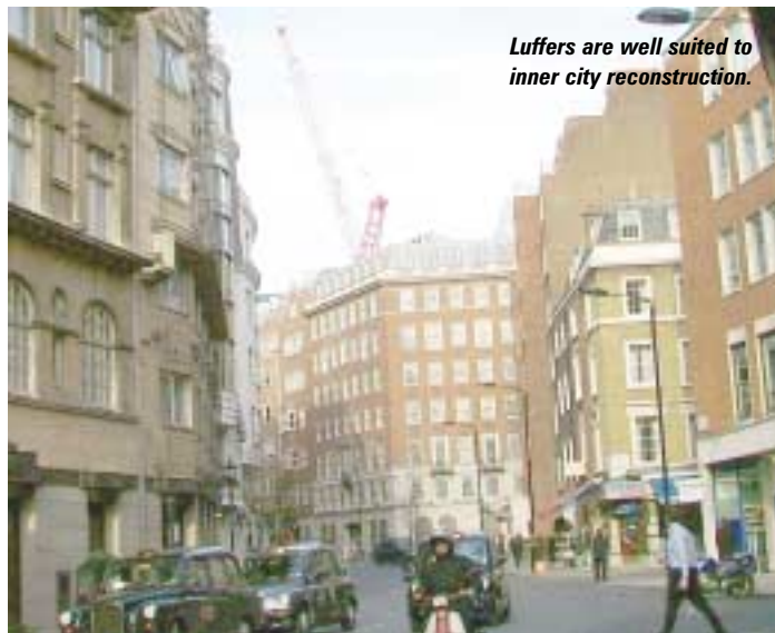
Luffers are well suited to inner city reconstruction.

In recruiting Arcomet as its distributor, Potain has effectively teamed up with its best customer's greatest rival. However, the bigger picture is that aside from Ladybird (which will continue to buy direct from Potain, and a few top-slewers to Sir Robert McAlpine, Potain has not had the kind of sales in the UK that a company