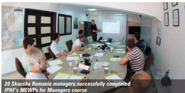
20 Skanska Romania managers successfully completed IPAF's MEWPs for Managers course

course effectively." The course is available in English, German, French, Italian, Dutch, Spanish and Portuguese from approved training centres around the world. Held over one-day, the course is not about operating equipment, but about planning, supervising and effectively managing the use of aerial work platforms on site. It ends with a written test that candidates must pass in order to obtain a certificate. More details can be found at www.ipaf.org/m4m