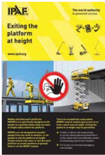
The E2 guidance illustrates the correct way to exit the platform at height where necessary.

Users should therefore only enter or exit the work platform at ground level or at an access position on the aerial work platform chassis. The document also outlines criteria for exceptional cases where aerial work platforms may be used to gain access to a work area at height, where exiting the platform at