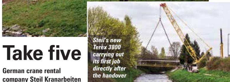
Steil's new Terex 3800 carrying out its first job directly after the handover