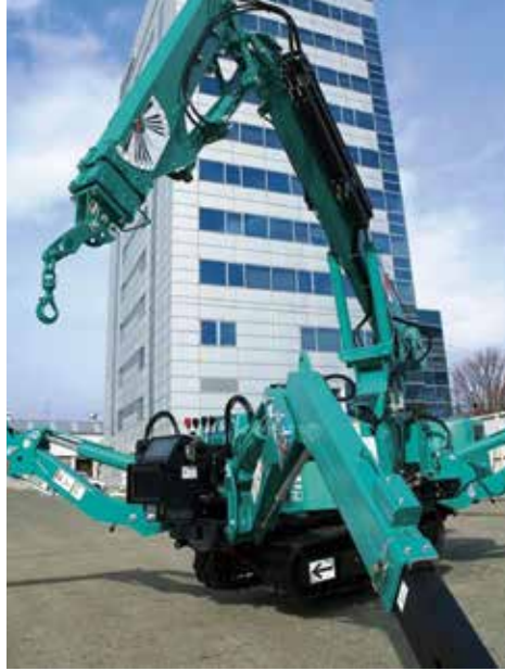
City Lifting has taken delivery of the first Maeda MK1033CWE-1 spider crane in the UK

The bi-energy 995kg capacity crane features a three section main boom and three section telescopic jib giving an up and over height of 7.5 metres. Maximum lift height is 11.3 metres with features including a detachable electric pack and an auxiliary winch. The company also took delivery of two diesel/electric MC 405 CRMEs bringing its Maeda spider crane fleet to 10.