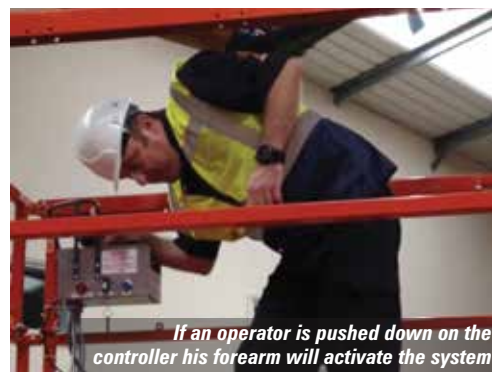
If an operator is pushed down on the controller his forearm will activate the system

sound a siren and start an emergency beacon if depressed. If inadvertently activated, it can be reset from the platform.