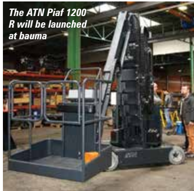
The ATN Piaf 1200 R will be launched at bauma

The first prototype has already been built and is currently on test at the company's plant in South West France. It has an overall width of 1.2 metres, is 1.98 metres high and 3.66 metres long. Outreach is a very respectable five metres and the machine has a 200kg platform capacity in its 800mm x 1.1 metre basket. Total weight is around 4,250kg.