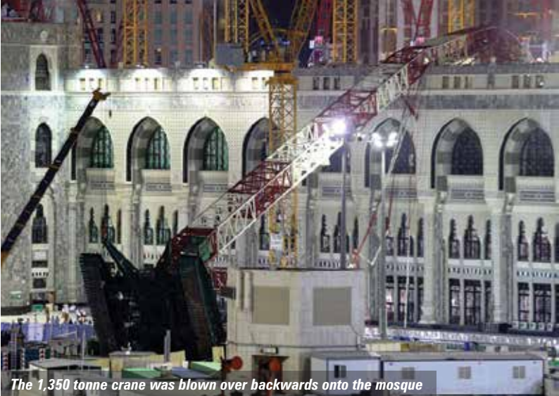
The 1,350 tonne crane was blown over backwards onto the mosque

A report presented to the King by the Saudi Accident Investigation Committee indicated that the incident was caused by a combination of negligence and strong winds. It confirmed that the manufacturer's instructions for rigging and making the LR 11350 safe when out of use were not followed, and that the crane was left in a vulnerable position in the