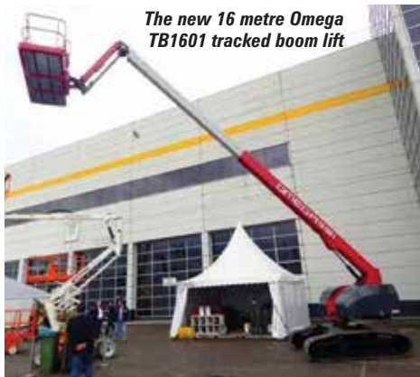
The new 16 metre Omega TB1601 tracked boom lift

approximately seven tonnes, the TB160J offers an outreach of 13.8 metres with 250kg unrestricted platform capacity. Powered by a four cylinder Kubota, features include 45 percent gradeability, 180 degrees of jib and platform rotation and 360 degrees continuous slew. The 14 metre working height TB140 features a similar specification, minus the two metre jib. It has an outreach of 11 metres and 350kg unrestricted platform capacity. Delivery of the first units is scheduled for the beginning of 2016.