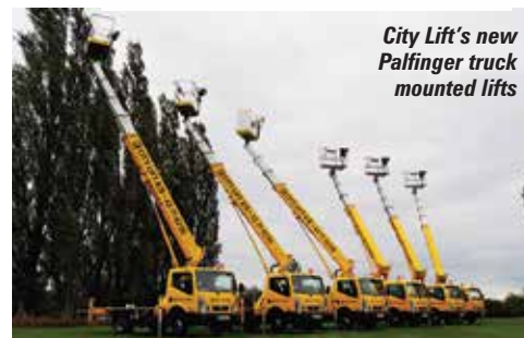
City Lift's new Palfinger truck mounted lifts

scissors include Iteco Easy Up 5 push around, IT80, IT90 and IT122 electric scissors and IT180 diesel-electric scissor lifts. It also ordered a 12 metre IMR12 and a 19 metre IMR19 Imer spider lifts.