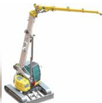
The Jekko SPK60 with luffing telescopic jib fitted.