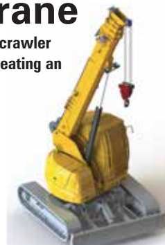
A computer generated view of the new Jekko SPK60.

Weighing 12.5 tonnes with counterweight, the new Yanmar-powered SPK60 has a maximum capacity free on tracks of six tonnes, a 17.7 metre five section main boom, plus optional four section telescopic luffing jib giving a maximum tip height of 28 metres. Maximum radius with the jib is 19 metres. The machine is 2.3 metres wide with tracks retracted or 2.9 metres when extended. Overall chassis length is 3.49 metres - 5.7 metres over the boom - with an overall height of 2.7 metres. One of the first units has been ordered by Nordkran of Germany.