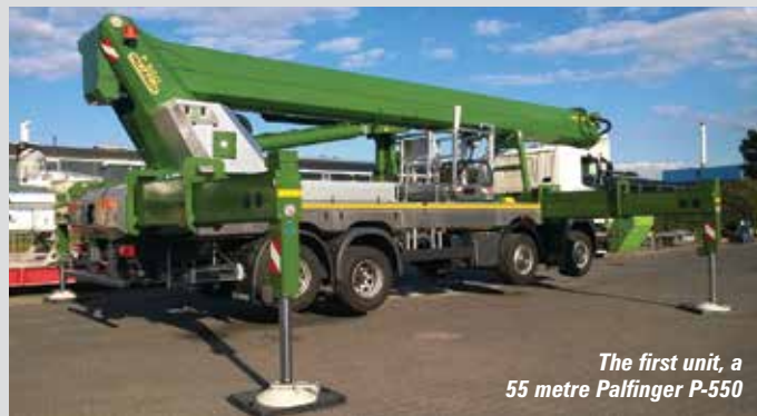
The first unit, a 55 metre Palfinger P-550

Units will be delivered one a month over the next year and the machines will be based at BMS facilities in Germany, the UK, Norway and Sweden. When the order is complete BMS will have 38 large platforms. All units will be equipped with heated platform floors and control consoles allowing operators to continue working in low temperatures. The machines will also include satellite links allowing BMS to monitor each machine remotely - part of a new programme that aims to guarantee a 24 hour availability for any customer anywhere in Europe.