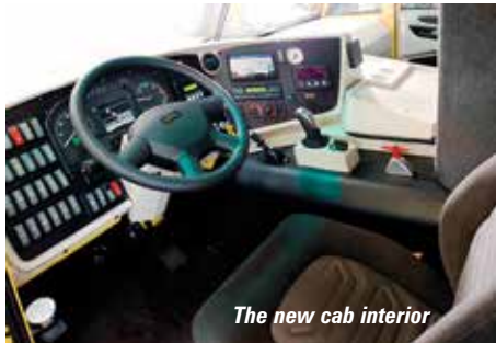
The new cab interior

Sales manager Koos Spierings said: 'With the new SK597-AT4 we have a machine that perfectly serves both the crane rental company as well as the end-user. Its 48 metre radius combined with the compact 2.75 metre overall width offers great advantages. The lifting capacity of 1,700kg at 48 metres and a hook height of more than 59 metres while luffing at 45 degrees give this crane all manner of possibilities.'