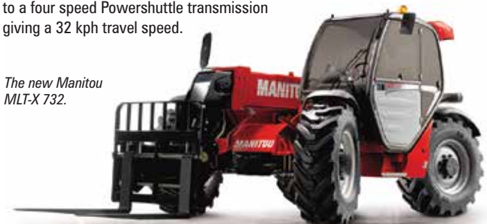
The new Manitou MLT-X 732.

Steil Kranarbeiten has taken delivery of another 650 tonne Terex Superlift 3800 lattice boom crawler crane - its fifth in three years.