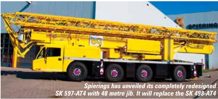
Spierings has unveiled its completely redesigned SK 597-AT4 with 48 metre jib. It will replace the SK 498-AT4