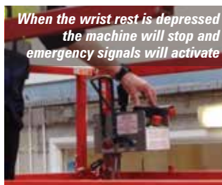
When the wrist rest is depressed the machine will stop and emergency signals will activate

The system features a self-test on start up and a spring loaded wrist rest that will stop the machine,