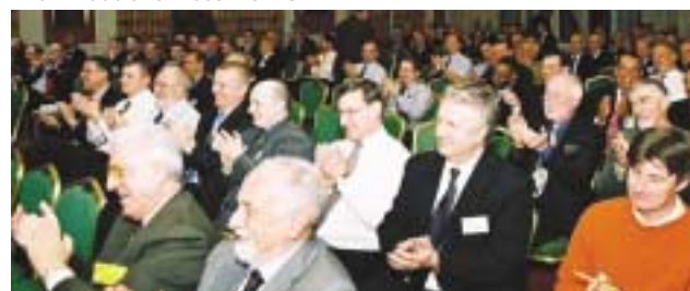
It was not all serious business