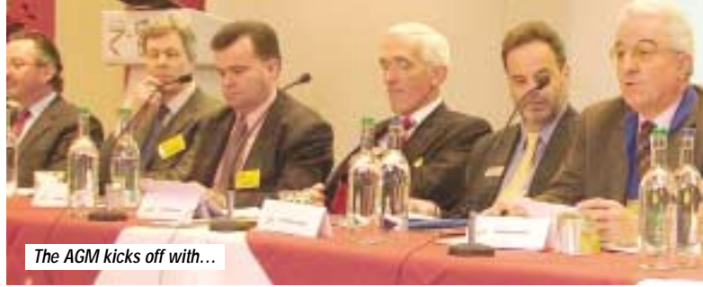
The AGM kicks off with...

The IPAF Annual General Meeting and Safety summit held in early April, attracted a record attendance. With the theme `Work Safely at Height` it was generally considered to be the best yet. We bring you a special four page photo supplement from this year's event.