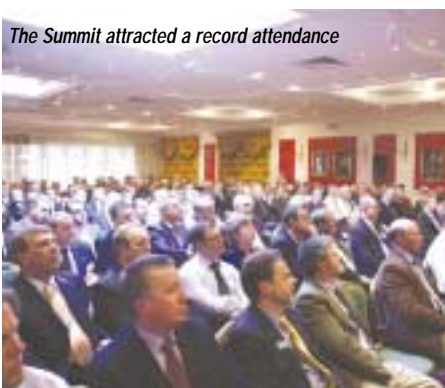
The Summit attracted a record attendance