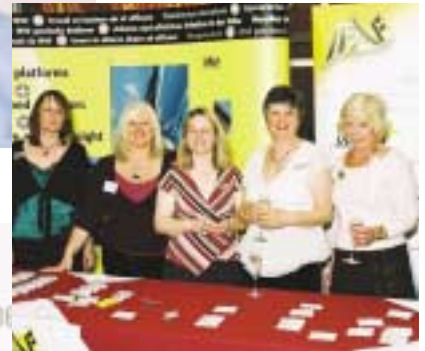
The Ladies of IPAF