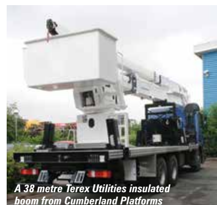
A 38 metre Terex Utilities insulated boom from Cumberland Platforms