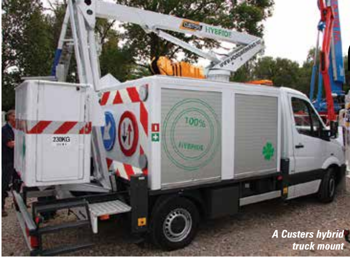
A Custers hybrid truck mount

particularly with tree trimming work. Stabilisers can deploy within the vehicle width or extend.