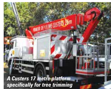
A Custers 17 metre platform specifically for tree trimming