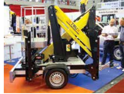
XTRUX which carries out the development work (Co.me.t the sales) has several unusual platforms including this compact trailer unit with just under 12m working height, 4.5m outreach and 200kg.

The above is just a small glimpse in the specialist vehicle mounted market. Finding the right access solution for a specific