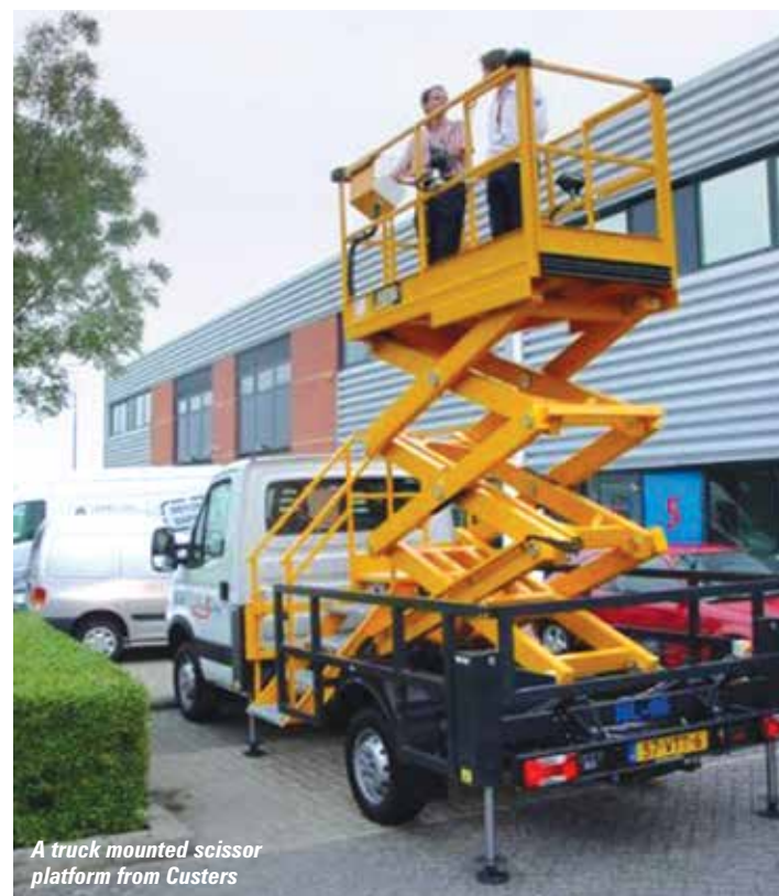
A truck mounted scissor platform from Custers