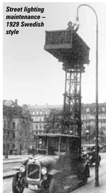
Street lighting maintenance – 1929 Swedish style

Companies such as France-Elevateur and Custers are good examples of manufacturers able and willing to build one-offs, but other companies including Time Versalift, XTrux/Comet, Cumberland Platforms and most companies that specialise in mounting platforms on chassis