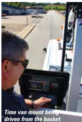
Time van mount being driven from the basket