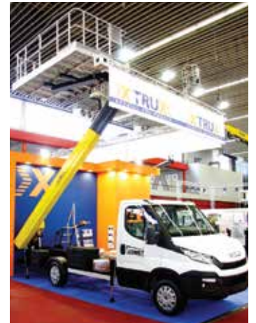
XTRUX also has this unusual Solar 16 metre truck mount with 400kg capacity and 4.5 metre outreach.

job can be very difficult. However there are plenty of companies out there that are geared up to supply the unusual in small numbers. Everything is possible .....it is just a matter of agreeing the price.