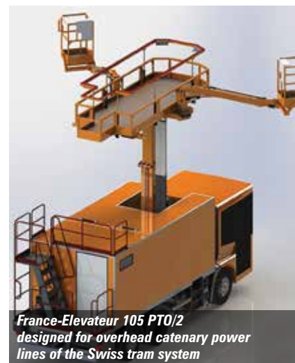
France-Elevateur 105 PTO/2 designed for overhead catenary power lines of the Swiss tram system

Founded in 1984 as Ibis Van with eight staff the company has had an interesting development expanding through acquisition and organic growth. First acquisition was International Ibis after it filed for bankruptcy. By 1987 the brand Eurelev Lift France was created with products bearing the France