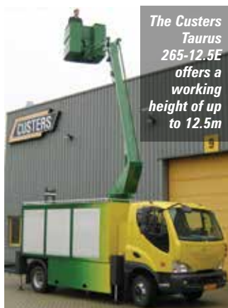
The Custers Taurus 265-12.5E offers a working height of up to 12.5m