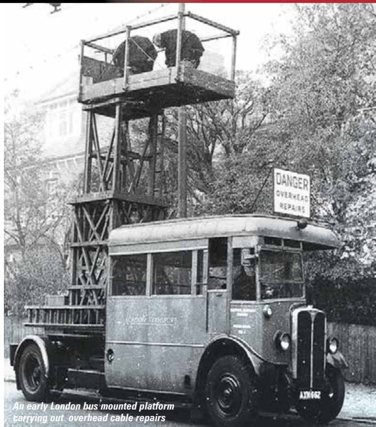
An early London bus mounted platform carrying out overhead cable repairs

are also capable. Time Versalift says it generally needs a production run of around 50 units before it starts designing but this will vary from manufacturer to manufacturer.