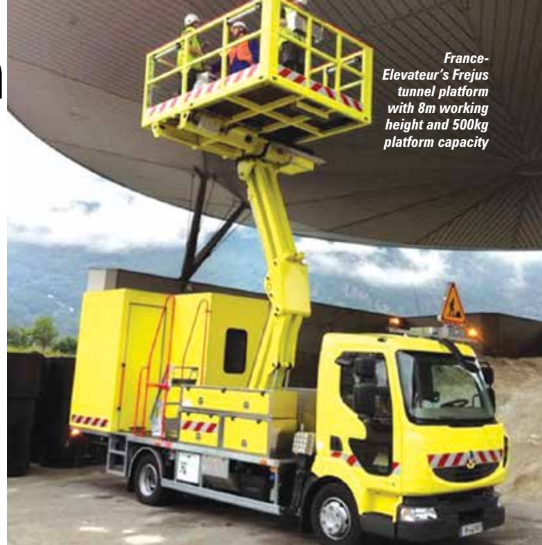
France-Elevateur's Fréjus tunnel platform with 8m working height and 500kg platform capacity

The other major European manufacturer of specialist, tailor-made access equipment is Netherlands-based Custers Hydraulica. As well as powered