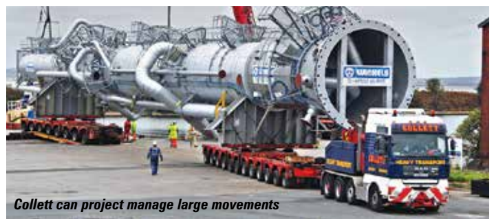
Collett can project manage large movements