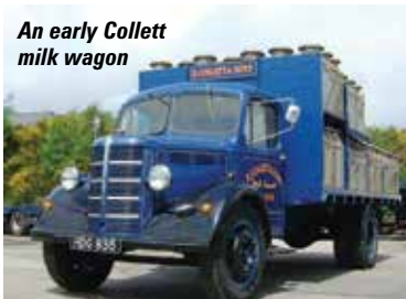
An early Collett milk wagon

"At the moment no-one has built a 550 tonne transformer but with this investment we are challenging