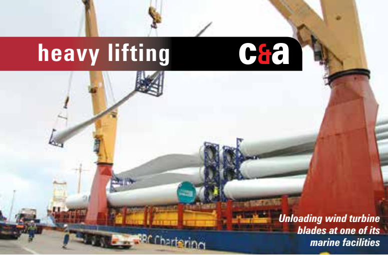
Unloading wind turbine blades at one of its marine facilities

the industry to produce larger equipment. The trailer is also modular, allowing us to adapt the specification and axle loadings to suit most European countries. Girder frame trailers are more popular in the UK than Europe primarily due their capability of moving large loads via a more advanced and developed water transport network."