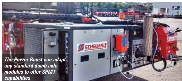
The Power Boost can adapt any standard dumb axle modules to offer SPMT capabilities