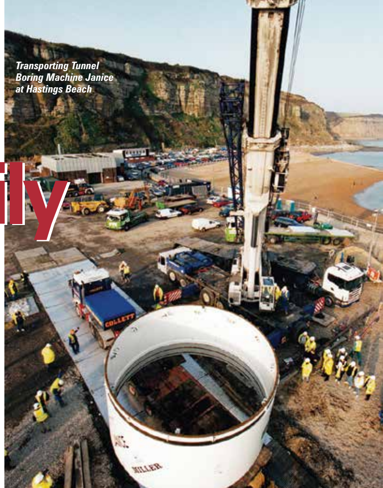
Transporting Tunnel Boring Machine Janice at Hastings Beach

Today the company employs more than 100 people and runs a fleet of 60 plus trucks and 100 trailers as well as a host of related equipment. Although there are four distinct divisions - consulting, marine, heavy lift and transportation - they operate as one company, with specific skills deployed in each division.