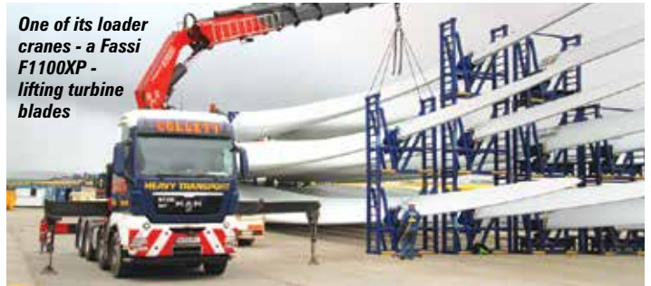
One of its loader cranes - a Fassi F1100XP - lifting turbine blades

we wanted are covered by the side outriggers. The advantages of this crane over a 40 to 45 tonne All Terrain are that the tractor unit can also tow a trailer and can lift the load onto the trailer itself. It is also quick to set up and fantastic in confined spaces. It gives us much more flexibility, allowing us to be fully in control of the lift and rather than having to rely on an external crane company. Having the largest loader crane just puts us in a position to carry out a wider variety of lifts - rather than it being bought for a specific contract."