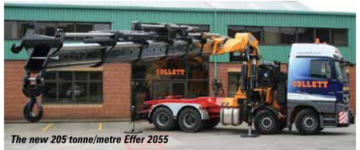
The new 205 tonne/metre Effer 2055

"ESTA is sponsoring the European Crane Operator License (ECOL) - so that operators all over Europe can work throughout the region with one recognised license. Around nine countries have already signed up to adopt the license, funding is available and a qualification has been designed - no mean feat but it will allow crane operators to work unhindered throughout the European Community. The association is also working on best practice guidelines for SPMTs (Self Propelled Modular Transport units), in order to reduce the number of incidents that occur with this type of equipment," he said, "which should be available sometime in the New Year."