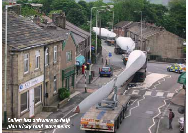
Collett has software to help plan tricky road movements

"It has taken 12 months to deliver the crane, since we first registered an interest and as it was the first, it was mounted at the Effer factory. Our unit does not have a front outrigger jack as the lifting duties