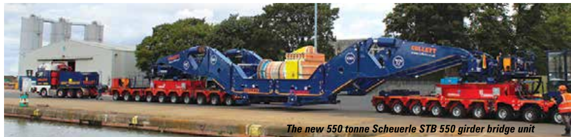
The new 550 tonne Scheuerle STB 550 girder bridge unit