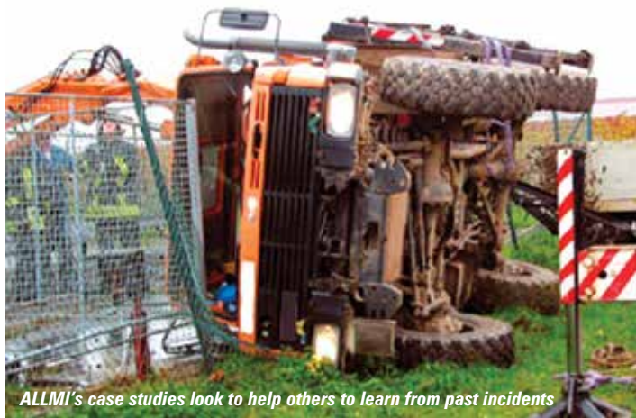
ALLMI's case studies look to help others to learn from past incidents