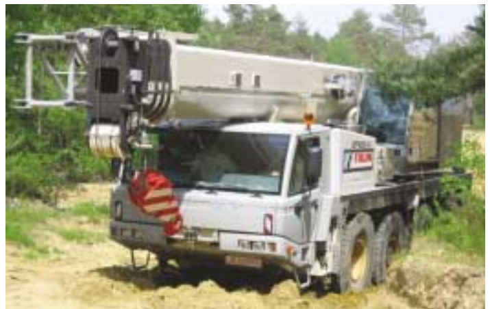
Tadano Faun's new ATF 65G-4 features the Faun all wheel steering system for improved rough terrain capability

This model also uses a single-stage, double-acting hydraulic cylinder to extend the boom, with a dual rope and pulley mechanism, providing fast telescoping even under load. An optional 9.5 metre offsettable folding fly jib means lifting heights of up to 45 metres and working radii of up to 39 metres are possible.