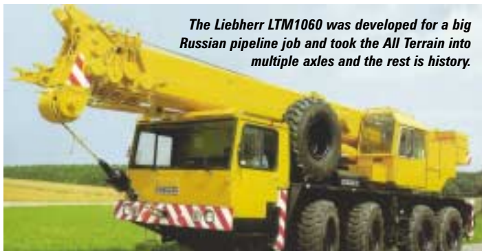
The Liebherr LTM1060 was developed for a big Russian pipeline job and took the All Terrain into multiple axles and the rest is history.

The company had some success with the venture. Then in 1977 Liebherr introduced a purpose built model the LTM1025, which probably did more to develop the concept than any other crane.