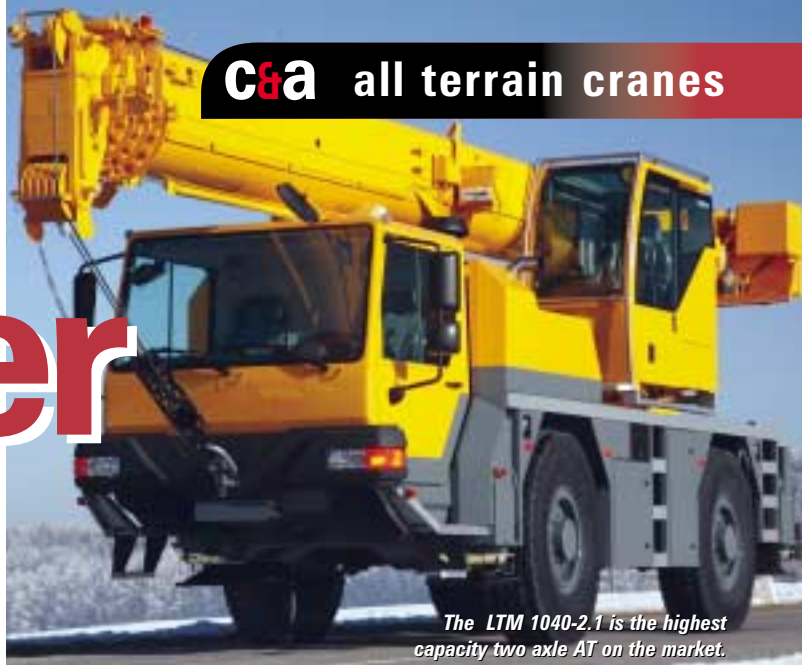
The LTM 1040-2.1 is the highest capacity two axle AT on the market.

Phil Bishop looks at what's new in All Terrain cranes and finds that boom lengths are getting longer, load charts getting stronger and chassis getting shorter.