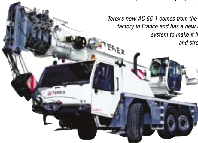
Terex's new AC 55-1 comes from the PPM factory in France and has a new boom system to make it lighter and stronger.

The third new machine in the four-axle class is the Tadano Faun ATF 65G-4, launched in Germany last year. It replaced Faun's best-selling All Terrain, the ATF 60-4, and at 65 tonne capacity is stronger thanks to a new lighter, stronger boom system. In common with other new ATs of the past couple of years, there are also improvements in