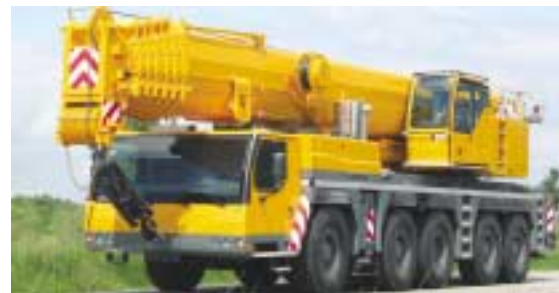
The Liebherr LTM 1200-5.1 has a 72 metre main boom and so offers a long-boom alternative to the stronger LTM 1220-5.1, which has a 60 metre boom.

Grove's new four-axle 80 tonne GMK 4080-1, replaces the 4075-1 and shares a similar driveline (Mercedes engine, ZF AS-Tronic transmission). However, the GMK4080-1 has a two-step transfer case to improve control at lower speeds. The carrier is 265mm shorter, at 12.5 metres.