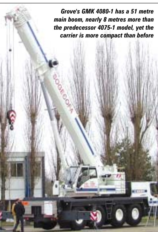
Grove's GMK 4080-1 has a 51 metre main boom, nearly 8 metres more than the predecessor 4075-1 model, yet the carrier is more compact than before

The greatest difference on the new 80 tonne Grove is its six section main boom. Where the 4075 offered 43.2 metres, the new machine extends to 51 metres. The boom overhang is also reduced from more than two metres to 1.8 metres. The GMK 4080-1 will lift 6.6 tonnes at a