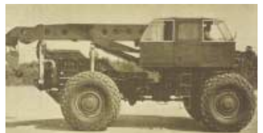
This 10 tonne MOD crane might have been the first AT?

Oh and by the way, that Smiths military crane of 1963 vintage, it inspired the Gottwald All Terrain cranes, which inspired the Grove AT180 and the idea of having both driving and crane cabs on the superstructure. While the back to back format of those cranes is dead, the modern City crane, which some would argue is the latest incarnation of the All Terrain, encompasses the ideas of those early models.