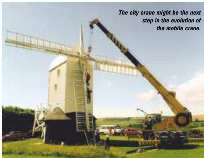
The city crane might be the next step in the evolution of the mobile crane.

We have also ordered two 2-axle all terrains to replace some older equipment. We have chosen the 35 tonne Terex short boom machine [AC 35]. The rates on the lower end of the market have increased slightly due to a lack of modern 2-axes in the area.