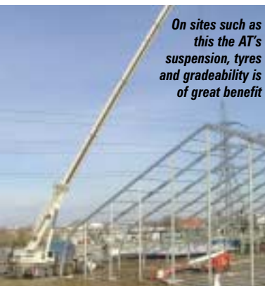
On sites such as this the AT's suspension, tyres and gradeability is of great benefit

Hydraulic luffing swingaways are available on many of the new All Terrains.