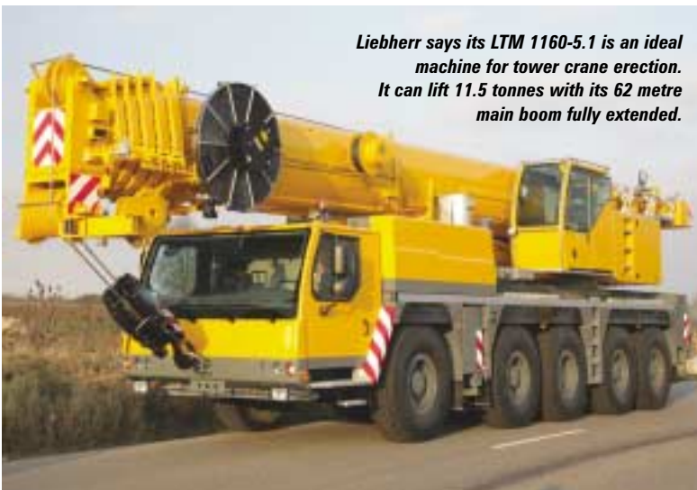
Liebherr says its LTM 1160-5.1 is an ideal machine for tower crane erection. It can lift 11.5 tonnes with its 62 metre main boom fully extended.

Carrier features such as the ZF AS-Tronic gearbox, integrated retarder, speed control system, automatic brake system, and active, speed-sensitive rear-wheel steering have been seen before on other recent Liebherrs. A first for mobile cranes, however, is the use of air-operated disc brakes. Integrated in the crane axles, according to Liebherr, they make braking more stable and reduce wear on brake pads; all brake pads