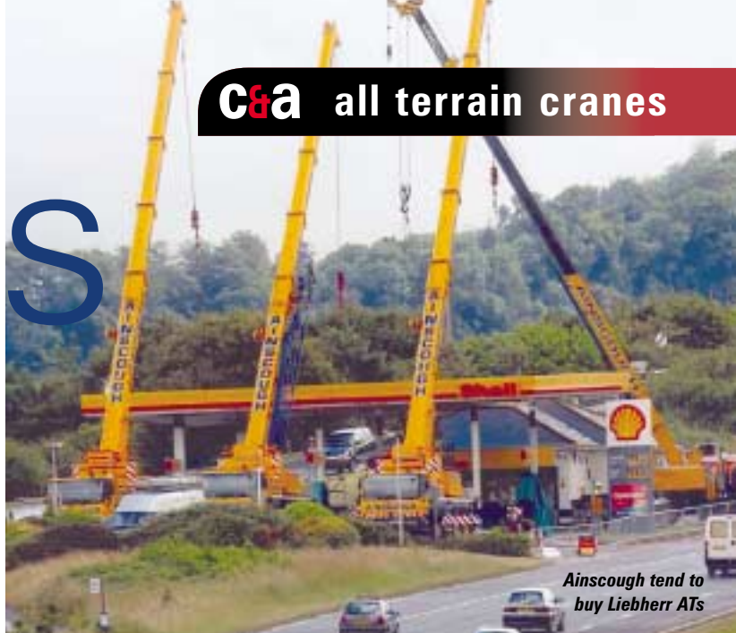
Ainscough tend to buy Liebherr ATs

We've got a GMK 4080-1 and a GMK 5130 on order. We get excellent service from Grove and, despite the current problems, I think that will continue. The product is excellent and so is the price. We've been running a GMK 5100 for five years. It's absolutely superb and actually made us as a company - that and our six Grove 50 tonners. They're the backbone of our fleet. Faun and Grove give us the same deal they give to the big boys, which I consider fair. Liebherr and Demag give deals to them that they won't give to me.