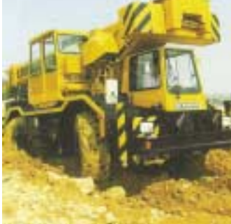
The Liebherr LTM1025 later to become the 1030, took the All-Terrain to the mass market

The first LTM1025 were, as we have already said, notoriously unreliable, in the late 70's Grove shipped one to its Shady Grove plant in the USA to find out what it was doing wrong with its AT180. It found the Liebherr to be every bit as difficult to keep running and declared the AT concept to be a gimmick, a "Jack of all trades". It considered that there was no future for such an unreliable products and promptly washed its hands of All Terrains for many years. It took two acquisitions for them to catch up again and only now is the company acknowledged as having an All Terrain line that truly measures up.