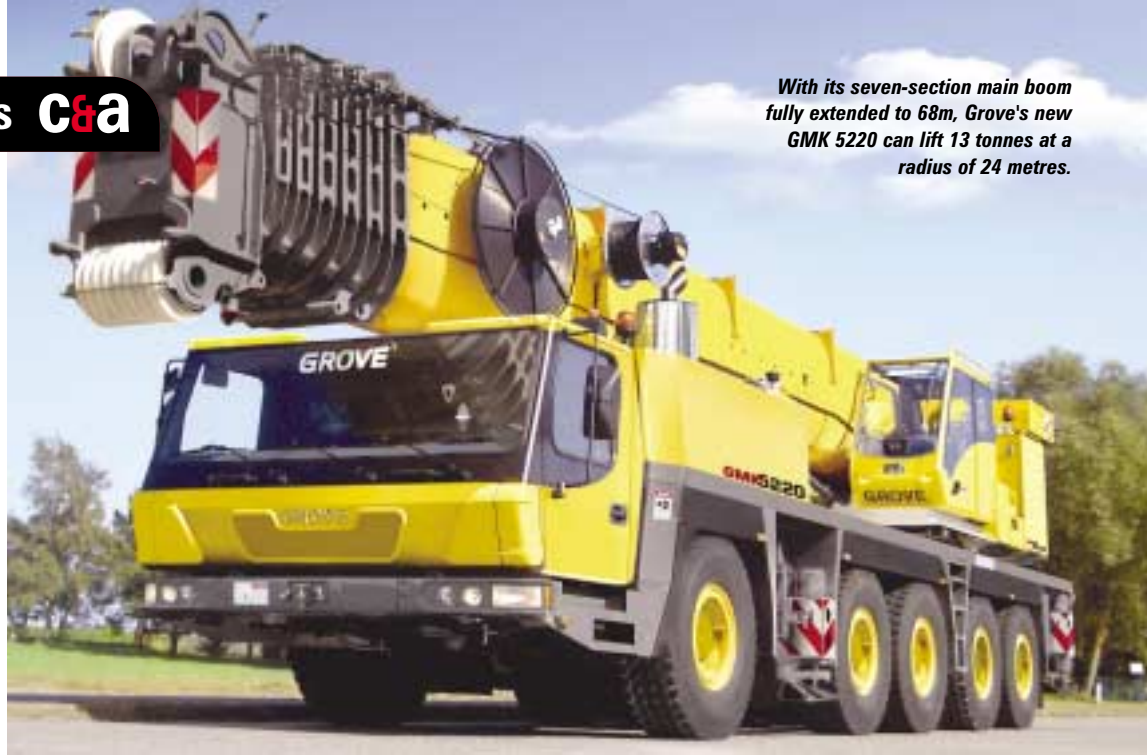
With its seven-section main boom fully extended to 68m, Grove's new GMK 5220 can lift 13 tonnes at a radius of 24 metres.

Terex-Demag also has a new 160 tonner, the AC 160-2. With an overall length of 12.35 metres, it is as compact as the Liebherr (a mere 5mm longer, in fact) but with a turning radius of 11.25 metres. The new