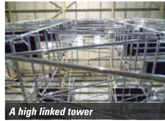
A high linked tower

for internal use and eight metres for external use, towers with cantilever platforms, towers less than 2.5 metres in height, commonly referred to as room scaffolds, linked towers and high clearance towers.