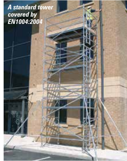
A standard tower covered by EN1004:2004