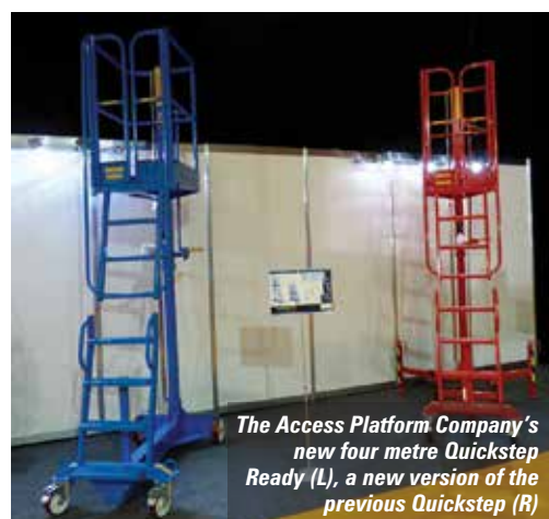
The Access Platform Company's new four metre Quickstep Ready (L), a new version of the previous Quickstep (R)

With no batteries, electrics or hydraulics it is inexpensive and easy to maintain.