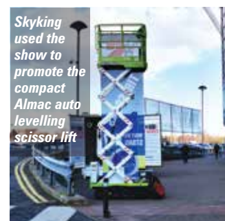
Skying used the show to promote the compact Almac auto levelling scissor lift