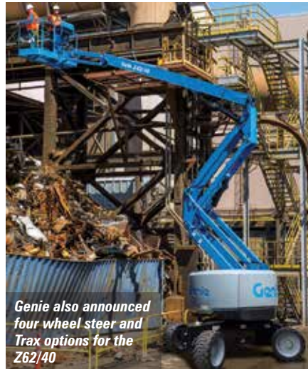
Genie also announced four wheel steer and Trax options for the Z62/40