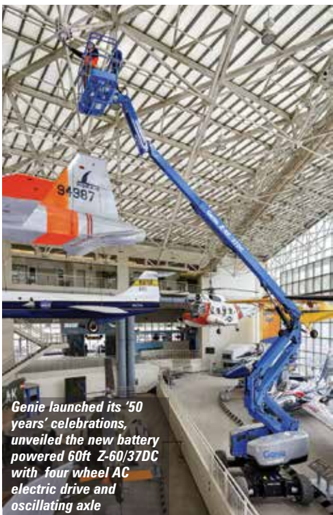
Genie launched its '50 years' celebrations, unveiled the new battery powered 60ft Z-60/37DC with four wheel AC electric drive and oscillating axle

SIMPLE ANSWERS TO COMPLEX LIFTING REQUESTS