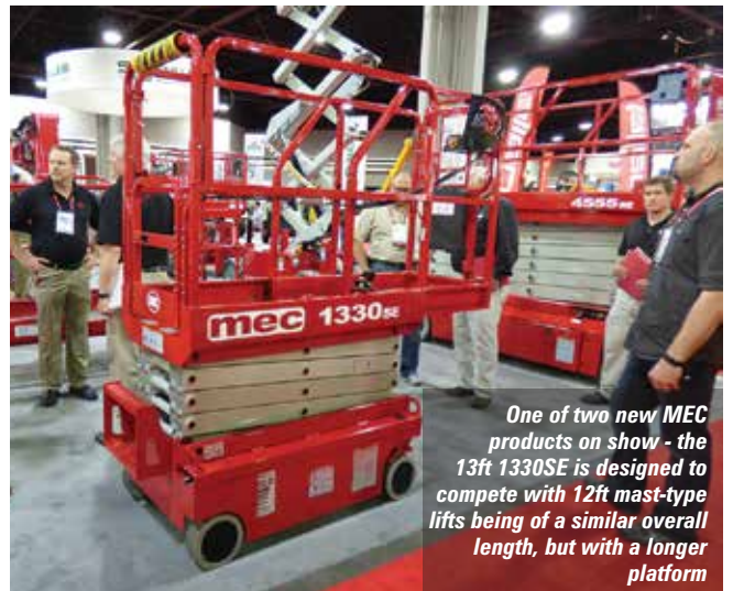
One of two new MEC products on show - the 13ft 1330SE is designed to compete with 12ft mast-type lifts being of a similar overall length, but with a longer platform