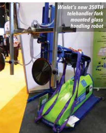
Winlet's new 350TH telehandler fork mounted glass handling robot

Winlet and its local dealer Hird, used the show for the UK launch of its new 350TH fork mounted glass handling robot, designed principally as a telehandler attachment. The electric powered 350TH is designed to handle glass panels up to 350kg with its four 270mm vacuum pads. Weighing 400kg, the attachment is made to fit most telehandlers and can rotate 360 degrees.