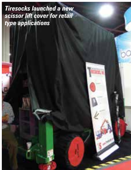
Tiresocks launched a new scissor lift cover for retail type applications