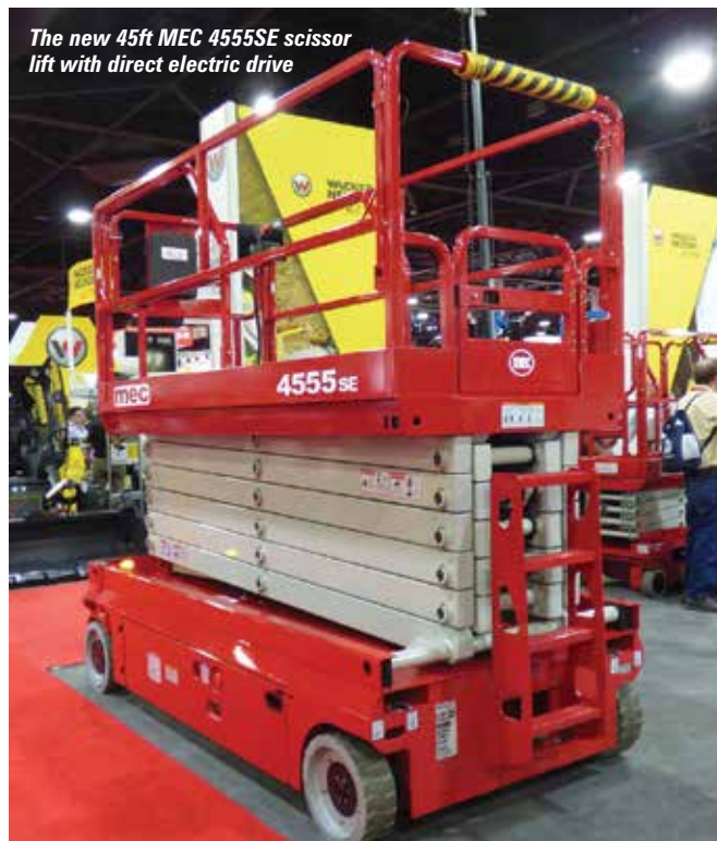
The new 45ft MEC 4555SE scissor lift with direct electric drive