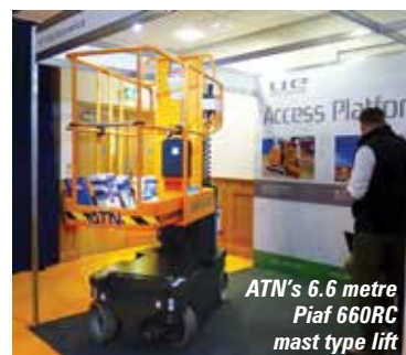
ATN's 6.6 metre Piaf 660RC mast type lift