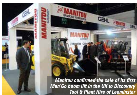
Manitou confirmed the sale of its first Man'Go boom lift in the UK to Discovery Tool & Plant Hire of Leominster

Next year the Executive Hire Show will be held on February 8th and 9th 2017.