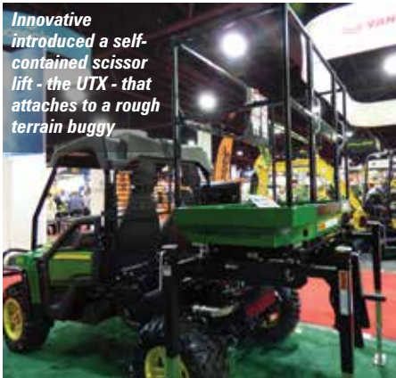
Innovative introduced a self-contained scissor lift - the UTX - that attaches to a rough terrain buggy