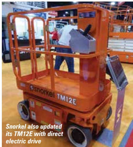
Snorkel also updated its TM12E with direct electric drive