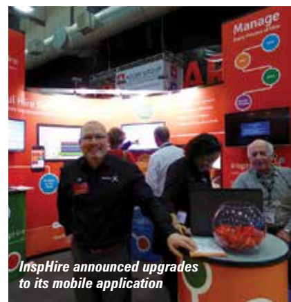
InspHire announced upgrades to its mobile application

At the same time InspHire announced upgrades to its own mobile application in which teams, service engineers and clients can communicate more effectively using GPS mapping.