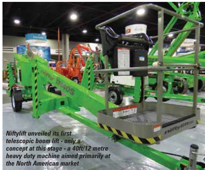
Niftylift unveiled its first telescopic boom lift - only a concept at this stage - a 40ft/12 metre heavy duty machine aimed primarily at the North American market