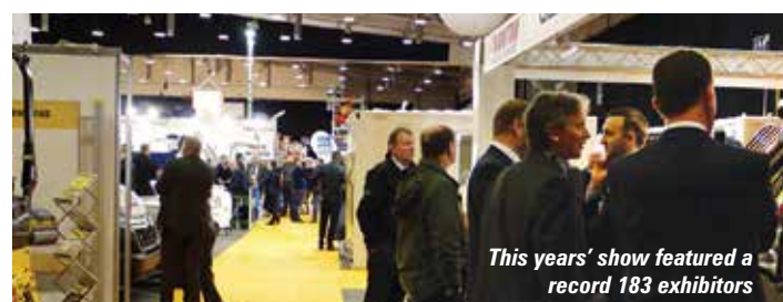
This year's show featured a record 183 exhibitors