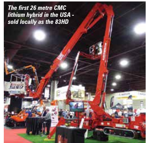
The first 26 metre CMC lithium hybrid in the USA - sold locally as the 83HD