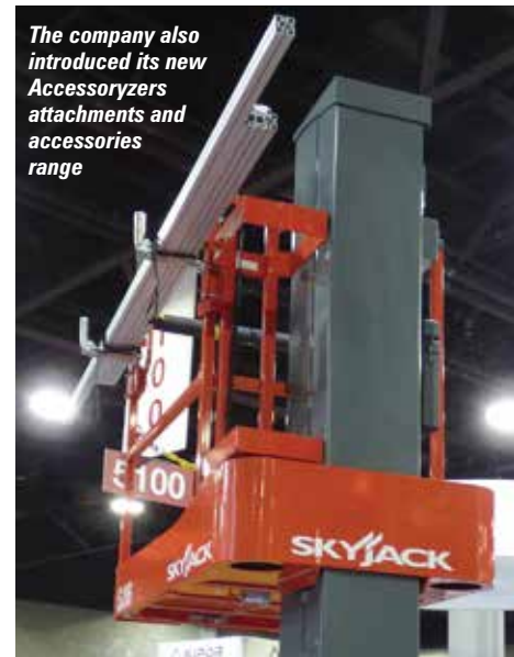
The company also introduced its new Accessoryzers attachments and accessories range