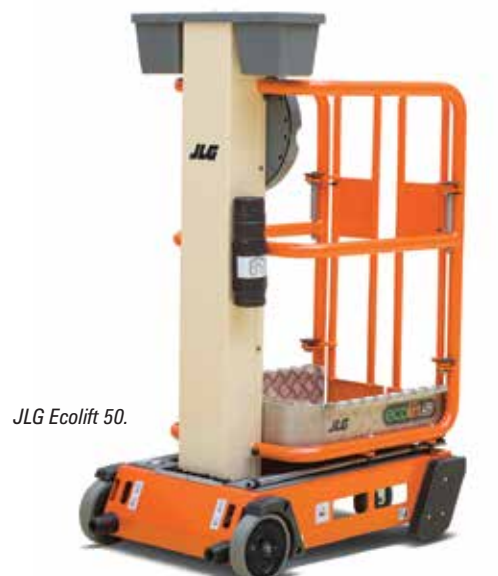
JLG EcoLift 50.