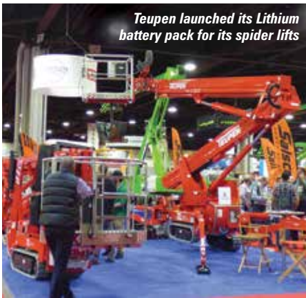
Teupen launched its Lithium battery pack for its spider lifts