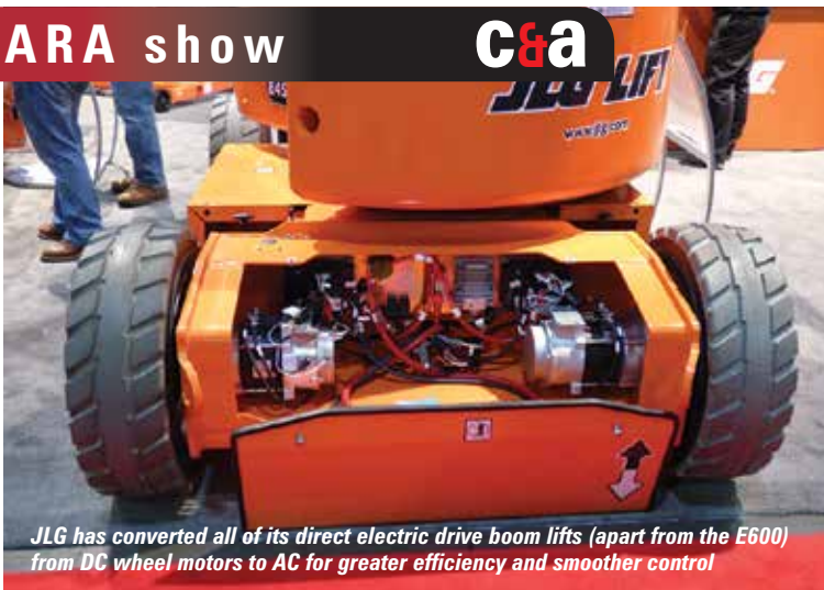
JLG has converted all of its direct electric drive boom lifts (apart from the E600) from DC wheel motors to AC for greater efficiency and smoother control