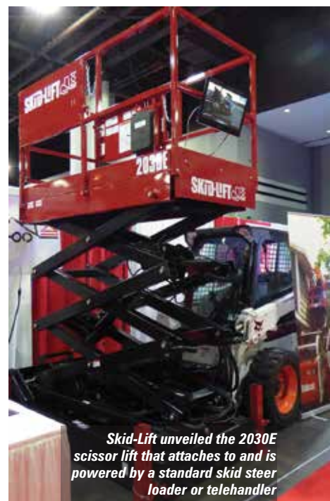
Skid-Lift unveiled the 2030E scissor lift that attaches to and is powered by a standard skid steer loader or telehandler