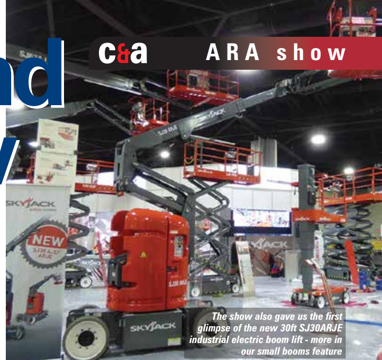
The show also gave us the first glimpse of the new 30ft SJ30ARJE industrial electric boom lift - more in our small booms feature

Some of the totally new product launches are covered in the 'News' section so we will not duplicate that here, and a more detailed look at the new products will also be covered in features as we go through the year and get a chance to evaluate the production machines. So in the following pages we will simply provide a pictorial overview of the new products on show and some of the more interesting displays.