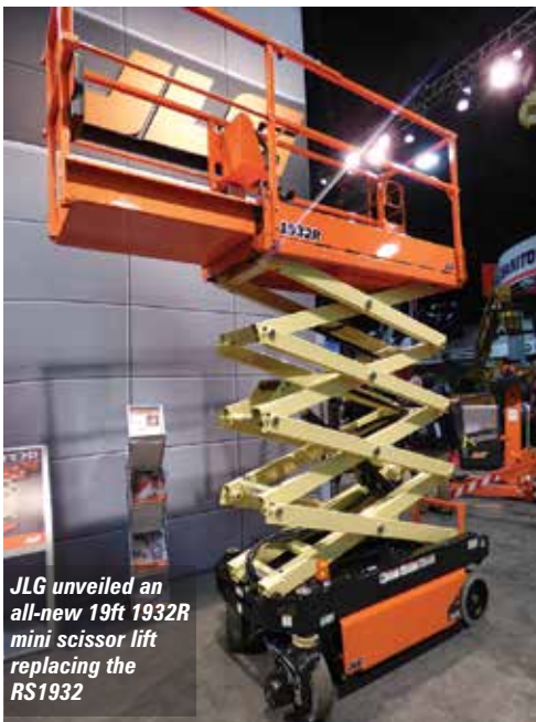
JLG unveiled an all-new 19ft 1932R mini scissor lift replacing the RS1932