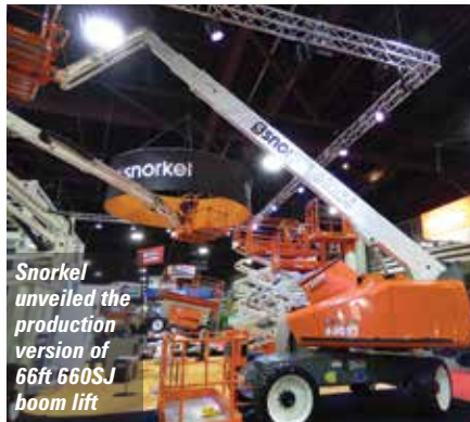
Snorkel unveiled the production version of 66ft 660SJ boom lift