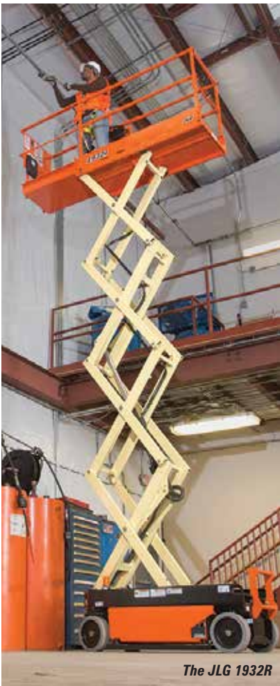
The JLG 1932R