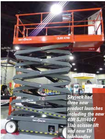
Skyjack had three new product launches including the new 40ft SJIII4047 slab scissor lift and new TH telehandler