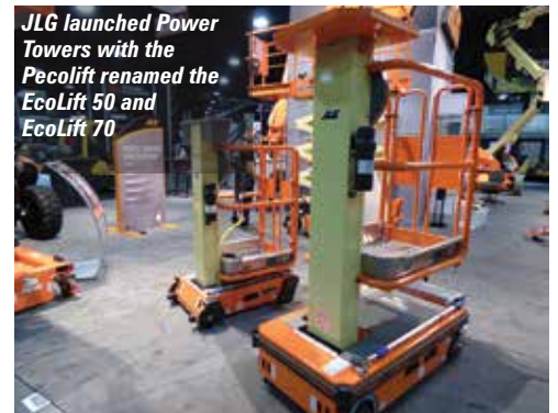
JLG launched Power Towers with the Pecolift renamed the EcoLift 50 and EcoLift 70