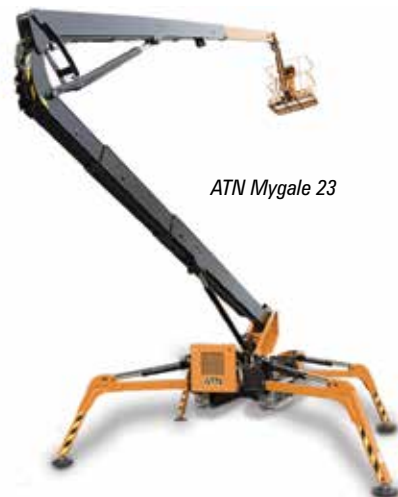
ATN Mygale 23

Multitel is hedging its bets, offering both options - the 17 metre SMX 170 has an unrestricted working envelope, while the 25 metre SMX 250 has a variable outreach, dependant on the load in the platform. With one person it has an outreach of 11.65 metres. With 200kg you get 8.6 metres and between these figures you get proportional increase/decrease. The benefit is that the SMX 250