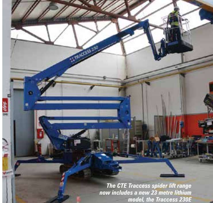
The CTE Traccess spider lift range now includes a new 23 metre lithium model, the Traccess 230E

provides faster speeds between working areas. Total weight is 5,500kg and as with other Omme spiders the machine can level on slopes of up to 30 percent.