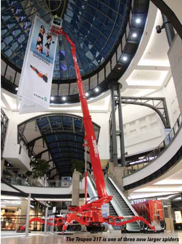
The Teupen 31T is one of three new larger spiders

boom stowing and return along with full diagnostics on a large in-cab screen.