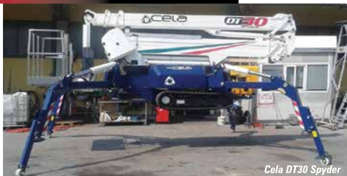
Cela DT30 Spyder

Weighing 3,100kg the machine has an overall length of 5.8 metres, is under two metres high and is a metre wide with the tracks extending to 1,300mm. Maximum outreach is 10.3 metres reducing to nine metres with its maximum capacity of 250kg. The lift is powered either by a water-cooled diesel, 220 volt electric motor or hybrid power pack.