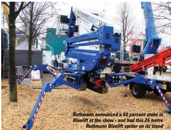
Ruthmann announced a 60 percent stake in Bluelift at the show - and had this 26 metre Ruthmann Bluelift spider on its stand