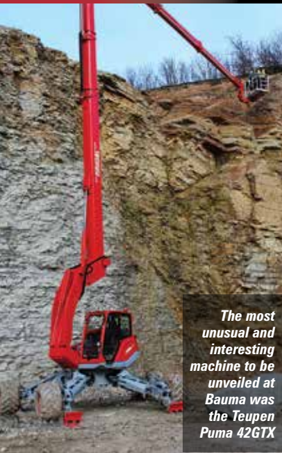
The most unusual and interesting machine to be unveiled at Bauma was the Teupen Puma 42GTX

million in an all-share purchase deal. Higher Access has depots in Burnley and Luton and has joined Vp's telehandler business - UK Forks. It would appear that several other major rental companies were in the running for this acquisition, with at least one of them deciding to re-evaluate its strategy for entering this specialist market, possibly purchasing a fleet of spiders for a green field approach?