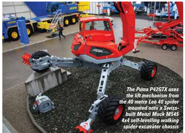
The Puma P42GTX uses the lift mechanism from the 40 metre Leo 40 spider mounted onto a Swiss-built Menzi Muck M545 4x4 self-levelling walking spider excavator chassis

restriction. Features include a two entry point, side opening basket, with retractable steps. Diesel, petrol and electric power packs, and more unusually an optional tow hook that can be used to attach a trailer for tools, work equipment or materials.