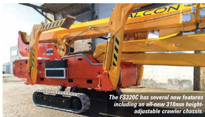
The FS320C has several new features including an all-new 310mm height-adjustable crawler chassis.

JLG expanded its Compact Crawler range - spider lifts to you and me - with the launch of the 15.4 metre X15J Plus - the smallest in its four model Plus range - which will be available globally from next month. The new lift has a platform capacity of 230kg, a substantial increase over the X14J, and is narrower with an overall width of just 750mm. The new design has forklift pockets and lifting hooks to make moving and transportation easier. Features include non-marking