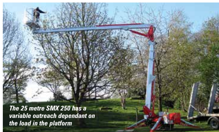
The 25 metre SMX 250 has a variable outreach dependant on the load in the platform

has an overall weight of 2,700kg making transport by a standard equipment trailer possible. The unit has a compact footprint of 3.4 by 3.56 metres. Of course there are jobs that are better suited to one than the other, but Melvyn Else of Multitel's UK distributor Access Industries Multitel asks: "do you always need two men in the basket? Is there always plenty of room to set up? Is the method of transport an important consideration? Some manufacturers are moving away from variable outreach platforms but the advantages are not obvious to see for general hire. Indeed in many cases the variable outreach option can be more versatile. You just need to be sure the customer understands which type of platform he is hiring."