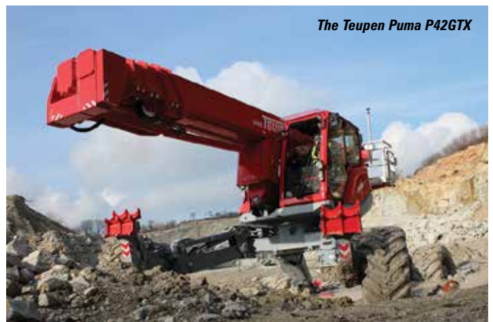
The Teupen Puma P42GTX

The boom pivot point is located onto a patented adapter that connects to the standard excavator pivot and raises the boom clear of the machine and its moving legs. This allows a high degree of articulation so the unit can travel, walk and climb over all manner of terrain. The centre of gravity moves freely between the four wheels to ensure ideal balance and safety. The superstructure features an air conditioned operator's cab for driving and operating the machine from lower controls, and includes 360 degrees continuous slew. Full controls are also located in the platform of course. All electronics and systems are Teupen designed and assembled and fully integrated. The technology includes automatic