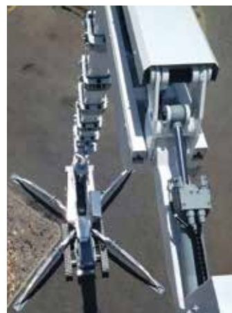
Omme Lift has introduced a completely new boom system for its 37 metre spider lift creating the new 3710 RBDJ.

The first new 35.4 metre R360 Hybrid was sold in its wheeled