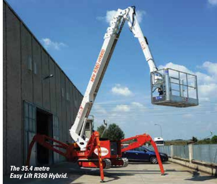
The 35.4 metre Easy Lift R360 Hybrid.

tracks and auto-levelling outriggers. Gradeability is 40 percent, while a combination of electric and petrol/diesel engines area available for indoor and outdoor use.