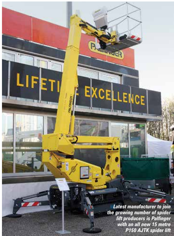
Latest manufacturer to join the growing number of spider lift producers is Palfinger with an all new 15 metre P150 AJTK spider lift

The new spider is a development of Palfinger Platforms Italy which is essentially mounting the superstructure of its Smart truck mounted platform on a tracked chassis, to create a 15 metre working height spider lift. The P150 is the first and smallest in a range of at least four models which will run from 15 to 25 metres to include the P180, P210 and P250, all of which will be available in the not too distant future. The new models all feature dual sigma risers telescopic booms and jibs on compact crawler chassis, which for the P150 AJTK has an overall width of 800mm and will clear a two metre overhead