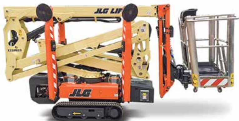
JLG has expanded its Compact Crawler range with the launch of the 15.4 metre X15J Plus.

a modular concept and new boom technology. Its latest generation of Leo machines - replacements for the Leo21GT and Leo24GT and the lightweight boomed Leo19T - have been developed using high-strength steel, together with modern bending and welding processes, resulting in higher load capacities - now 250kg standard - together with more outreach. Other features include internal cylinders, cables and hoses. The company has retained its 980mm wide chassis from the Leo21 and 24GT as a basis for the Leo19T and the Leo23T which can level on ground up to 1.2 metres out of level. The new Leo23T has a working height of 23.2 metres and with 250kg in the platform it has an outreach of 12.5 metres or 15.6 metres with 80kg.