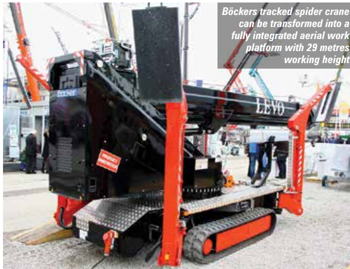
Böckers tracked spider crane can be transformed into a fully integrated aerial work platform with 29 metres working height

More recently Teupen has been designing its spider models using