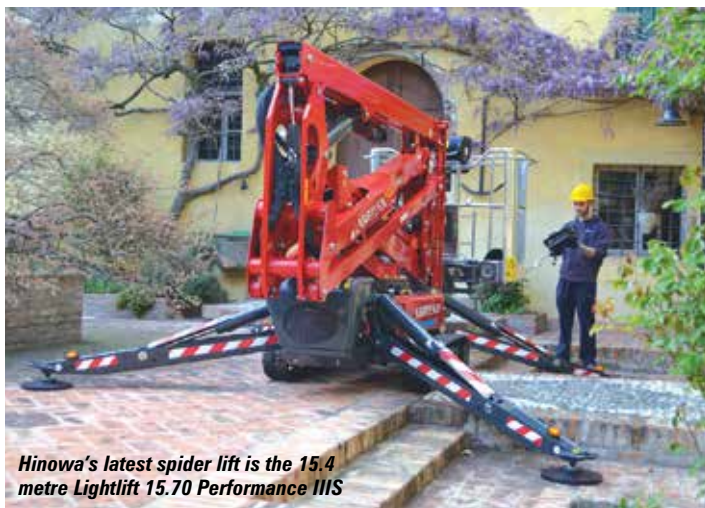
Hinowa's latest spider lift is the 15.4 metre Lightlift 15.70 Performance IIS

Palazzani launched a new 22.3 metre Ragno TSJ 23.1 at Bauma.