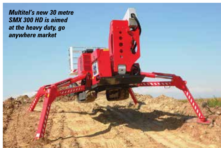
Multitel's new 30 metre SMX 300 HD is aimed at the heavy duty, go anywhere market