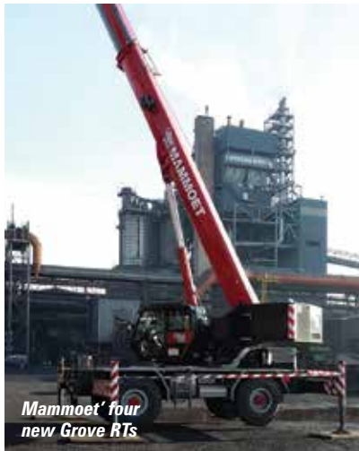
Mammoet's four new Grove RTs

Heavy lift and transport specialist Mammoet has purchased four new 45 tonne Grove RT550E Rough Terrain cranes. Built in Italy, the cranes feature a five section 39 metre main boom but no extensions. The cranes went straight to work on a steel mill in Belgium.