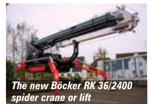
The new Böcker RK 36/2400 spider crane or lift

German lifting equipment manufacturer Böcker has launched a new spider crane/access platform. The RK 36/2400 is based on its new AHK 36/2400 trailer mounted crane which has a maximum boom length of 36 metres and 2,400kg maximum lift capacity. Working height with platform is 29 metres.