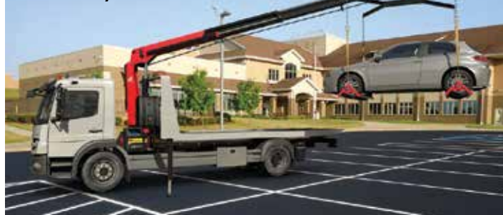
The new Ferrari 7000D aimed at the car recovery market

Plus 10 articulated cranes, starting with the simple HB range, made up of the HB130 and HB160 with 13 and 16 tonne/metre ratings, designed for routine delivery duties. The more sophisticated HC line comprises six models - the HC131, HC143, HC153, HC161, HC171 and HC183, with capacities from 13 to 18 tonne/metres, equipped with double linkage boom systems targeted at more complex lifting applications. And finally the HC131K and HC161K short boom articulated cranes with double linkages, designed for heavy duty deliveries, such as grab and clamshell work for installation on short wheelbase trucks.