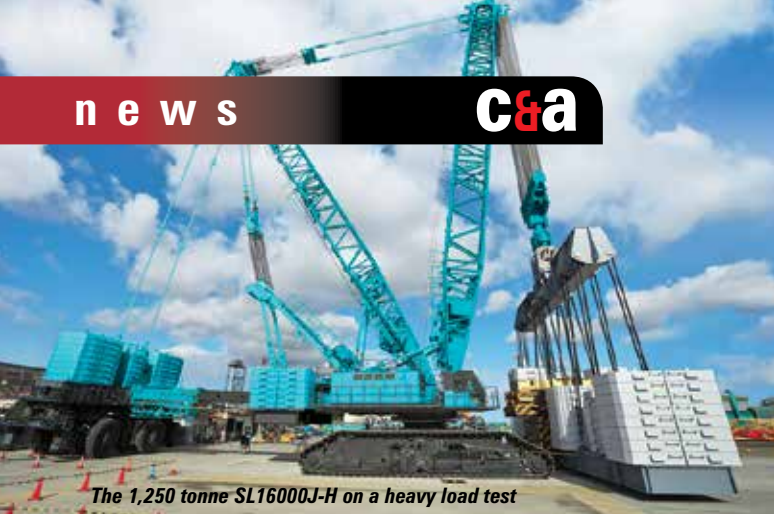
The 1,250 tonne SL16000J-H on a heavy load test