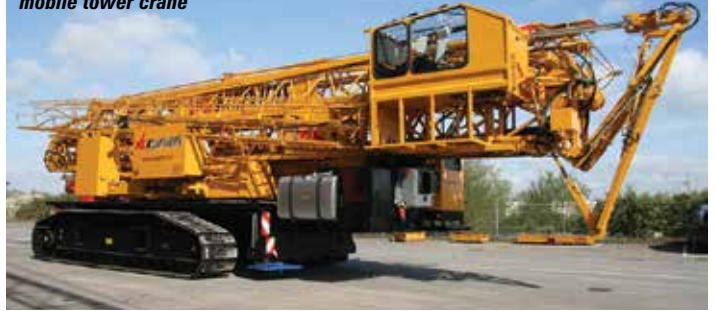
The HRP477R self-erecting mobile tower crane