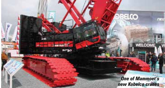
One of Mammoet's new Kobelco cranes