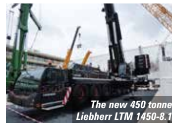
The new 450 tonne Liebherr LTM 1450-8.1

Liebherr's mystery eight axle All Terrain turned out to be the 450 tonne LTM 1450-8.1. Liebherr said the crane was designed for "useability" rather than maximum capacity, and boasts an 85 metre seven section boom but no Y-guy superlift system. It also features two rotating counterweights that can increase the ballast radius from five to seven metres offering capacity improvements of up to 20 percent.