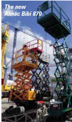
The new Almac Bibi 870

The length of the 1.2 metre wide platform can be extended to 2.35 metres. Levelling capability is 15 degrees side to side and 20 degrees longitudinally, while new features include dynamic automatic levelling, allowing the machine to level automatically as it moves over changing ground conditions. It will be available in three versions, the gas/petrol powered Bibi 870-BL, the diesel powered 870-BL Evo and the 870-BL Hybrid. Overall weights range from just under two tonnes for the BL to almost 2.5 tonnes for the Evo.