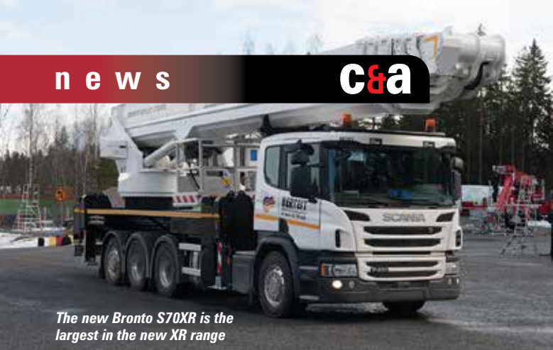
The new Bronto S70XR is the largest in the new XR range