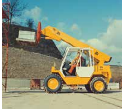
The first JCB telehandler - the Loadall 520

The company delivered its 100,000th unit in 2006 and invested £8 million in a second assembly line at its Rocester, UK, facility. The first HiViz models were unveiled in 2007 and in 2008 it launched a completely new side-engine, high-boom design for the North American market. More recently development has gone in to the engines, with cleaner more fuel efficient EcoMAX engines. In 2012 the first heavy duty model arrived, with the eight metre/five tonne 550-80 and then in 2014 the range topping 20 metre 540-200.