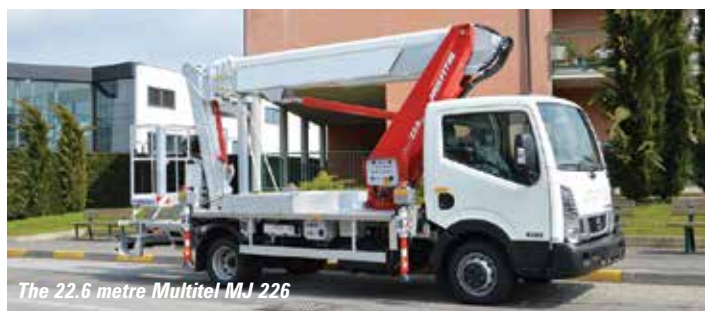
The 22.6 metre Multitel MJ 226