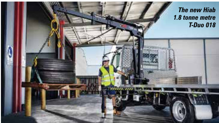
The new Hiab 1.8 tonne metre T-Duo 018

The unit will combine two AL.SK cranes into a single, twin-boomed, mega lift crane with a load moment of 708,000 tonne metres. It will use two 4,000 tonne winch systems and two hook blocks, operated from one control point by a single operator. The new crane is aimed at lifting super-heavy modules in the offshore and shipbuilding industry and will be fully containerised for shipping.