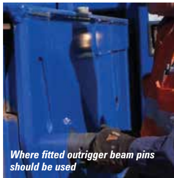
Where fitted outrigger beam pins should be used

Many crane users appear to think that the pins supplied are merely an additional safety feature. While most western built cranes may be able to rely on the hydraulic beam extension cylinders, some of them may be too small a bore to support the crane, should it lift up onto the outriggers on one side. Even if the cylinder holds, its anchor point might not support the loadings applied. So if your crane is equipped with outrigger beam pins, you should always use them.