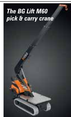
The BG Lift M60 pick & carry crane

Italian manufacturer Brennero Gru unveiled a new range of mini cranes under the BG Lift brand. Key new products are the BG Lift M300, a three tonne spider crane with telescopic articulated jib and the 580kg capacity BG Lift M060 tracked carry-deck crane with three section 3.5 metre boom and maximum radius of three metres.