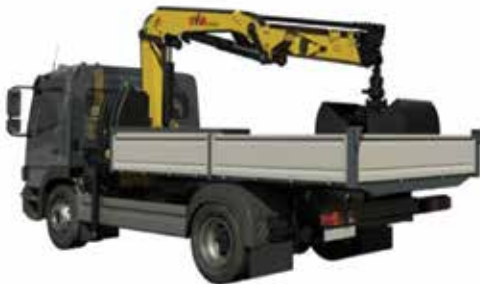
The Hyva HC K series with double linkages, designed for heavy duty deliveries, such as grab and clamshell work

Hyva and Ferrari have announced two new families of cranes with 13 and 16 tonne/metre class ratings. The two families include 12 models and variations comprising two telescopic models - the 13 tonne HT130 and 16 tonne/metre HT162 aimed at the car recovery market, and applications where a compact, light and easy to operate crane is required.