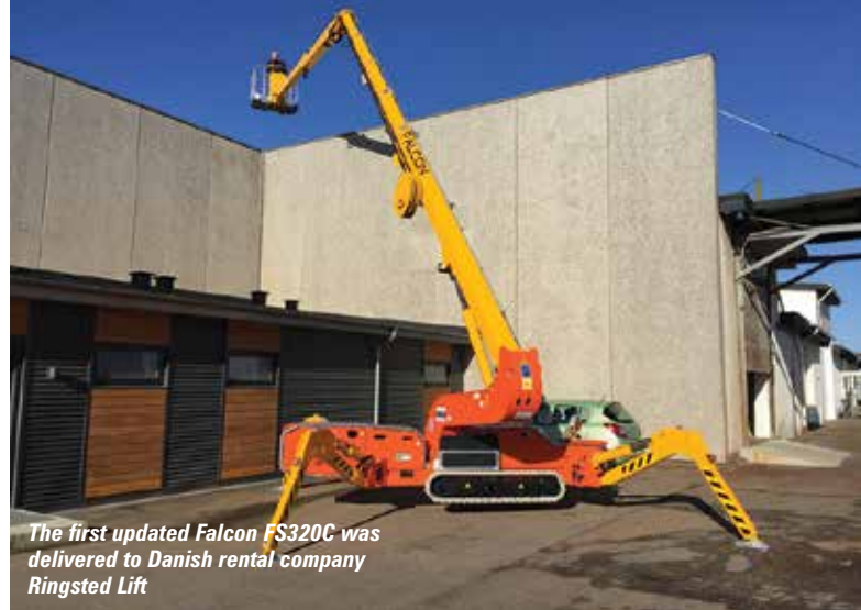
The first updated Falcon FS320C was delivered to Danish rental company Ringsted Lift

The new models feature a new control station with user-friendly interface. The new Dynamic Load Diagram system, confirms the available lifting capacity based on the truck's stability at the time, while 'Magic Touch' allows automatic stowage and unfolding from travel to ready to work position. The new cranes include several radio remote control options and a wide range of stabiliser configurations. The 425 degree slewing is said to be best-in-class for medium sized cranes. The 12 models will also be available under the Ferrari brand as the 7000 and 9000 ranges.