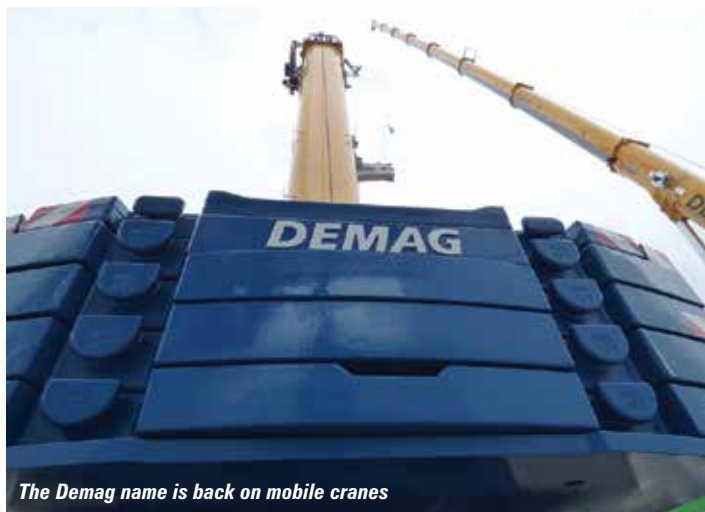
The Demag name is back on mobile cranes