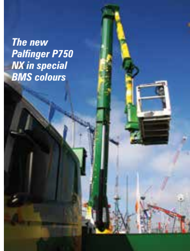
The new Palfinger P750 NX in special BMS colours

As with the other models in the range it features a telescopic main boom plus the long two section top boom/jib and the innovative X-jib with up to 240 degrees of articulation which also allows a platform rotation of 400 degrees.