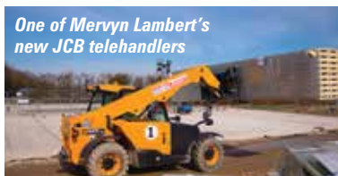
One of Mervyn Lambert's new JCB telehandlers

Mervyn Lambert Plant Hire has purchased 40 new JCB telehandlers in a deal worth over £2 million. The units range from six to 17 metres, and include the compact six metre JCB 525-60 Hi-Viz. Mervyn Lambert took 28 JCB telehandlers last year taking the number of machines purchased in the past 12 months to 68, with a value of almost £3.5 million.