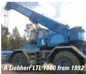
A Liebherr LTL 1080 from 1992

We can now confirm that Liebherr will launch a new line of Rough Terrain cranes within the next 12 months.