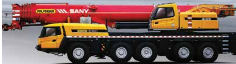
The 220 tonne Palfinger Sany SAC 2200