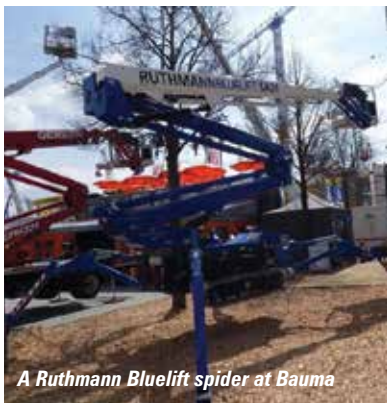
A Ruthmann Bluelift spider at Bauma

In addition to gaining a spider lift product range Ruthmann gains a foothold in the price competitive truck mounted sector, in the same way that Palfinger did when it acquired a controlling interest in SkyAces to form Palfinger Italia. There will be four models in the Ruthmann Ecoline truck mounted range - two telescopic and two articulated. The spider lift range spans 12 to 26 metres. KLM loader cranes sales and marketing is unaffected by the agreement with Ruthmann.