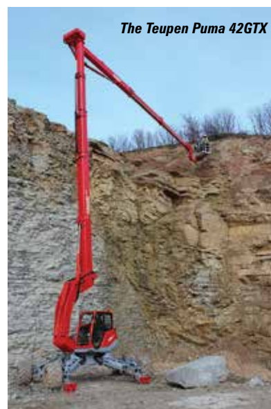
The Teupen Puma 42GTX

Maximum capacity is 400kg. It has a stowed travel speed of 10kph, can be road registered, and weighs 17.6 tonnes. Overall dimensions are 9.2 metres long, by 2.48 metres wide and three metres high. The new machine, will cost in the region of €60,000, and aimed at a wide variety of specialist applications such as remote pylon replacement. The current chassis will allow for a larger model up to 54 metres in height.