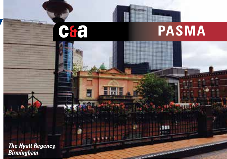
The Hyatt Regency, Birmingham