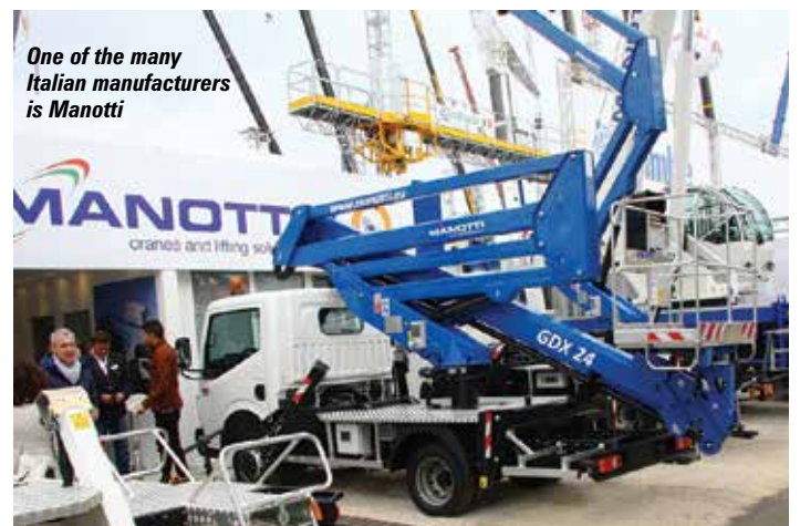
One of the many Italian manufacturers is Manotti