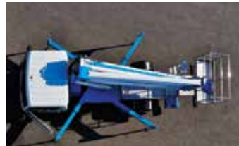
Sogace launched its 3.5 tonne E Series work platforms with X-shaped chassis and 300kg platform capacity.

Palfinger now has a substantial number of models in its Italian built Smart Class range, topped by the 28 metre P280 AXE although several are now too heavy for 3.5 tonne chassis. The range begins with a 13 metre P130A, launched at Vertikal Days last year - usually mounted on a pickup truck, such as the 4x4 Ford Ranger 2.2 TDI, with a total GVW of 3,200kg - it offers up to 6.3 metres of outreach. Other models that work well on 3.5 tonne chassis include the 14 metre P140T, the 16 metre P160TX and 17 metre P170T telescopic and the articulated P200A and P240A, all are available with different configurations creating a 12 model/variant range if the P280 is included. Palfinger also produces a range of telescopic models at its plant in Germany. Designated the Light range it includes 15, 18, 20, 21, 22 and 26 metre models all with aluminium booms and one of them - the P210BK - with a jib.