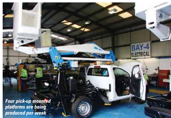
Four pick-up mounted platforms are being produced per week

mounted platform is the 20 metre Socage DA320 which has a total operational weight - ie with driver, passengers, fuel, pads and some tools - that remains road legal," says Murphy.