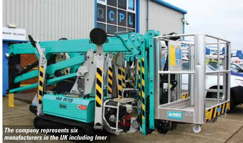
The company represents six manufacturers in the UK including Imer