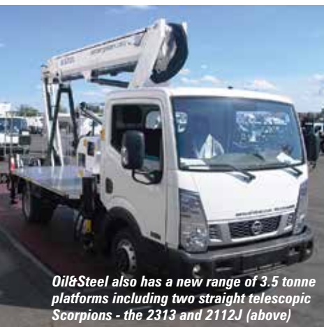
Oil&Steel also has a new range of 3.5 tonne platforms including two straight telescopic Scorpions - the 2313 and 2112J (above)

Oil&Steel also has a new range of 3.5 tonne platforms including two straight telescopic Scorpions - the 2313 and 2112J. The 22.6 metre Scorpion 2313 has a 250kg platform capacity and 12.8 metres of outreach with 100kg in the platform. The new 21 metre Scorpion 2112J has an articulated jib a 230 kg maximum capacity and 12 metres maximum outreach with 120kg. Oil&Steel, now part of Manitex, says that these new truck mounts have been designed to be compact