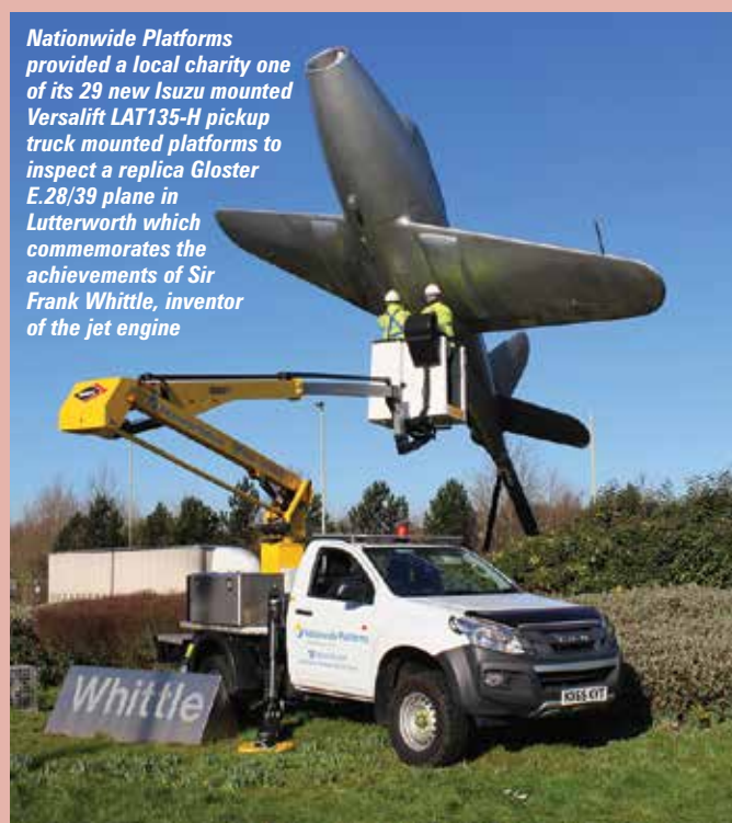
Nationwide Platforms provided a local charity one of its 29 new Isuzu mounted Versalift LAT135-H pickup truck mounted platforms to inspect a replica Gloster E.28/39 plane in Lutterworth which commemorates the achievements of Sir Frank Whittle, inventor of the jet engine

to ensure the iconic plane remains flying high."