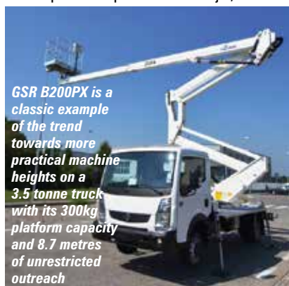
GSR B200PX is a classic example of the trend towards more practical machine heights on a 3.5 tonne truck with its 300kg platform capacity and 8.7 metres of unrestricted outreach

The Isoli range is going through a complete overhaul and update, including a new range of simple, robust competitively priced models for the rental sector and a range of higher specification machines for end users and high tech markets. The company will launch the new 19 metre PT 190J at Vertikal Days, which features a three section telescopic boom plus articulated jib,