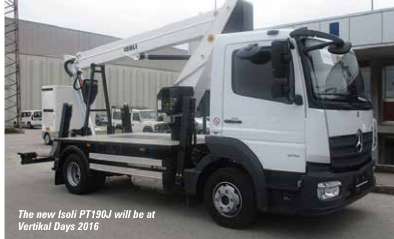
The new Isoli PT190J will be at Vertikal Days 2016