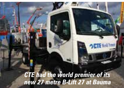
CTE had the world premier of its new 27 metre B-Lift 27 at Bauma

CTE also offers several telescopic models on 3.5 tonne chassis which is now topped by the 27 metre B-Lift 27 which had its world premier at Bauma. Full details are