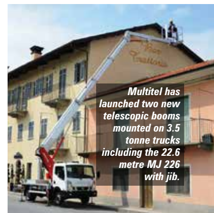
Multitel has launched two new telescopic booms mounted on 3.5 tonne trucks including the 22.6 metre MJ 226 with jib.

determining how many occupants the platform can take, although wind sail effect is another factor that must be considered. One cannot help but wonder how long 80kg will survive, as it allows nothing for tools, and an increasing number of operators weigh 80kg or more, especially when equipped with full PPE, a harness and a few tools etc.... However, the Multitel overload sensing device is fully proportional and will further restrict outreach for heavier operators or loads.