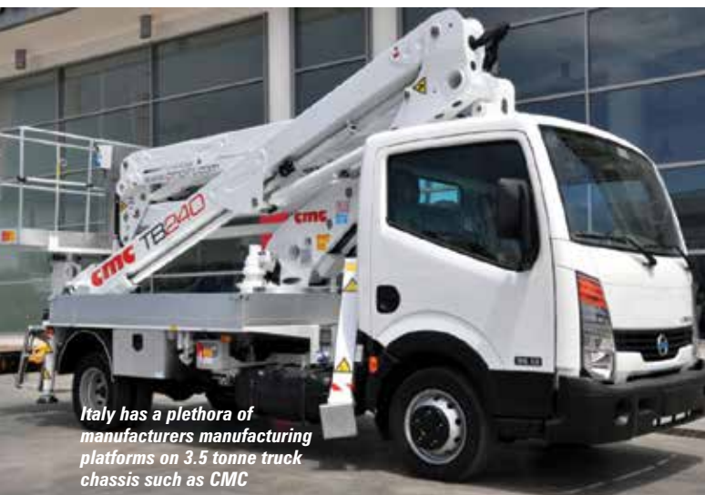
Italy has a plethora of manufacturers manufacturing platforms on 3.5 tonne truck chassis such as CMC

What is always surprising is the fact that while the Italian manufacturers dominate the market for smaller machines, they thin out dramatically when it comes to products over 30 metres. This has slowly been changing as companies such as Multitel - which has always been an exception - Socage, CTE and Oil&Steel launch new larger models and improved product support giving increased confidence.