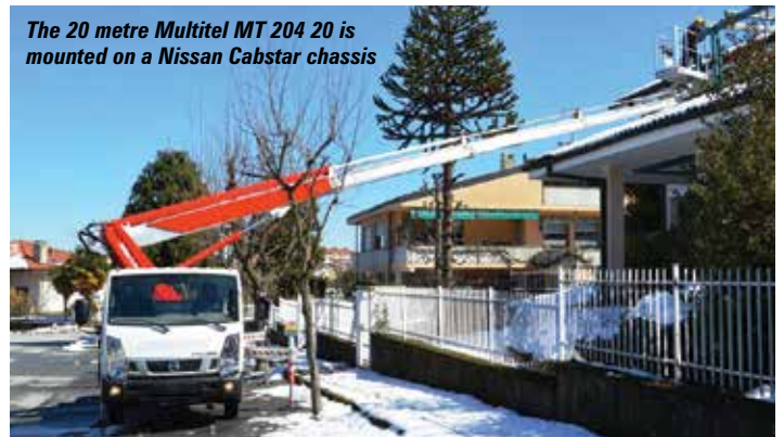
The 20 metre Multitel MT 204 20 is mounted on a Nissan Cabstar chassis

a maximum platform capacity of 250kg and direct hydraulic controls. The company says that it is simple and easy to use and service and ideal for the self-drive market. The lift can be mounted on almost any 3.5 tonne chassis, although the 3.5 tonne Nissan Cabstar is recommended - probably because it is the lightest available. The PT 190J goes into production this month, along with the new 13 metre MPT 140 articulated boom, mounted on a pick-up truck. Isoli launched two other platforms at Bauma - the 20 metre PT200J and the 23 metre PT230.