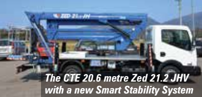
The CTE 20.6 metre Zed 21.2 JHV with a new Smart Stability System

20.6 metre Zed 21.2 JHV with a new Smart Stability System - S3 - which is available on all of its 3.5 tonne lifts. It uses a variable H-type outrigger configuration and automatically adjusts the capacity and lifting envelope to match the actual outrigger footprint.