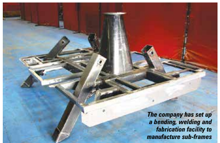
The company has set up a bending, welding and fabrication facility to manufacture sub-frames

the end product will be a CPL machine because we are the ones that build, supply and support it," says Murphy. "The customer knows exactly the equipment he is buying but our policy is to produce CPL machines. Take the 4x4, truck and van mounts for example, we manufacture the sub-frames and mount the booms - so around 60