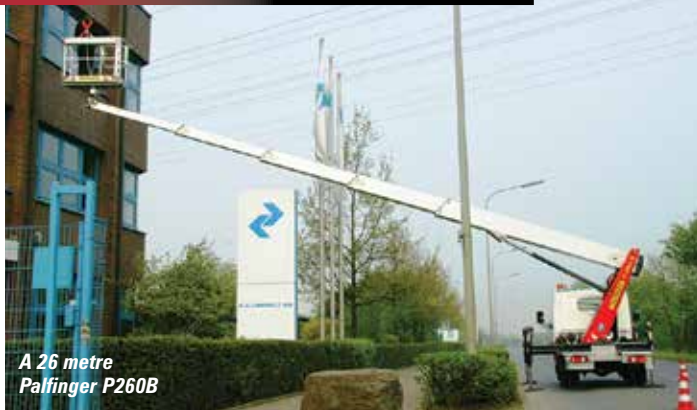
A 26 metre Palfinger P260B