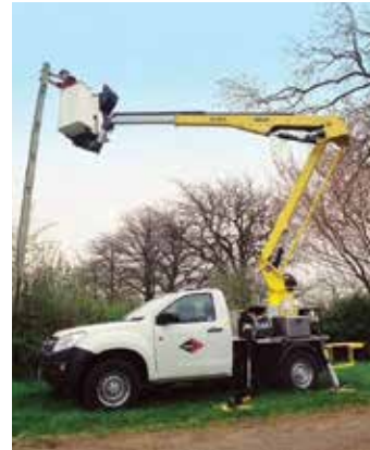
Versalift's 13.3 metre LAT135-H platform incorporates certified low voltage - 1kV AC - insulation to European LV standard VDE 0682-742

Versalift offers the light and medium ranges of platforms mounted on chassis up to 3.5 tonnes ranging from the 9.2 metre Versalift LT-23-90-TB on the VW Amarok 4x4 pick-up truck, to the 22.2 metre VTX-240 on the Nissan Cabstar. One of its latest developments is its 13.3 metre LAT135-H platform - mounted onto updated 3.5 tonne Isuzu D-Max and Toyota Hi-Lux pick-ups - which