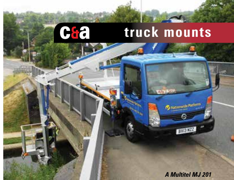
A Multitel MJ 201

platforms with the highest working heights possible for the lightweight chassis. Topping out at 28 metres, that race is long over and Ruthmann can claim to have been the overall winner, while there are a few Italian manufacturers still aiming high the average working heights are now declining as other performance criteria come to the fore - this in spite of the increased use of ultra-high strength steel resulting in lighter booms for a given height. The primary reason for using lighter booms is now to offset the growing