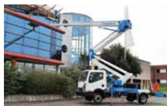
Palfinger now has a substantial number of models on 3.5 tonne chassis such as this P170T

Models in the E series include the forSte 21DJ - a 21 metre, dual sigma type riser articulated platform with jib, and the 20 metre forSte 20TJ telescopic with jib which has been created specifically for the German market, with automatic outrigger set-up, memory function controlled from the basket and automatic boom stow functions. At the top end of the range is the 28 metre forSte 28D, a dual riser articulated platform with 14.5 metres of outreach. This new