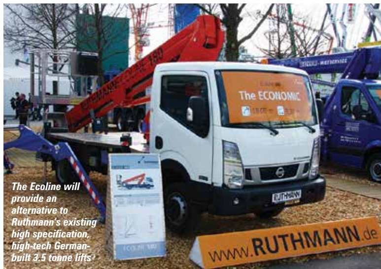
The Ecoline will provide an alternative to Ruthmann's existing high specification, high-tech German-built 3.5 tonne lifts

spiders and RAM truck mounted platforms - is intended to provide a new line of cost-effective 3.5 tonne platforms. The Ecoline range will include a range of telescopics to 18 metres and articulating boom models up to 20 metres providing an alternative to Ruthmann's existing high specification, high-tech German-built 3.5 tonne lifts, which include four machines topped by the 27 metre TB270+. Launched six years ago the TB 270 has sold well with the 650th unit delivered last year to French rental company Kiloutou.