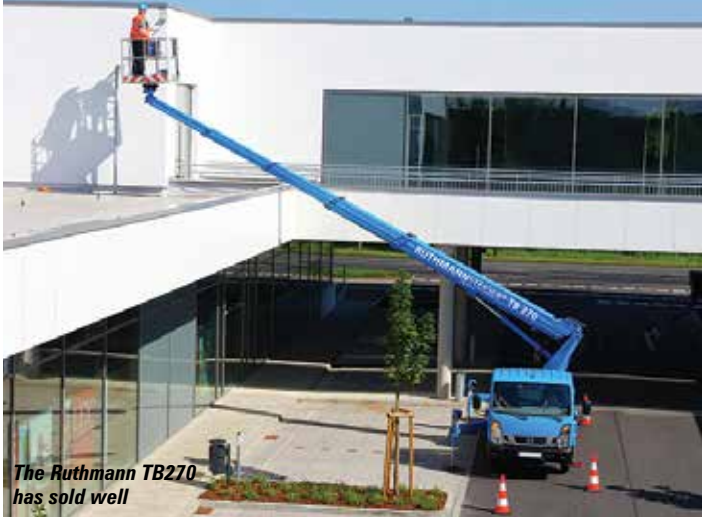
The Ruthmann TB270 has sold well

100kg capacity - almost two metres more than the machine it replaces.