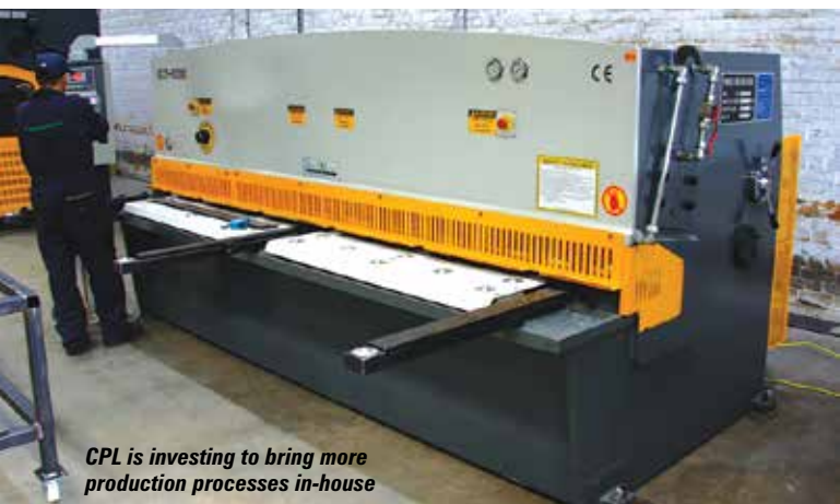
CPL is investing to bring more production processes in-house

Iteco/Imer, Easy Lift, MultiOne and its most recent addition Klubb van mounts. Revenues this year look to be up around 45 percent to £8 million and it now employs 42. To keep up with the rate of growth it extended its facilities last year, adding two more service bays - but has had to purchase two more even larger facilities - around 3,000 square metres in total - nearby primarily to cope, but also to bring some production processes in-house