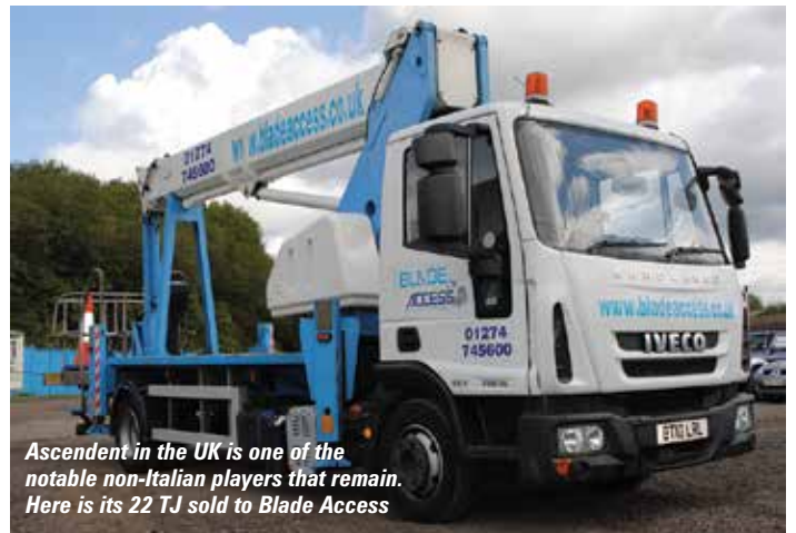
Ascendent in the UK is one of the notable non-Italian players that remain. Here is its 22 TJ sold to Blade Access

With the two big German companies joining the Italians, the number of other manufacturers in this sector is further diminished. Time Versalift in the UK and Denmark, Ascendent in the UK, and France Elevateur in France are some of the notable non-Italian players that remain although there are a few murmurs from the East. Earlier this year Poland's Beckmann Volmer