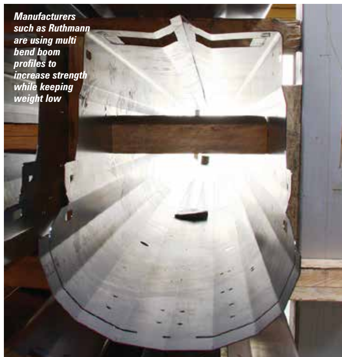
Manufacturers such as Ruthmann are using multi bend boom profiles to increase strength while keeping weight low

At the bottom end of the working height range, the final demise of the Land Rover Defender has accelerated the shift to alternative compact 4x4 chassis with the Isuzu D-Max and Toyota Hi-Lux pick-up trucks leading the way. These small 4x4 platforms are becoming increasingly popular with utility companies, arborists and anyone else needing to go off-road to reach their work.