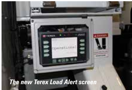
The new Terex Load Alert screen

The new system monitors the actual loads on the jib, in the platform or on the winch line, as well as the winch line's distance from the platform's pivot point and boom positions. Buyers can also opt to receive wireless notifications via text or email of any overload events, so that the equipment can be monitored and managed from a distance.