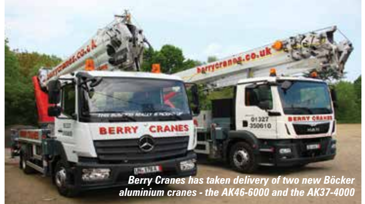
Berry Cranes has taken delivery of two new Böcker aluminium cranes - the AK46-6000 and the AK37-4000

The agreement, which will see the formation of Ascotel Middle East, will sell and distribute Ascotel products throughout the Middle East and North Africa. It is expected to be operational by August and will be based at KBW Investments headquarters in Dubai.