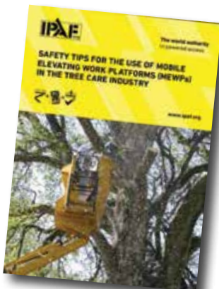
The safety guidance can be downloaded free of charge

The guidance can be downloaded from the Publications/Technical Guidance section on www.ipaf.org .