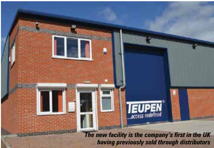
The new facility is the company's first in the UK having previously sold through distributors