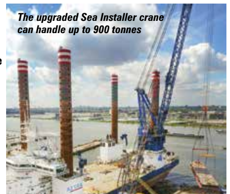
The upgraded Sea Installer crane can handle up to 900 tonnes