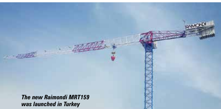
The new Raimondi MRT159 was launched in Turkey