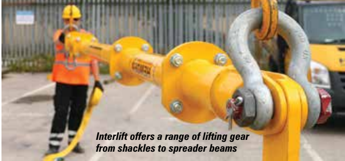
Interlift offers a range of lifting gear from shackles to spreader beams