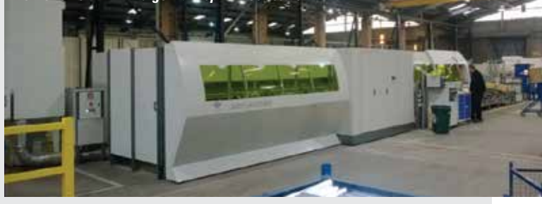
Werner's new BLM Adige fibre optic laser cutter

The company has also added 2,300 square metres of additional warehousing and dedicated extrusion store and opened a new National Distribution Centre in Burton Upon Trent.