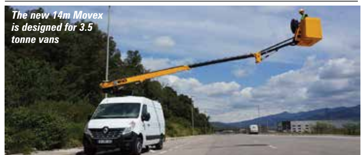
The new 14m Movex is designed for 3.5 tonne vans