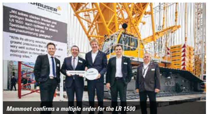
Mammoet confirms a multiple order for the LR 1500