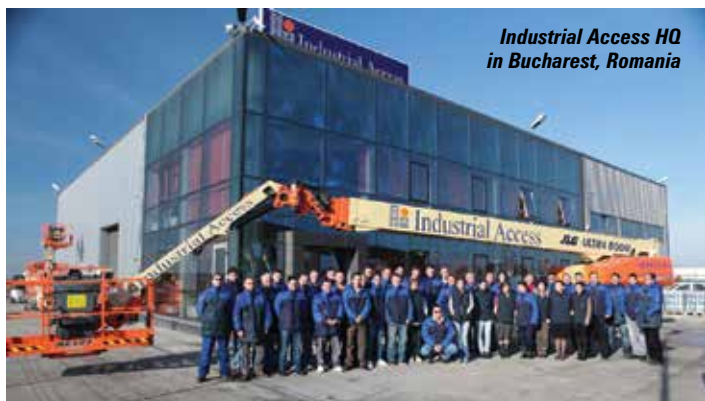
Industrial Access HQ in Bucharest, Romania

Founded by Ponea in 2005, the Balkan Accession Fund bought into the business in 2007 and has been looking to realise its investment. TVH is already established in Romania, having acquired access rental company Romlift in 2013. The transaction is conditional upon obtaining the approval from the Romanian Competition Council. It is expected to close within three to four months.