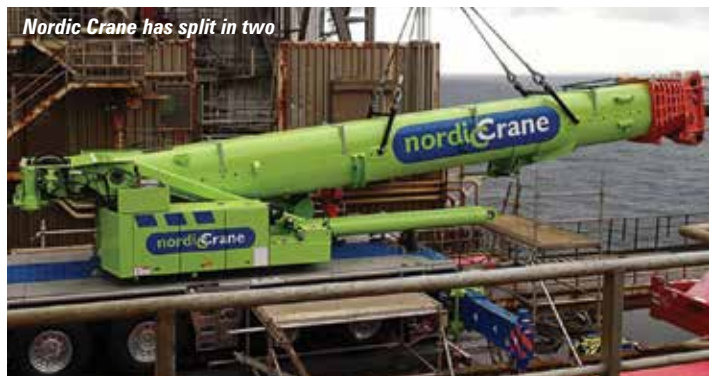
Nordic Crane has split in two

The two owners issued a joint statement saying: "Despite strong growth, synergies have not worked out the way we wanted. Geographical distances prevented the Nordic Crane Group from utilising its resources efficiently enough."