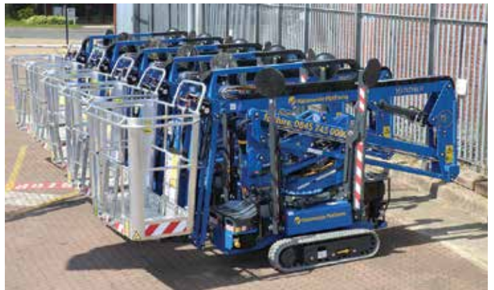
Some of the new Hinowa spider lifts joining the Nationwide fleet.

Palfinger says that there is only a marginal overlapping of products and services between TTS and Palfinger Marine and would make Palfinger one of the top three players in the market.