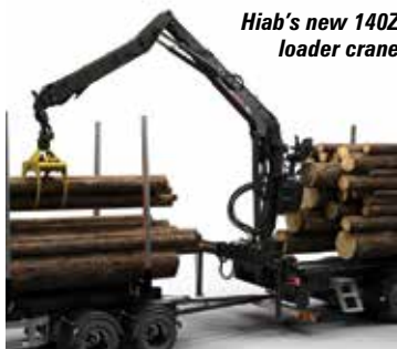
Hiab's new 140Z loader crane

The new cranes have load moments of 14 and 15 tonne/metre respectively and feature hydraulic pilot controls, Hiab's SafetyPlus system with external display providing full crane performance data, hose link guard protection to deflect tree limb impacts, while allowing fast changing of any damaged hoses and special 'nDurance' paint protection.