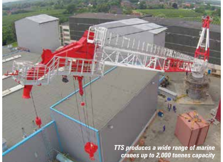
TTS produces a wide range of marine cranes up to 2,000 tonnes capacity