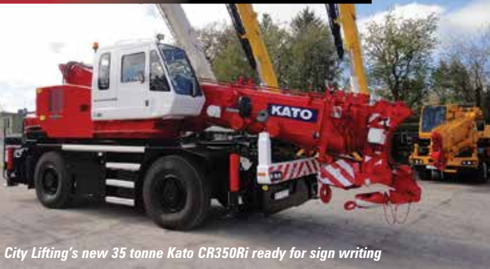
City Lifting's new 35 tonne Kato CR350Ri ready for sign writing