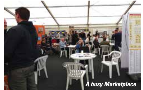
A busy Marketplace