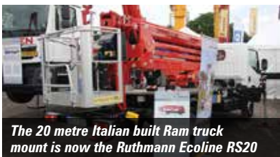
The 20 metre Italian built Ram truck mount is now the Ruthmann Ecoline RS20