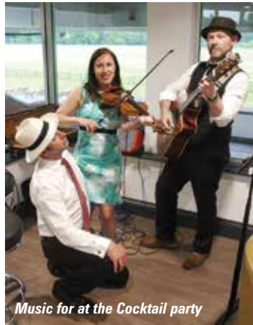
Music for at the Cocktail party