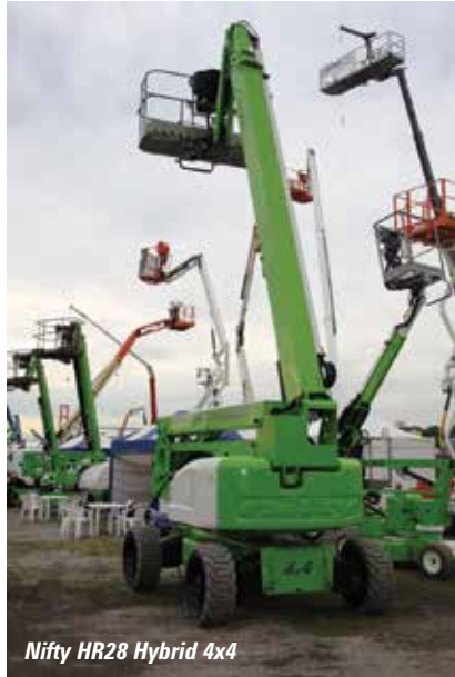
Nifty HR28 Hybrid 4x4