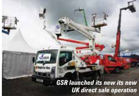
GSR launched its new UK direct sale operation