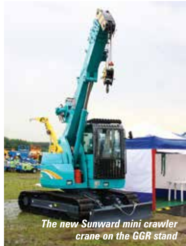
The new Sunward mini crawler crane on the GGR stand