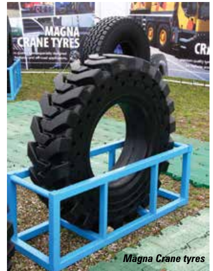
Magna Crane tyres