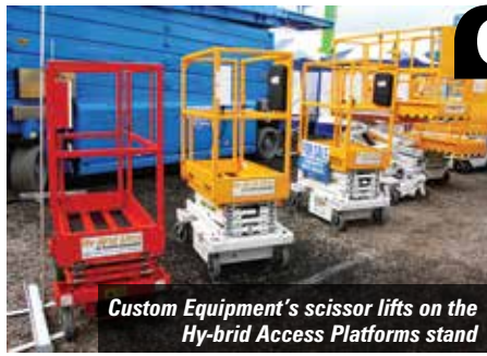
Custom Equipment's scissor lifts on the Hybrid Access Platforms stand