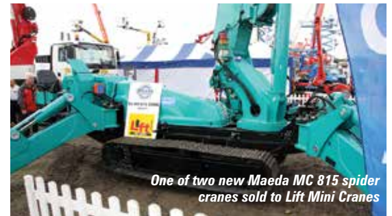
One of two new Maeda MC 815 spider cranes sold to Lift Mini Cranes