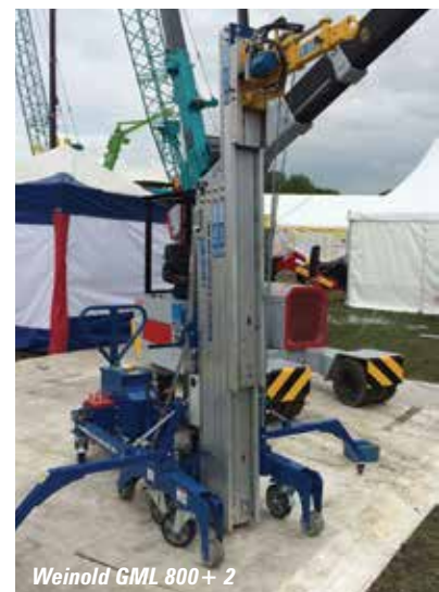
Weinold GML 800+2