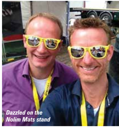
Dazzled on the Nolim Mats stand