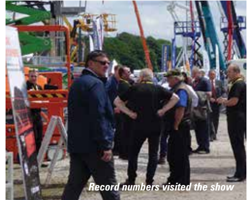
Record numbers visited the show