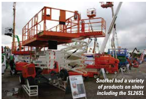
Snorkel had a variety of products on show including the SL26SL