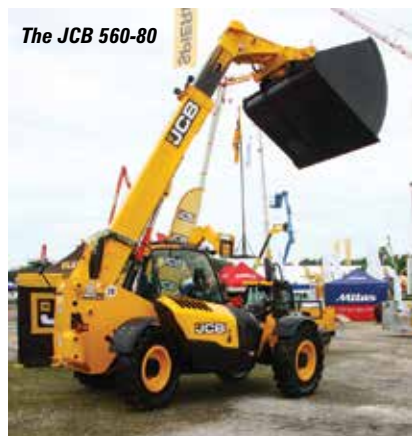
The JCB 560-80