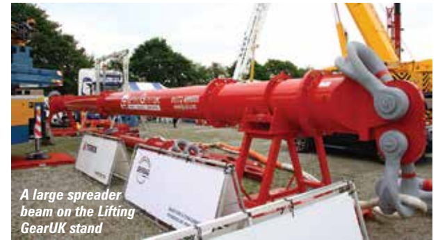
A large spreader beam on the Lifting GearUK stand