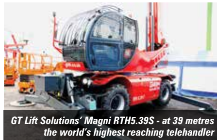
GT Lift Solutions' Magni RTH5.39S - at 39 metres the world's highest reaching telehandler