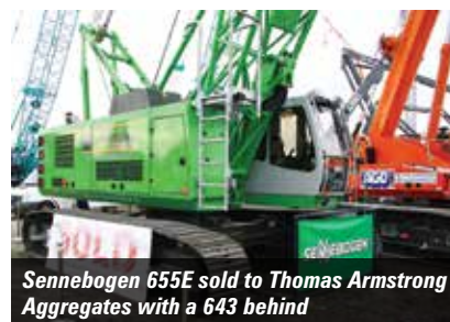
Sennebogen 655E sold to Thomas Armstrong Aggregates with a 643 behind