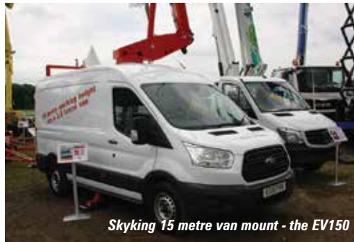
Skyking 15 metre van mount - the EV150