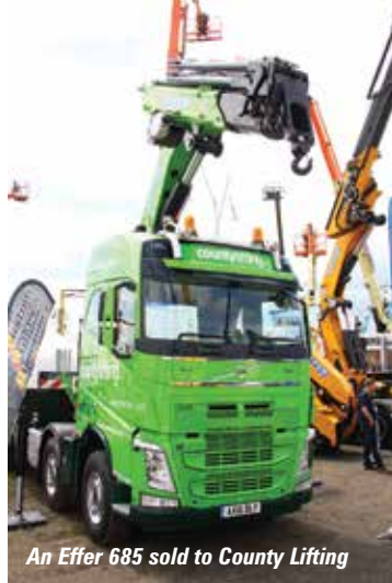
An Effer 685 sold to County Lifting