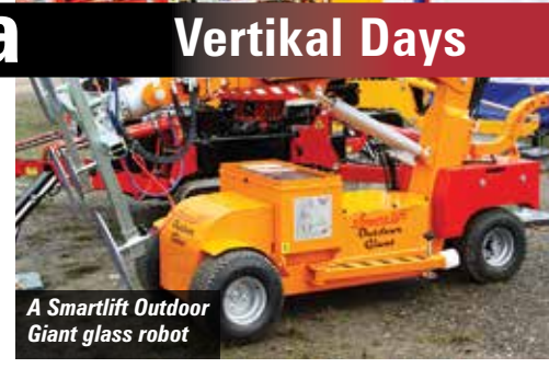
A Smartlift Outdoor Giant glass robot