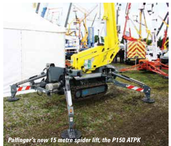
Palfinger's new 15 metre spider lift, the P150 ATPK