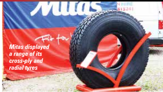
Mitas displayed a range of its cross-ply and radial tyres