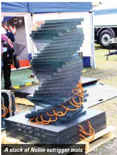
A stack of Nolim outrigger mats