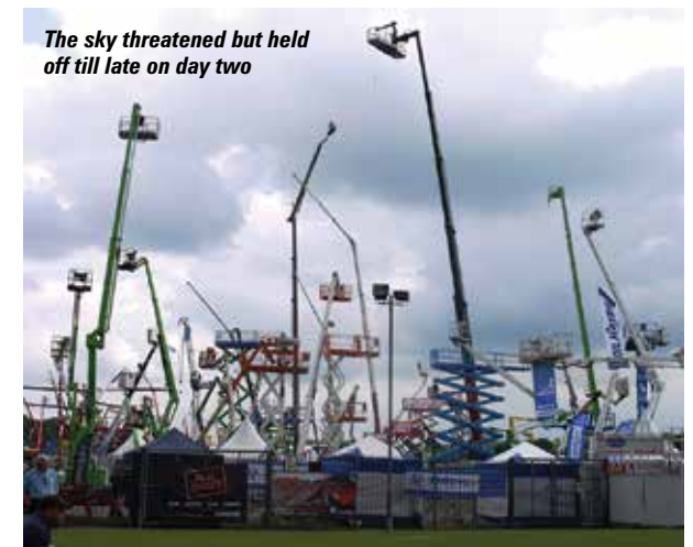
The sky threatened but held off till late on day two