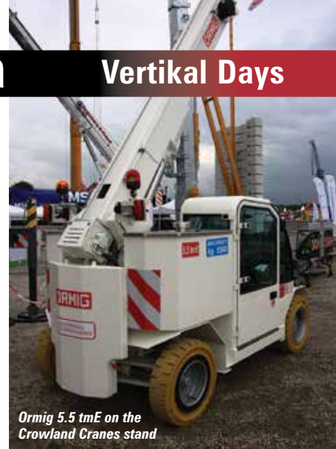
Ormig 5.5 tM E on the Crowland Cranes stand