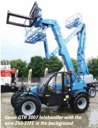
Genie GTH 3007 telehandler with the new Z60-37FE in the background