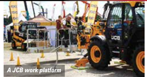
A JCB work platform