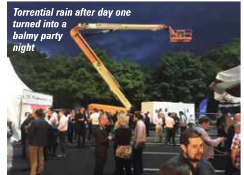
Torrential rain after day one turned into a balmy party night