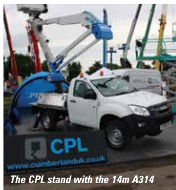
The CPL stand with the 14m A314