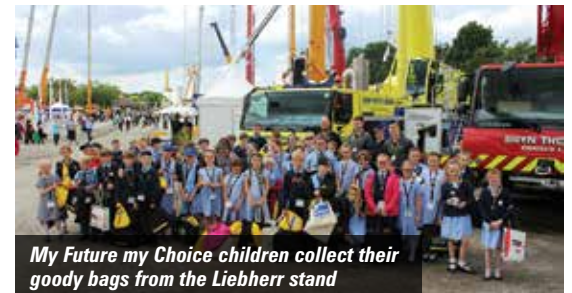
My Future my Choice children collect their goody bags from the Liebherr stand