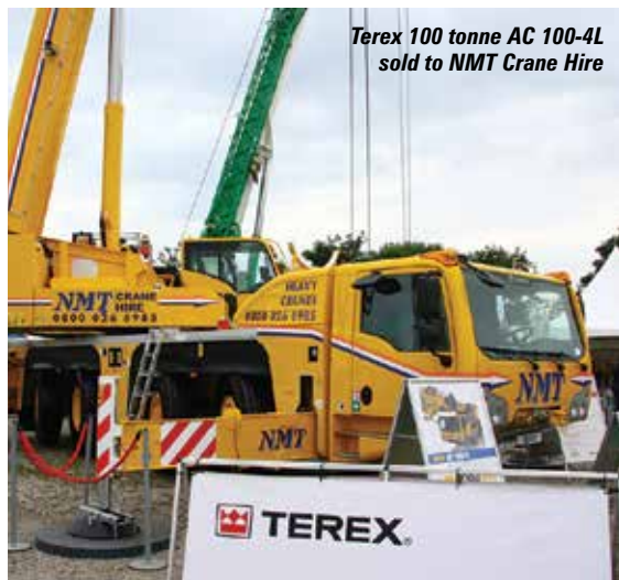
Terex 100 tonne AC 100-4L sold to NMT Crane Hire