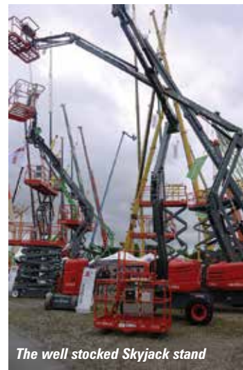
The well stocked Skyjack stand