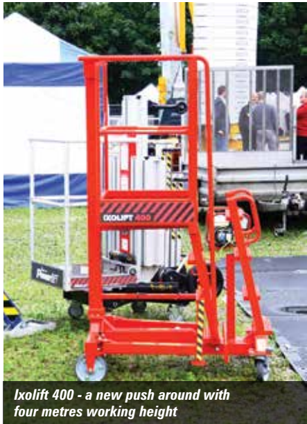
Ixolift 400 - a new push around with four metres working height