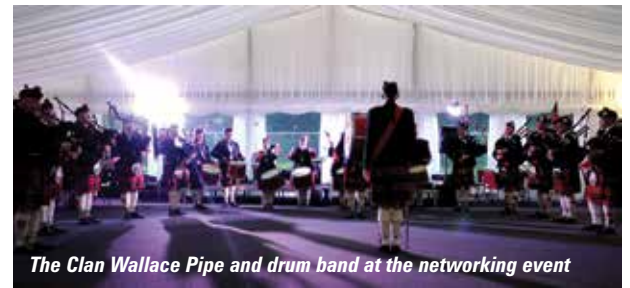
The Clan Wallace Pipe and drum band at the networking event