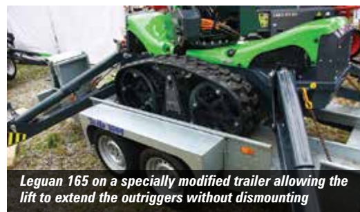
Leguan 165 on a specially modified trailer allowing the lift to extend the outriggers without dismounting