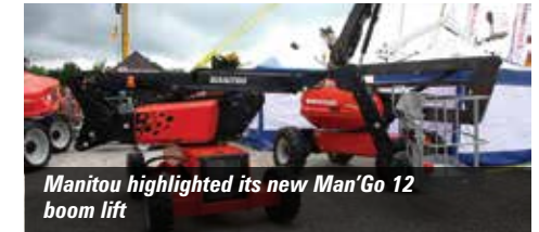
Manitou highlighted its new Man'Go 12 boom lift