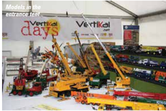
Models in the entrance tent