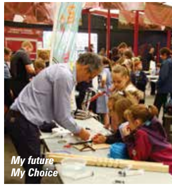
My future My Choice