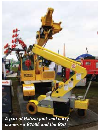
A pair of Galizia pick and carry cranes - a G150E and the G20