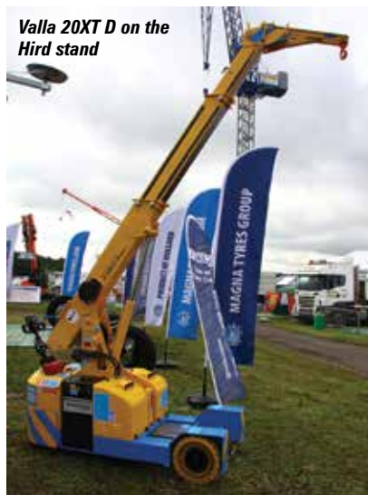
Valla 20XT D on the Hird stand