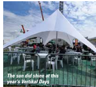
The sun did shine at this year's Vertikal Days