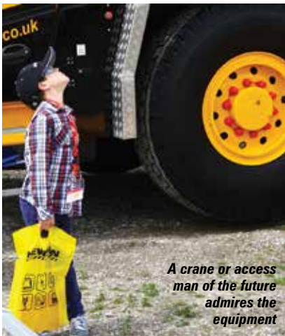
A crane or access man of the future admires the equipment