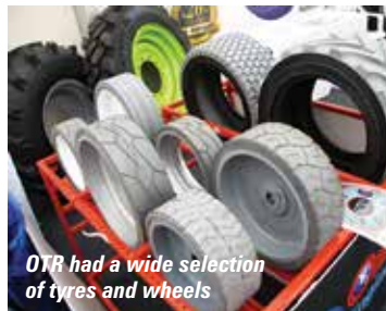
OTR had a wide selection of tyres and wheels