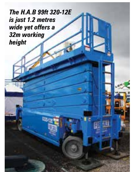
The H.A.B 99ft 320-12E is just 1.2 metres wide yet offers a 32m working height