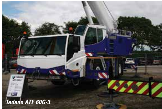
Tadano ATF 60G-3