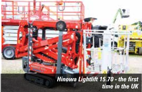
Hinowa Lightlift 15.70 - the first time in the UK