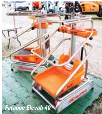
Faraone Elevah 40