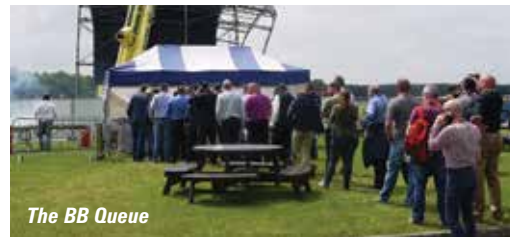
The BB Queue