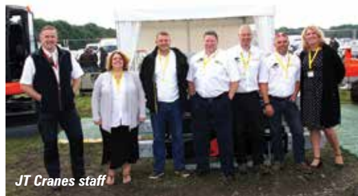
JT Cranes staff