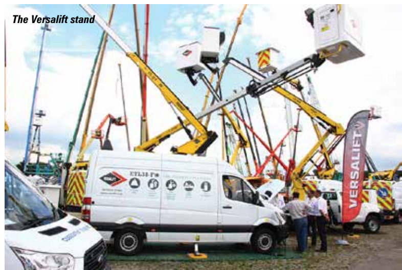
The Versalift stand