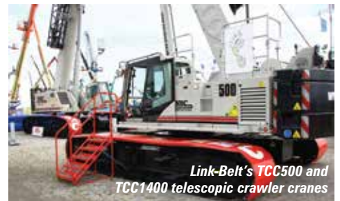
Link-Belt's TCC500 and TCC1400 telescopic crawler cranes