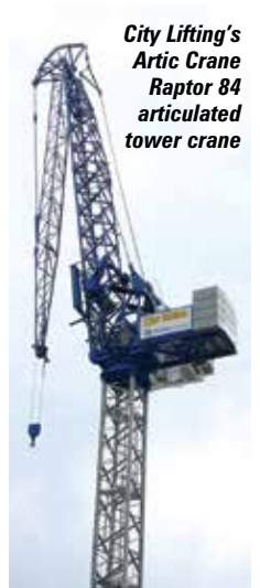
City Lifting's Artic Crane Raptor 84 articulated tower crane