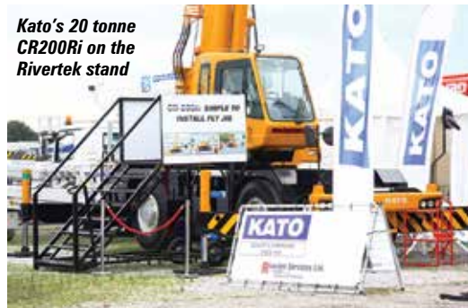
Kato's 20 tonne CR200Ri on the Rivertek stand