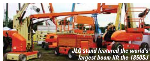
JLG stand featured the world's largest boom lift the 1850SJ