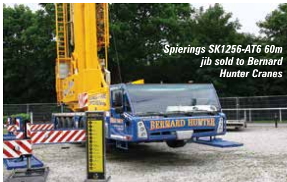
Spierings SK1256-AT6 60m jib sold to Bernard Hunter Cranes