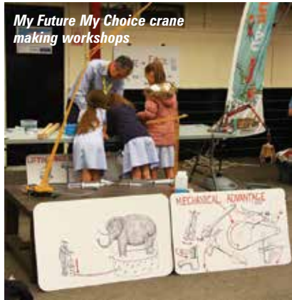
My Future My Choice crane making workshops