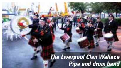
The Liverpool Clan Wallace Pipe and drum band