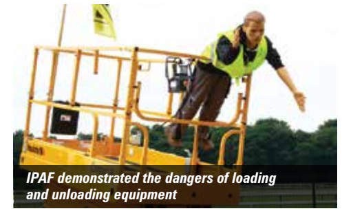
IPAF demonstrated the dangers of loading and unloading equipment