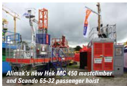
Alimak's new Hek MC 450 mastclimber and Scando 65-32 passenger hoist