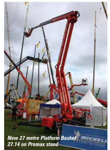
New 27 metre Platform Basket 27.14 on Promax stand