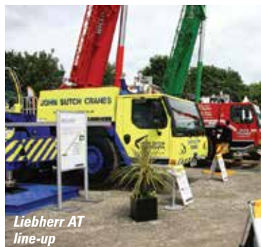
Liebherr AT line-up