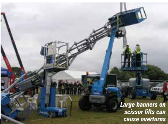
Large banners on scissor lifts can cause overturns