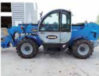
GENIE GTH 3512