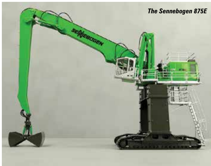
The Sennebogen 875E

To read the full review of this model visit www.cranesetc.co.uk