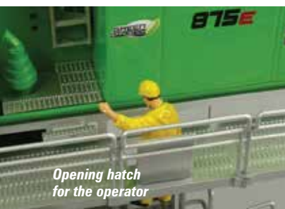
Opening hatch for the operator