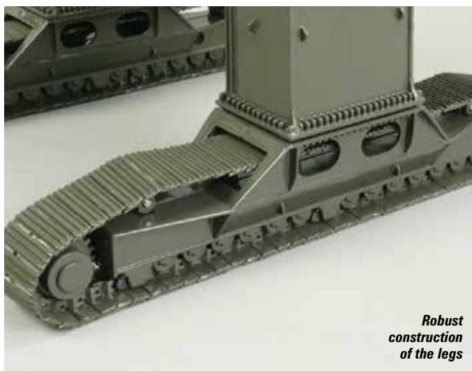
Robust construction of the legs