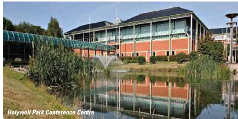
Holywell Park Conference Centre