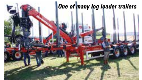
One of many log loader trailers