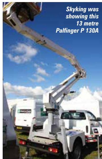
Skyking was showing this 13 metre Palfinger P 130A