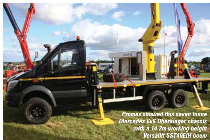
Promax showed this seven tonne Mercedes 6x6 Oberainger chassis with a 14.2m working height Versalift SST40EIH boom

Attitudes towards the use of powered access in the arb sector has changed substantially over the past decade. 10 years ago most young arborists enjoyed the industry's macho outdoor image which did not include making life easier and safer by using a platform. Only the more senior arborists, or those unable to climb accepted powered access equipment. Over the years, the realisation of the dangers, combined with the difficulty of climbing throughout an increasingly long career - particularly with an injury - has