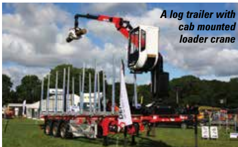
A log trailer with cab mounted loader crane