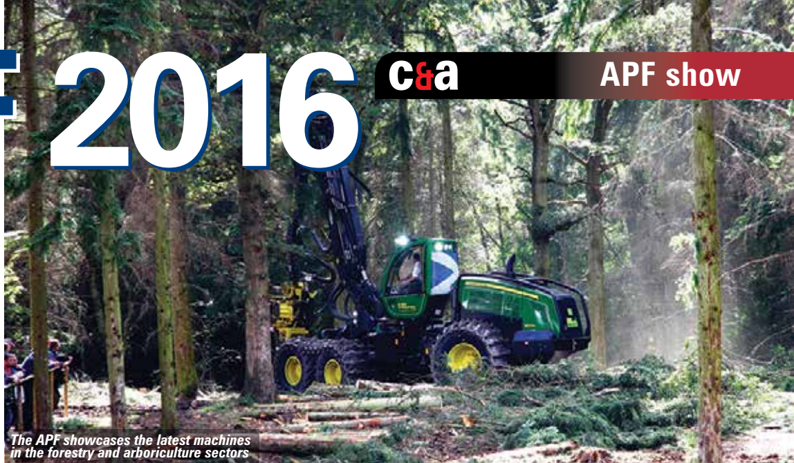
The APF showcases the latest machines in the forestry and arboriculture sectors

The increase in the use of platforms should, and almost certainly has, improved safety but there is still a lack of industry experience, training and guidance. With this in mind, IPAF recently issued a free guide targeting the industry, with safety tips for tree arborists using platforms. It highlights the correct procedures and checks before, during and after carrying out the work and highlights the importance of using mats under outriggers, taking precautions to protect the operator from the chainsaw perhaps using an approved platform divider, the need to cut trees so that the branches fall