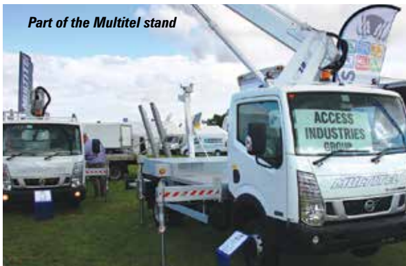
Part of the Multitel stand