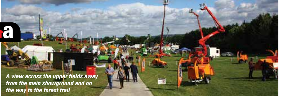
A view across the upper fields away from the main showground and on the way to the forest trail