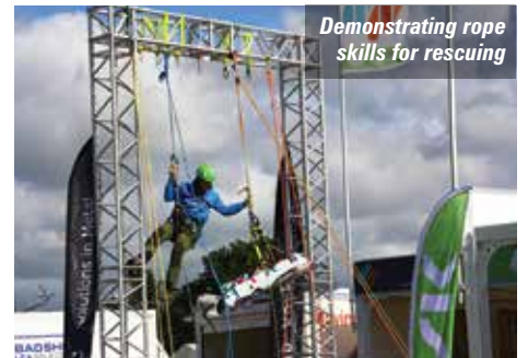
Demonstrating rope skills for rescuing