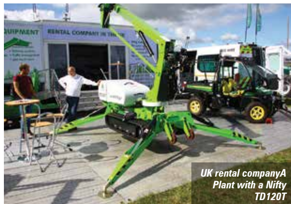
UK rental company A Plant with a Nifty TD120T