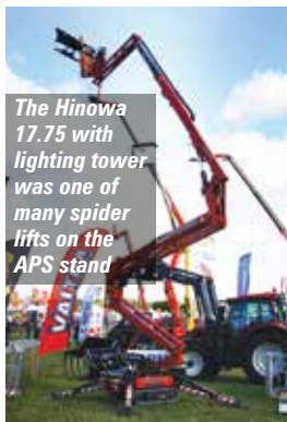
The Hinowa 17.75 with lighting tower was one of many spider lifts on the APS stand