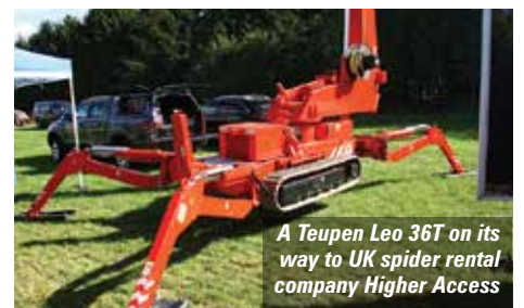
A Teupen Leo 36T on its way to UK spider rental company Higher Access