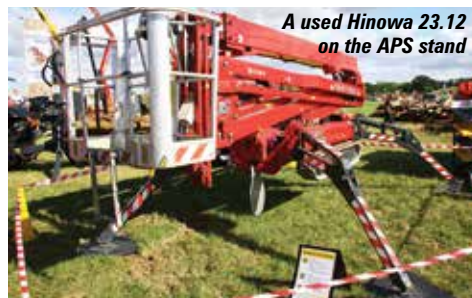
A used Hinowa 23.12 on the APS stand