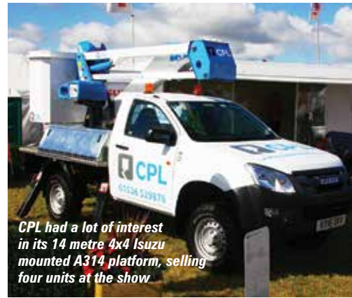
CPL had a lot of interest in its 14 metre 4x4 Isuzu mounted A314 platform, selling four units at the show

On the stand was a Leo 36T and the first of two 42 metre Puma 42GTX to be delivered. Launched at Bauma the Puma combines an aerial lift with the chassis of a walking excavator. Both units will be delivered this year with more units scheduled next year and 2018.