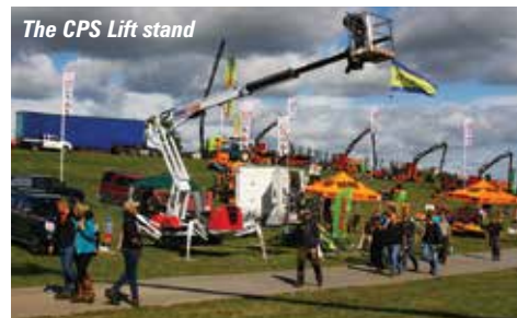
The CPS Lift stand