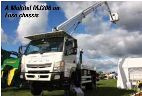
A Multitel MJ206 on Fuso chassis