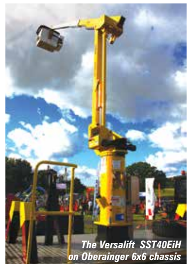
The Versalift SST40EiH on Oberainger 6x6 chassis