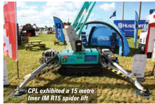
CPL exhibited a 15 metre Imer IM R15 spider lift

The following photos will hopefully give you a taste of the rest of the show.