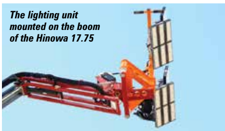
The lighting unit mounted on the boom of the Hinowa 17.75