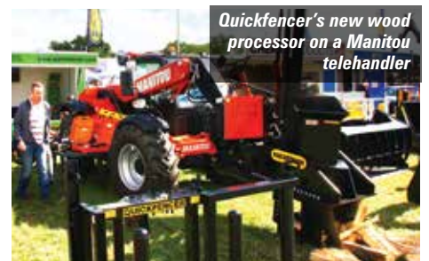
Quickfencer's new wood processor on a Manitou telehandler