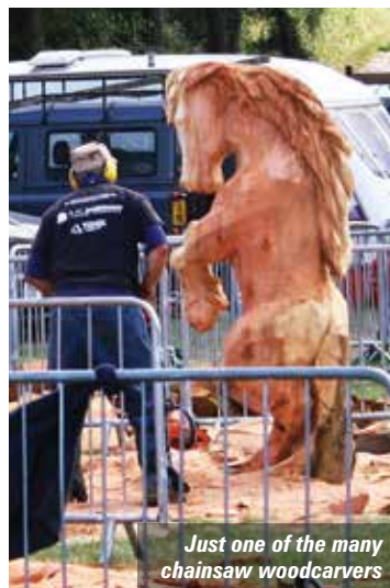
Just one of the many chainsaw woodcarvers