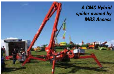
A CMC Hybrid spider owned by MBS Access