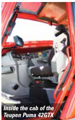
Inside the cab of the Teupen Puma 42GTX