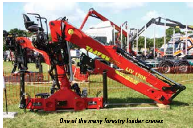
One of the many forestry loader cranes