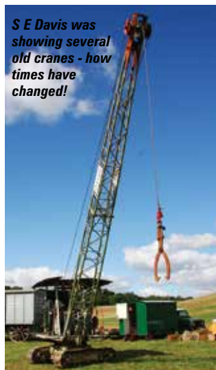
S E Davis was showing several old cranes - how times have changed!