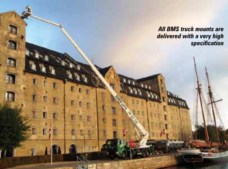
All BMS truck mounts are delivered with a very high specification