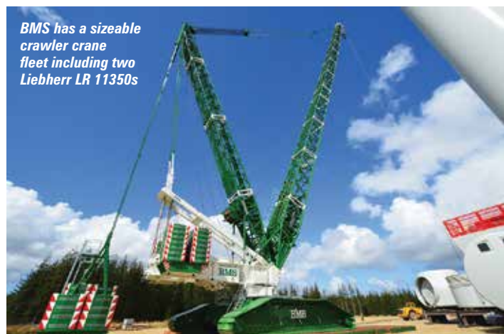
BMS has a sizeable crawler crane fleet including two Liebherr LR 11350s

Today BMS has 10 subsidiaries, including Kranexpressen, City Cranes and Torben Rafn in Denmark, BMS Kranar in Sweden, Kranringen and BMS Lifter in Norway, BMS Kran in Poland, BMS Krane in Germany, BMS Lifting in the UK and