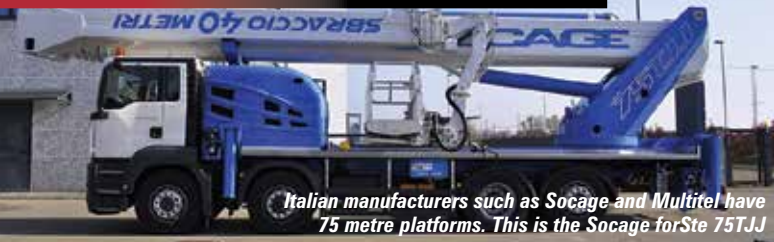
Italian manufacturers such as Sogage and Multitel have 75 metre platforms. This is the Sogage forSte 75TJJ

Ruthmann, Bronto and Palfinger, while Italian companies such as Sogage and Multitel also have machines in this sector.