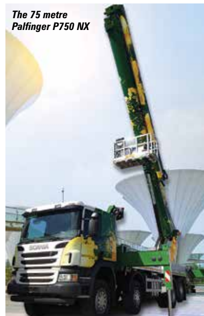
The 75 metre Palfinger P750 NX

free upgrade has been offered all those customers who have already purchased a P550 to convert to the P570. The unit can also be mounted on a four axle chassis with additional counterweight for improved working envelope and more spare payload.