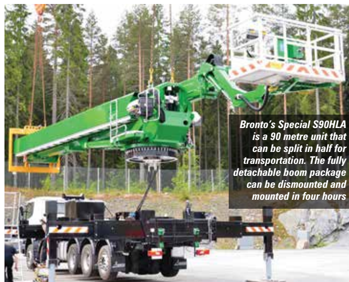
Bronto's Special S90HLA is a 90 metre unit that can be split in half for transportation. The fully detachable boom package can be dismantled and mounted in four hours

free upgrade has been offered all those customers who have already purchased a P550 to convert to the P570. The unit can also be mounted on a four axle chassis with additional counterweight for improved working envelope and more spare payload.