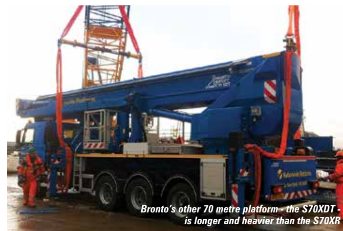
Bronto's other 70 metre platform - the S70XDT - is longer and heavier than the S70XR