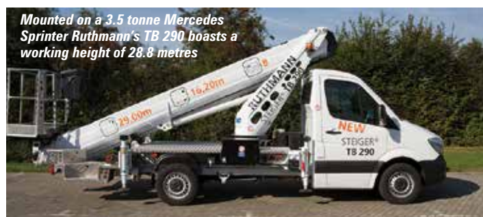
Mounted on a 3.5 tonne Mercedes Sprinter Ruthmann's TB 290 boasts a working height of 28.8 metres

In October Ruthmann unveiled several new products including the 3.5 tonne record breaking TB 290. An upgrade of the TB 270+, it boasts a working height of 28.8 metres - although on the original Mercedes Sprinter Euro 6 chassis platform capacity at full height was limited to 200kg. However, the company has recently announced the possibility to mount the TB 290 on the Nissan Cabstar chassis which allows the full 230kg capacity at full height. It expects to extend this capability to the Mercedes. Maximum outreach with 100kg platform capacity is 16.2 metres over the rear, or 13 metres over the side. Outreach with its maximum 230kg capacity is limited to 9.8 metres over the side and 13 metres over the rear.