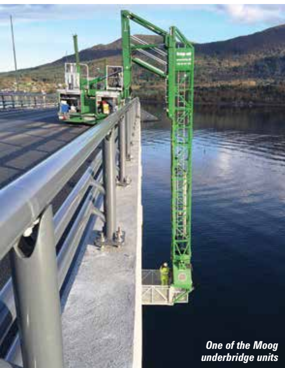
One of the Moog underbridge units

"The new lift is able to operate at up to 20.8 metres per second which is a big benefit to customers such as telecommunication companies when the network breaks down and there's a need for emergency repairs or error recovery. Weather still has a significant impact on the equipment - the