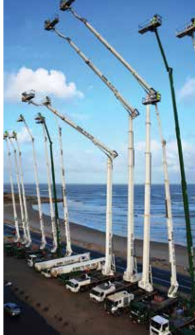
BMS has 35 truck mounted lifts from 45 to 103 metres.