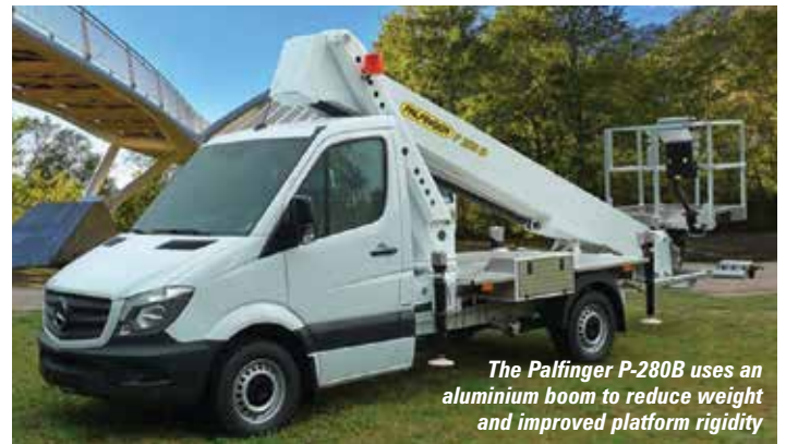
The Palfinger P-280B uses an aluminium boom to reduce weight and improved platform rigidity

area. The market above that appears to have stagnated in terms of development - or has it? For many years now the maximum working height of a truck mounted platform has been stuck at 112 metres. But with the growing height of wind turbines and a reduced willingness to use man baskets on cranes, there appears to be a growing demand for platforms with significantly greater working heights - possibly up to 150 metres! To achieve this sort of working height however requires a