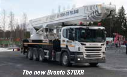
The new Bronto S70XR

occasional use at maximum height/outreach covering more eventualities by opting for a larger platform than necessary and means that the end user has some additional capability in his 'back pocket'.