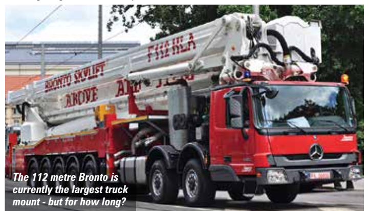
The 112 metre Bronto is currently the largest truck mount - but for how long?

Currently the hottest sector is the 70 to 75 metre working height, with several manufacturers having launched new models, including