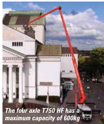
The four axle T750 HF has a maximum capacity of 600kg

Earlier in the year Ruthmann launched its T510 HF which offers