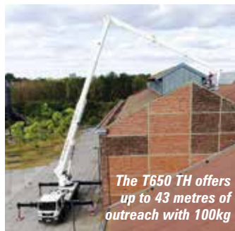
The T650 TH offers up to 43 metres of outreach with 100kg

the highest working height - 51 metres - on a two axle truck. The unit which is proving highly popular has a maximum outreach of 33 metres with reduced capacity over each of the outrigger jacks. It also launched the 57 metre T570 HF mounted on a 26 tonne three axle chassis with 41 metres of outreach.