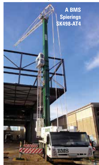
A BMS Spierings SK498-AT4