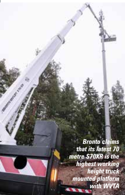
Bronto claims that its latest 70 metre S70XR is the highest working height truck mounted platform with WVTA

Bronto says that when it looked at a new product in this sector it focused on getting the best performance it could on a 32 tonne/12 metre truck, and thus sacrificed some height and outreach performance.