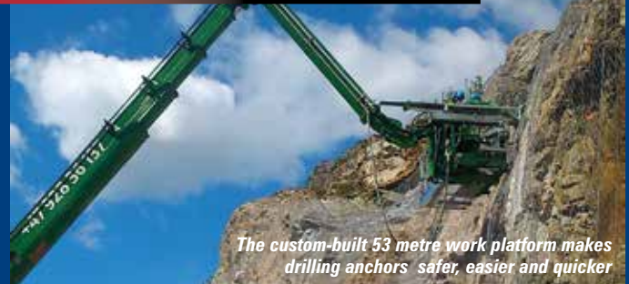
The custom-built 53 metre work platform makes drilling anchors safer, easier and quicker