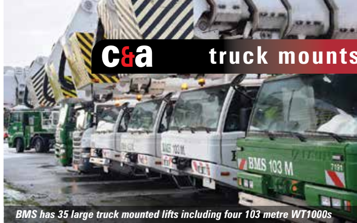
BMS has 35 large truck mounted lifts including four 103 metre WT1000s

BMS Heavy Cranes in South Africa. The main activities focus on lifting and access for the construction and industrial clients, including specialist bridge jacking and skidding, and handling TBM machines on tunnel projects. Its range of equipment also enables it to work on a wide range of projects from refinery shut-downs, to the moving and installation of transformers and all things wind turbine related, including service and maintenance. One area of the company that has grown significantly over the past five years is its truck mounted