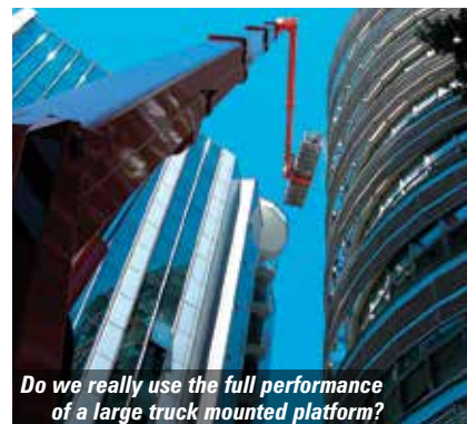
Do we really use the full performance of a large truck mounted platform?

The problem with information such as this is that it is never a simple decision when buying a large truck mount. Many customers buy machines to cope with the