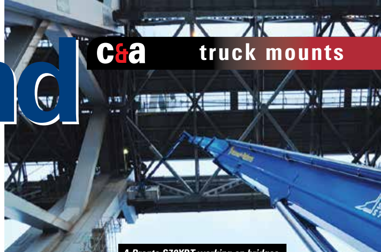
A Bronto S70XDT working on bridges over the Firth of Forth

The large truck mounted platform market has also been very active, particularly in the 70 to 75 metre