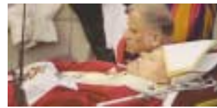
Pope John Paul dies. April