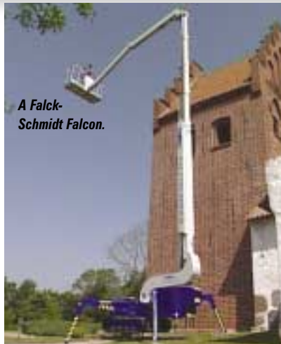
A Falck-Schmidt Falcon.

Manitowoc announced an extension to its OEM supply agreement with Kobelco to Europe and Africa. March