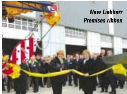
New Liebherr Premises ribbon