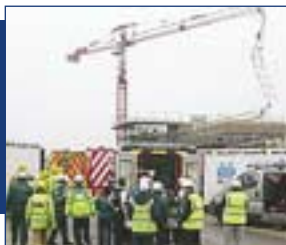
A tower crane collapsed killing two employees

A tower crane collapsed at Durrington High School in Worthing, West Sussex, hitting another, and killing two tower crane erectors as school children looked on. Feb