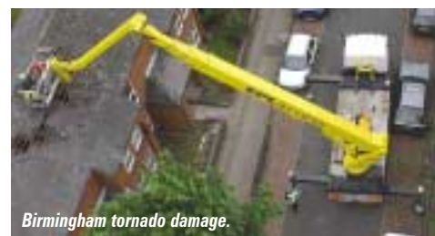
Birmingham tornado damage.

A freak tornado with winds of up to 136 Miles an hour struck Birmingham, causing significant structural damage. Aug