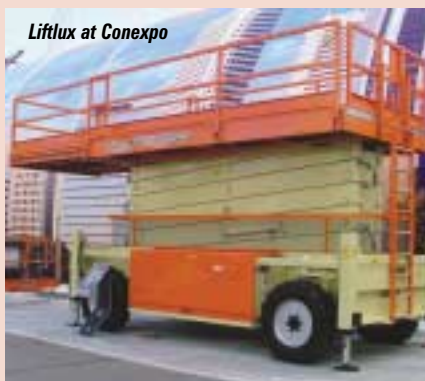
Liftlux at Conexpo

JLG announced the launch of JLG-Liftlux, with its first showing at Conexpo in March.