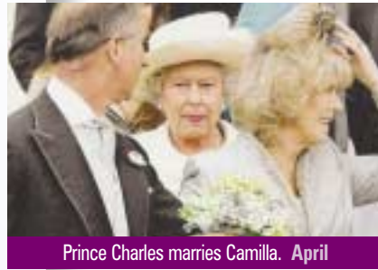
Prince Charles marries Camilla. April

The Temporary Work at Height Directive came into UK law on April 6th as the Work at Height Regulations. The old Two metre rule becomes a thing of the past. April