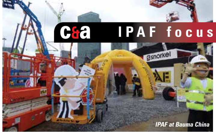
IPAF at Bauma China