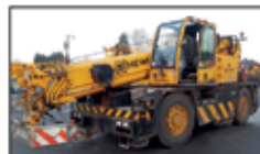
2002-04 Terex Demag AC30 30 Ton City - choice of 11