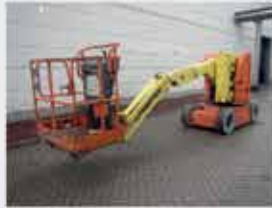
V20461 - JLG E300AJ - 2005 Electric - 11,14 Mtr. - 1292 Hrs. € 12.500