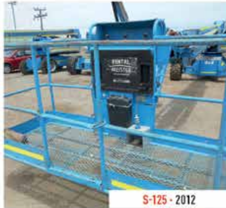
S-125 · 2012