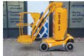
HAULOTTE - STAR 10 Vertical mast lifts

Electric, 10.0m Working Height, 2012 | PHM-Id 08786