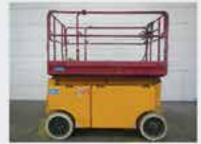
V20404 - Iteco IT12151 - 2007 Electric - 13,9 Mtr. - 750 Hrs. € 8.950