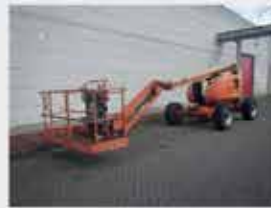
V19157 - JLG 600AJ - 2011 Diesel 4x4 - 20,29 Mtr. - 2343 Hrs. € 39.500