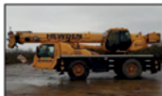
2006-08 Terex Demag AC35L 35 Ton All Terrain - choice of 12