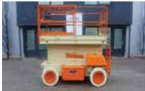
JLG - 3969E Scissor lifts

Through our long established network of suppliers and by focusing on the purchasing of larger packages of equipment, we always have a diverse inventory of quality used stock on offer.