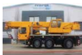
GROVE - GMK3050 Telescopic Cranes

50t, 6x6x6, Central Lubrication 38m Boom, 8.7m Jib, 2002 | PHM-Id 08716