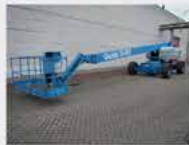
J19153 - Genie S85 - 2007 Diesel 4x4 - 27,9 Mtr. - 1737 Hrs. € 49.500