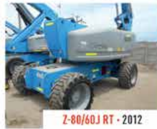
Z-80/60J RT · 2012