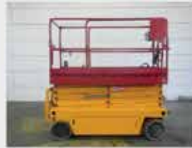
V20413 - Iteco IT10090 - 2007 Electric - 12,02 Mtr. - 561 Hrs. € 5.500