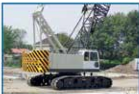
SCX900 90t 2008