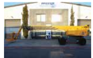
HAULOTTE - H43TPX Boom lifts

Diesel, 42.0m Working Height, 2013 | PHM-Id 08420