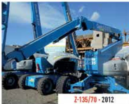
Z-135/70 · 2012