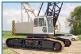
SCX800 80t 2009