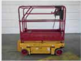
V20355 - Haulotte Optimum 6 - 2004 Electric - 6,35 Mtr. - 961 Hrs. € 2.950