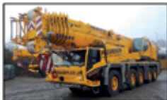
2016 Tadano 220 Ton All Terrain - choice of 2

Meadow Cottages, Northwood Farm, Burndell Road, Yapton, BN18 0HR