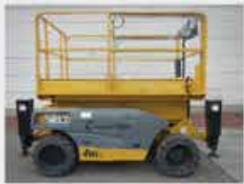
V21488 - Haulotte C100X - 2005 Diesel 4x4 - 10,2 Mtr. - 466 Hrs. € 7.500