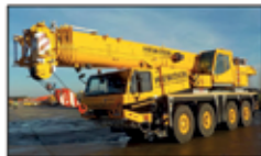
2014-15 Tadano ATF100G-4 100 Ton All Terrain - choice of 11