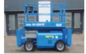
Genie - GS3268RT Scissor lifts

Diesel, 4x4 11.0m Working Height, 2003 | PHM-Id 08637