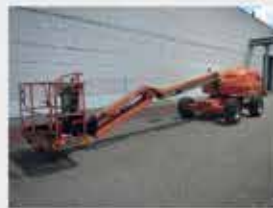
V19637 - JLG 4605J - 2007 Diesel 4x4 - 16,02 Mtr. - 3359 Hrs. € 18.750