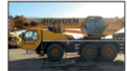
2006-08 Terex Demag AC55L 55 Ton All Terrain - choice of 14