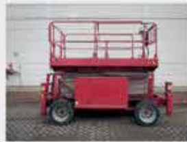
V17359 - Mec 3772RT - 2007 Diesel 4x4 - 13,28 Mtr. - 1120 Hrs. € 8.950