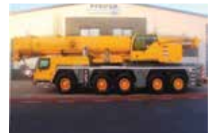
LIEBHERR - LTM1220-5.2 Telescopic Cranes

220t, 10x8x10, Double Jib 60m Boom, 22m + 3x7m jib, 2010 | PHM-Id 08714