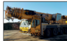
2006-09 Terex Demag AC80-2 80 Ton All Terrain - choice of 11