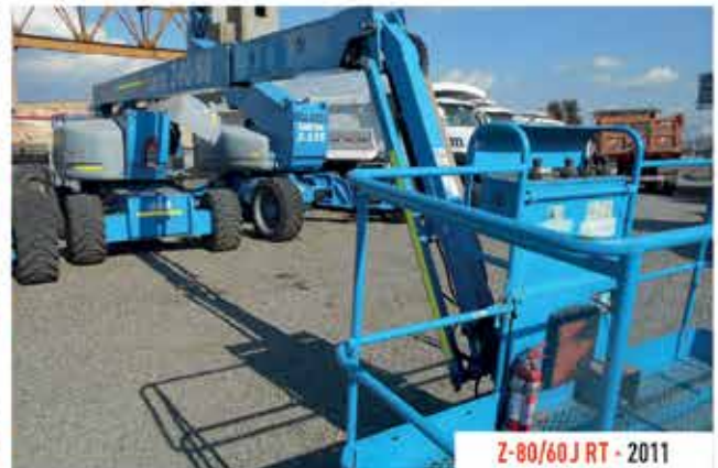
Z-80/60J RT · 2011