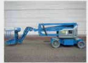
V21240 - Genie Z40-23NRJ - 2014 Electric - 14,32 Mtr. - 15 Hrs. € 32.500 - Demo