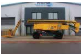
HAULOTTE - HA41PX Articulating boom lifts

Diesel, 41.0m Working Height, 2008 | PHM-Id 07464