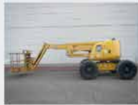
V21883 - Haulotte HA16PXNT - 2005 Diesel 4x4 - 16 Mtr. - 3134 Hrs. € 13.500