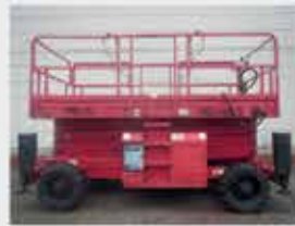
V21787 - Haulotte H15 SX - 2007 Diesel 4x4 - 15 Mtr. - 1846 Hrs. € 12.500