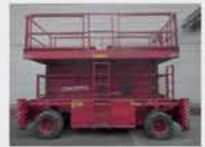
V22085 - Hollandlift B-195DL25 - 2007 Diesel 4x4 - 21,5 Mtr. - 4586 Hrs. € 32.500