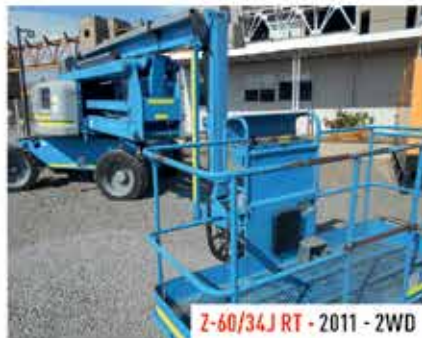
Z-60/34J RT · 2011 - 2WD