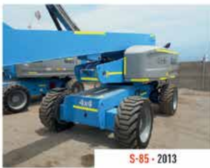
S-85 · 2013