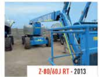
Z-80/60J RT · 2013