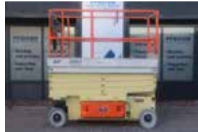
JLG - 3246ES Scissor lifts

Electric, 4x2 Drive, 11.0m Working Height, 2011 | PHM-Id 08771