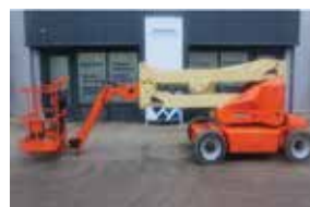
JLG - M450AJ Articulating boom lifts

Bi-Energy, 15.0m Working Height, 2011 | PHM-Id 08793