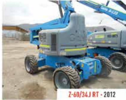
Z-60/34J RT · 2012