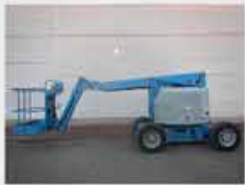
V20845 - Genie Z34-22RT - 2007 Diesel 4x4 - 12,62 Mtr. - 2669 Hrs. € 13.950