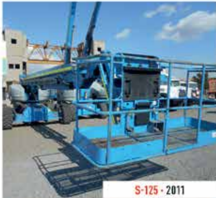
S-125 · 2011