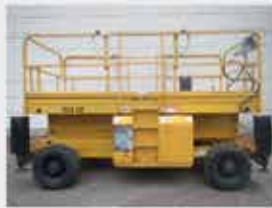
V21104 - Haulotte H125X - 2007 Diesel 4x4 - 12 Mtr. - 1706 Hrs. € 11.950