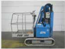
V21229 - ATN Pfaf 560 - 2001 Electric - 5,6 Mtr. - 76 Hrs. € 4.950