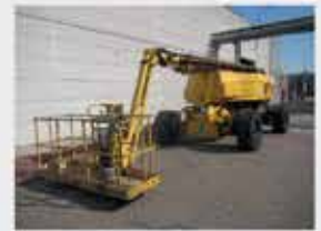
V20254 - Haulotte HA32PX - 2005 Diesel 4x4 - 32 Mtr. - 4480 Hrs. € 42.500