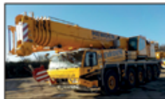
2014-16 Tadano ATF130G-4 All Terrain - choice of 4