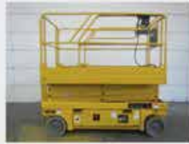
V21544 - Haulotte Compact 10 - 2005 Electric - 10,14 Mtr. - 21 Hrs. € 4.500