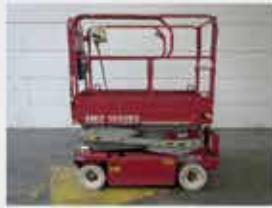
V19814 - Mec 1932ES - 2008 Electric - 7,79 Mtr. - 108 Hrs. € 3.500