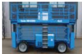
Genie - GS5390RT Scissor lifts

Diesel, 4x4 18.0m Working Height, 2003 | PHM-Id 08711