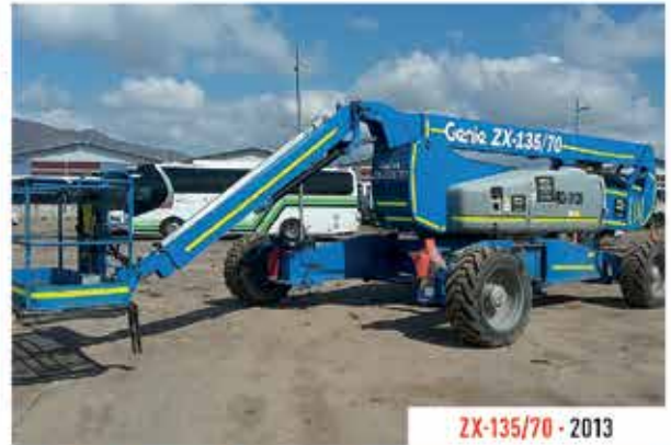
ZX-135/70 · 2013