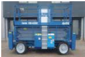
Genie - GS4390 Scissor lifts

Diesel, 4x4 15.0m Working Height, 2002 | PHM-Id 08654