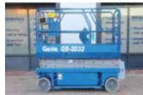
Genie - GS2032 Scissor lifts

Electric, 4x2 Drive, 8.0m Working Height, 1999 | PHM-Id 08660