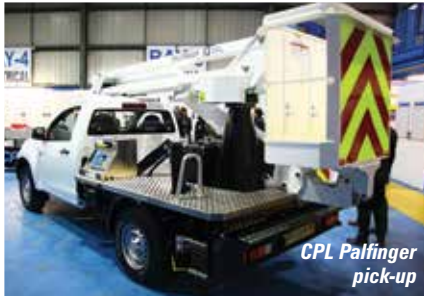
CPL Palfinger pick-up