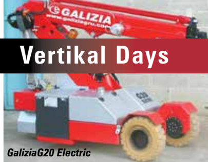
Galizia G20 Electric