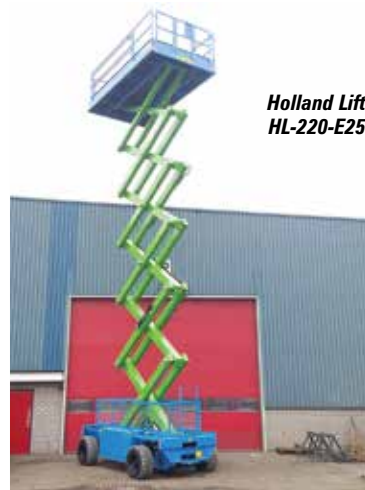
Holland Lift HL-220-E25