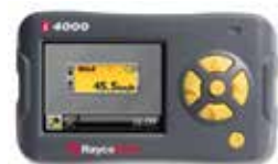
Rayco Wylie i4000