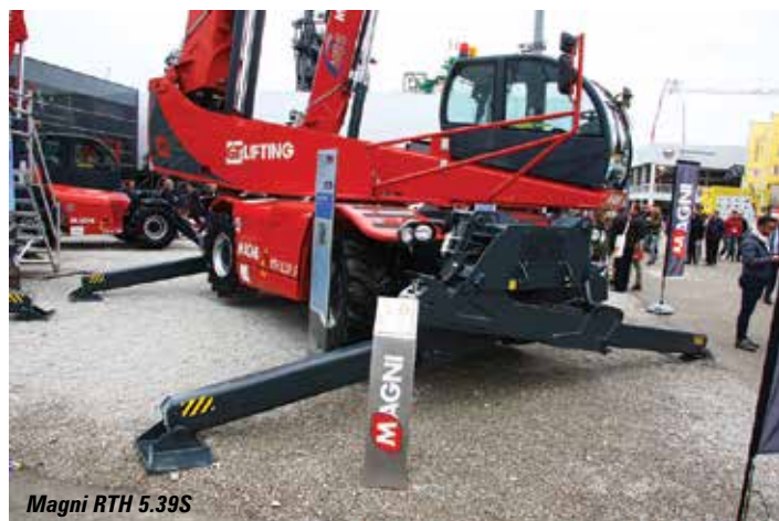
Magni RTH 5.39S

Liebherr will use Vertikal Days for the European launch of its new 90 tonne four axle LTM 1090 4.2 All Terrain crane which was unveiled at Conexpo. It features a 60 metre main boom, variable counterweight and can be configured for 10 tonne axle loadings. Also on display will be the 100th 60 tonne LTM 1060 to be delivered in the UK.