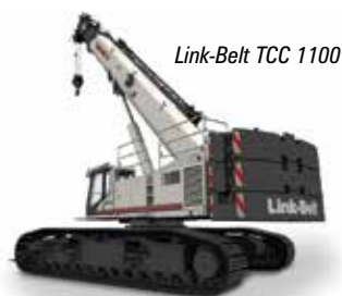
Link-Belt TCC 1100