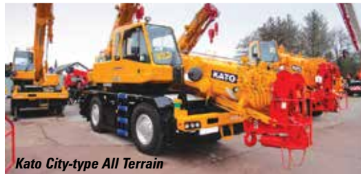
Kato City-type All Terrain