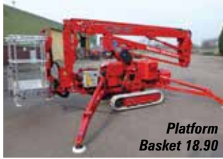
Platform Basket 18.90