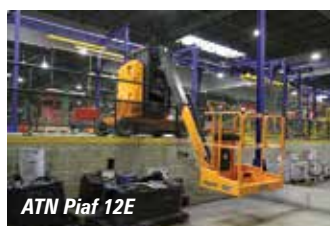
ATN Pifaf 12E

If you are interested in spider cranes, Jekko will use Vertical Days for the UK launch of its all-new JF