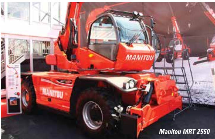
Manitou MRT 2550