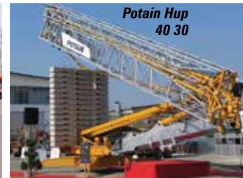
Potain Hup 40 30