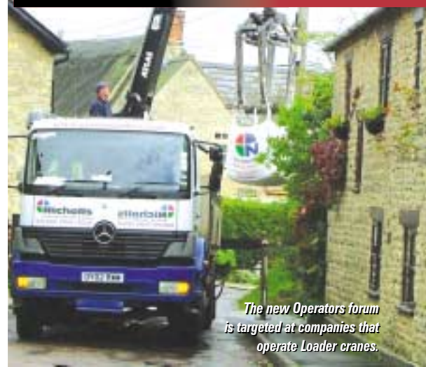
The new Operators forum is targeted at companies that operate Loader cranes.